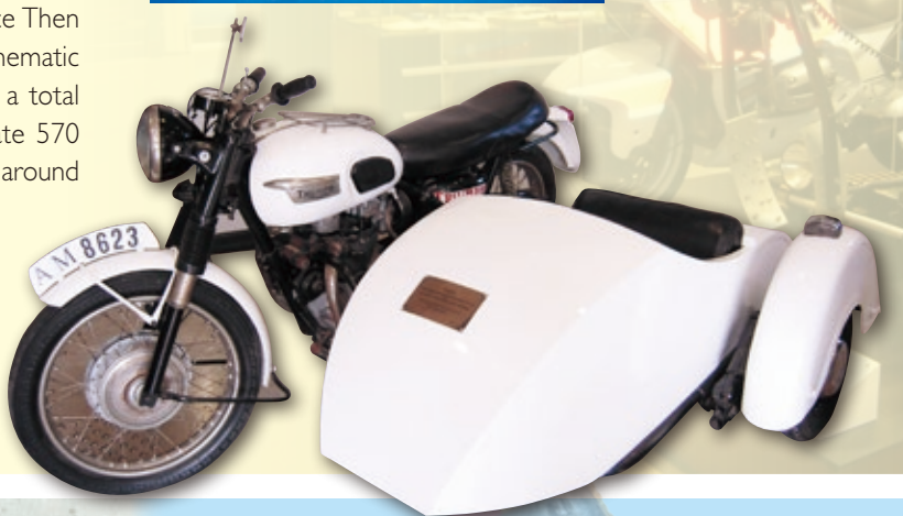
一九六零年代「凱旋牌」帶邊斗電單車 A "Triumph" motorcycle with side car in the 1960s

The Museum has a small souvenir counter at the foyer with souvenirs like postcards, historical photo set and stationery, as well as publications on the history of the Force available for sale.