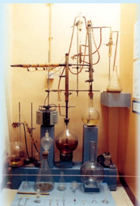
舊式海洛英製造工場 Old Heroin manufacturing laboratory

展覽介紹本地三合會組織，包括其歷史源流、活動及其成員所信奉的規條和採用的儀式。此外展覽亦會簡介毒品的種類及運毒方法，包括毒品樣本、吸食及運毒工具和一個舊式的海洛英製造工場。