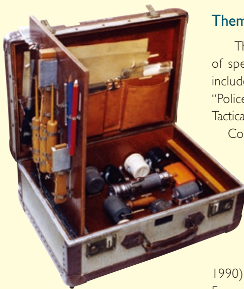
一九五零年代使用的「証物搜集箱」 Scenes of 'Crime Kit Box' used in the 1950s