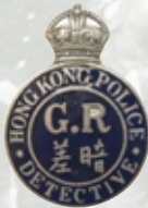
一九二零年代警隊偵探徽章 Hong Kong Police Detective's Badge, 1920s.