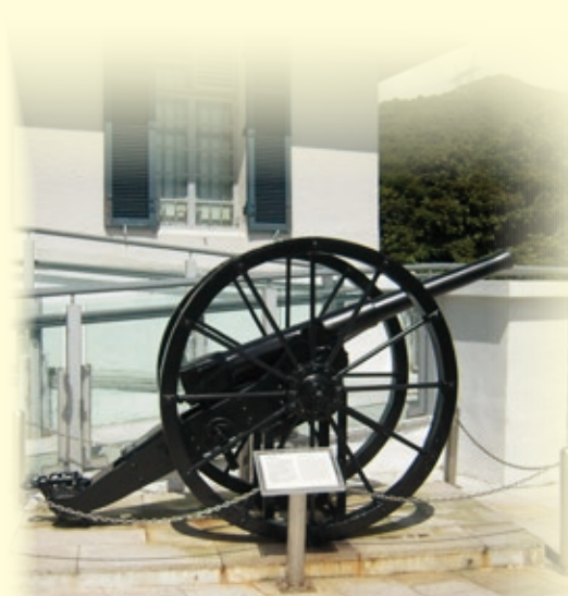
一八九六年製造的「野戰砲」 "Field Gun" produced in 1896

博物館共有四個展覽廳，包括警隊歷史展覽廳、三合會及毒品展覽廳、警隊今昔展覽廳以及專題展覽廳，總面積約五百七十平方米，展品數目約六百餘件。