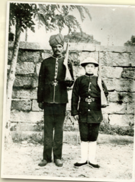
早期印籍及華籍警員制服 Early Indian and Chinese Police Uniforms

此展覽廳用作舉辦不同主題的展覽。過去曾舉辦的專題展覽包括「水警」、「交通警察」、「警署」、「警察制服」、「警察機動部隊」、「警犬隊」、「中國近代警察文物珍品展」、「在最前線上：香港警隊護送任務四分一世紀的回顧與前瞻(1986-2011)」、「智勇誠毅：一起走過警察少年訓練學校的日子(1973-1990)」、「警隊通訊發展史：與通訊科息息相關」等。