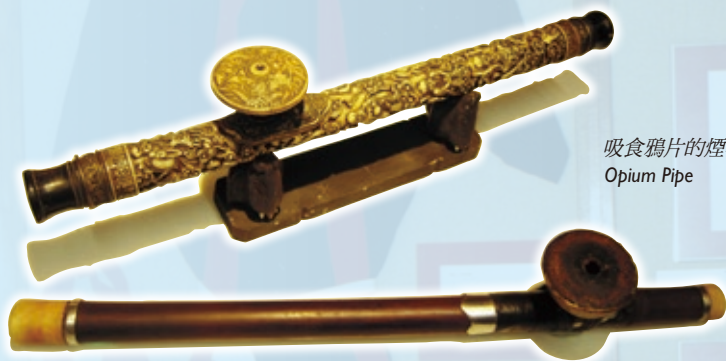
吸食鴉片的煙槍 Opium Pipe