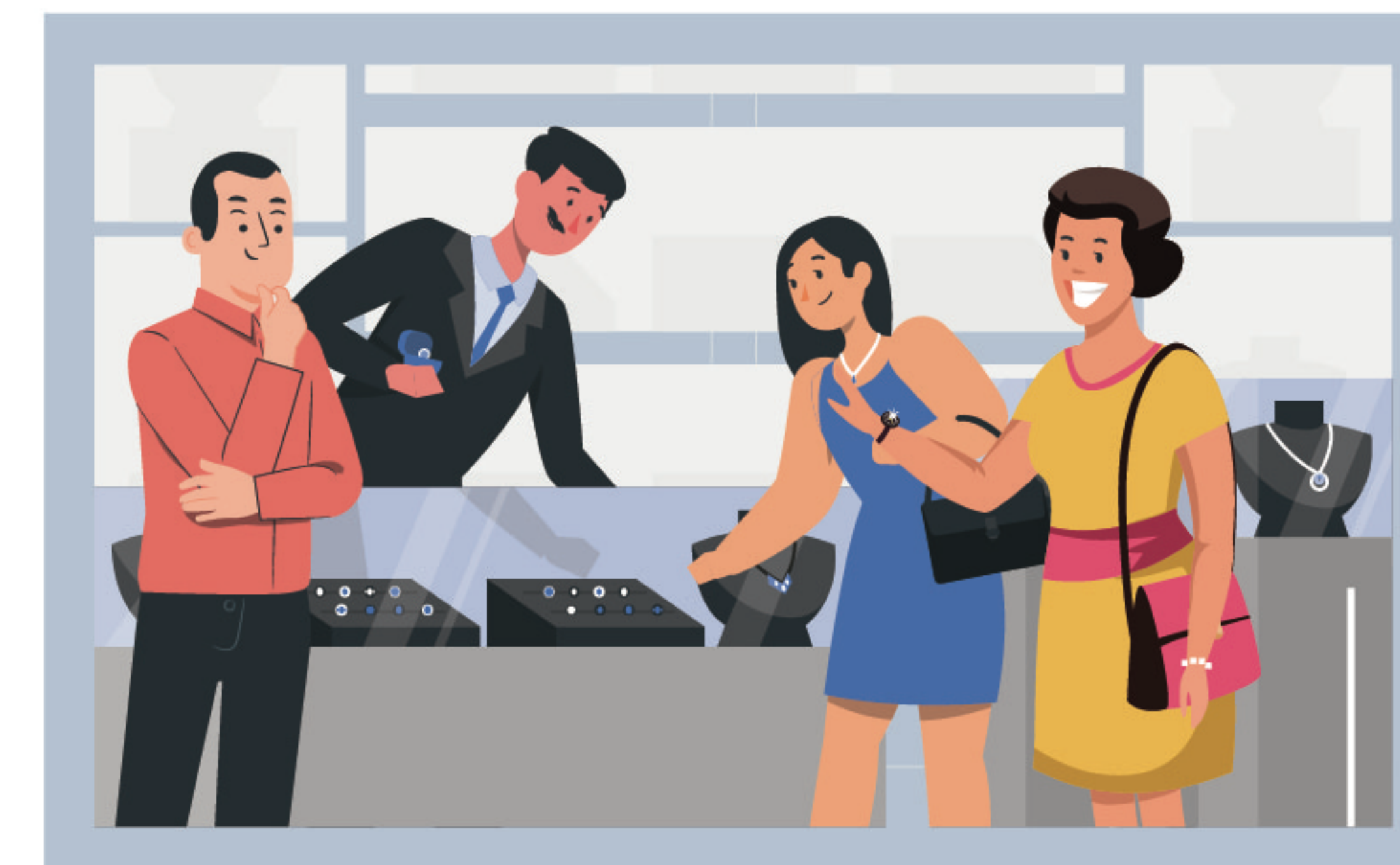
Insufficient shopkeepers / Too many customers

Times when crimes are most likely to occur