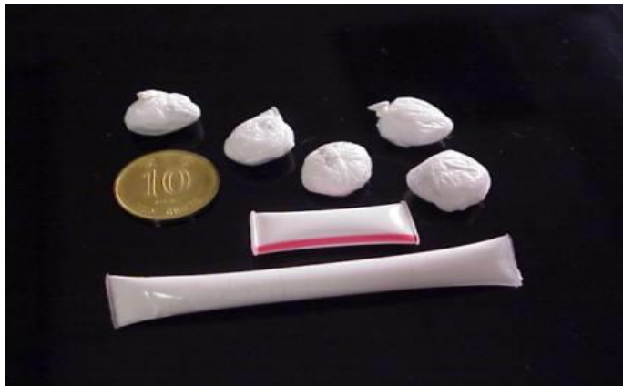
Common packaging of Heroin