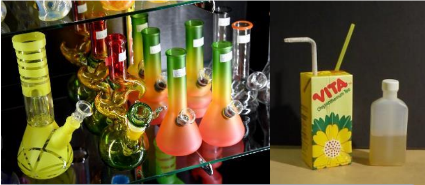
Bongs are often used for drug abuse