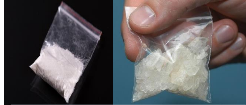
Powder-like/crystal-like substance contained in resealable bags