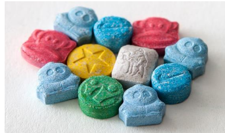
Ecstasy often comes in colorful pills and in different patterns