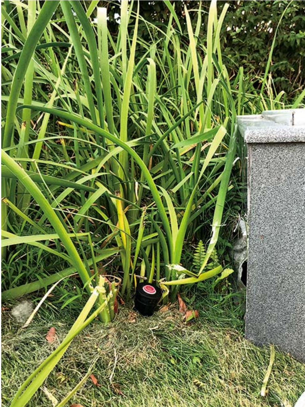
Yau Ma Tei Police Station has installed a rainwater recycling system.

Flow controllers for water taps have been installed in most Force buildings to reduce water consumption. The Yau Ma Tei Police Station operates a rainwater recycling system, which collects rainwater and air-conditioning condensed water for plant irrigation.