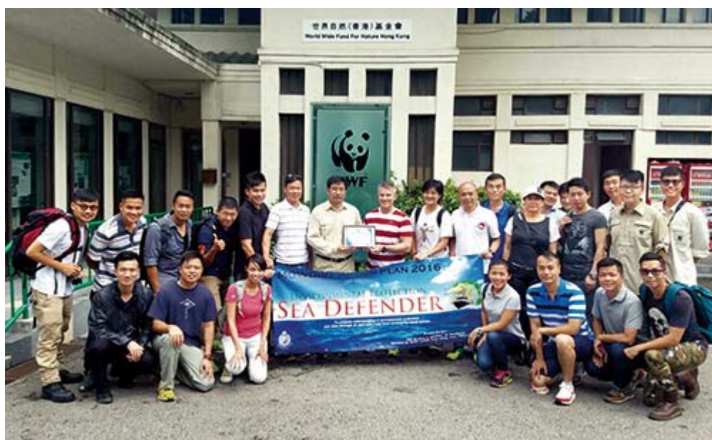
Staff on a “Sea Defender” eco-visit.

activities, and are regularly promoted at briefings, meetings and training days. Green Ambassadors and Green Wardens have been appointed to develop green initiatives and to encourage Force members to participate in green activities. For instance, the “Sea Defender” project, organised by Marine Outer Waters District officers, conducts environmental visits for staff to places such as Mai Po Nature Reserve, the Swire Institute of Marine Science and the Ocean Park Conservation Foundation, to enhance awareness of environmental issues. Another initiative is “bookcrossing”, or passing on books after reading. Boxes for book donations are provided in the Force Library and the Police Sports and Recreation Club. Force members can visit designated bookcrossing points to select books and return them after reading.