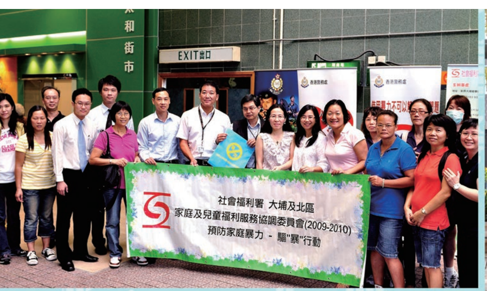
警方与社会福利署合办「驱暴行动」,向居民宣传预防家暴信息。 The Police and Social Welfare Department organise a publicity campaign to promote the prevention of domestic violence.