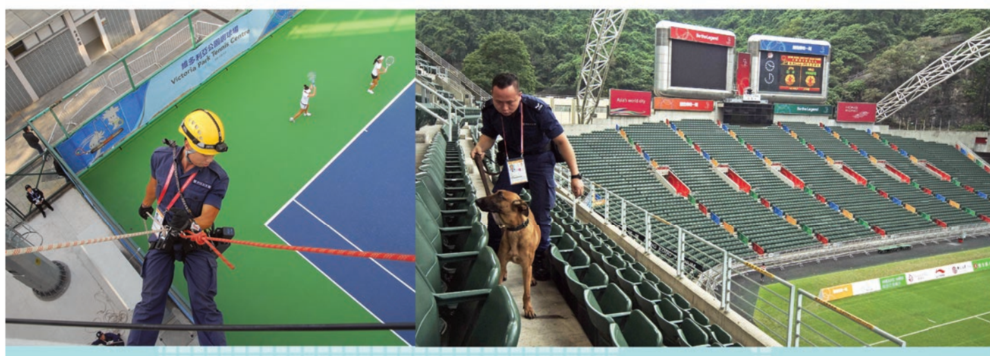
警察搜查队人员为东亚运动会的场地进行高空搜查。 A FSU officer conducts a high-rise search at one of the East Asian Games venues.