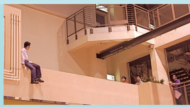
警察谈判组人员进行游说训练。 PNC officers conduct a suicide intervention exercise.