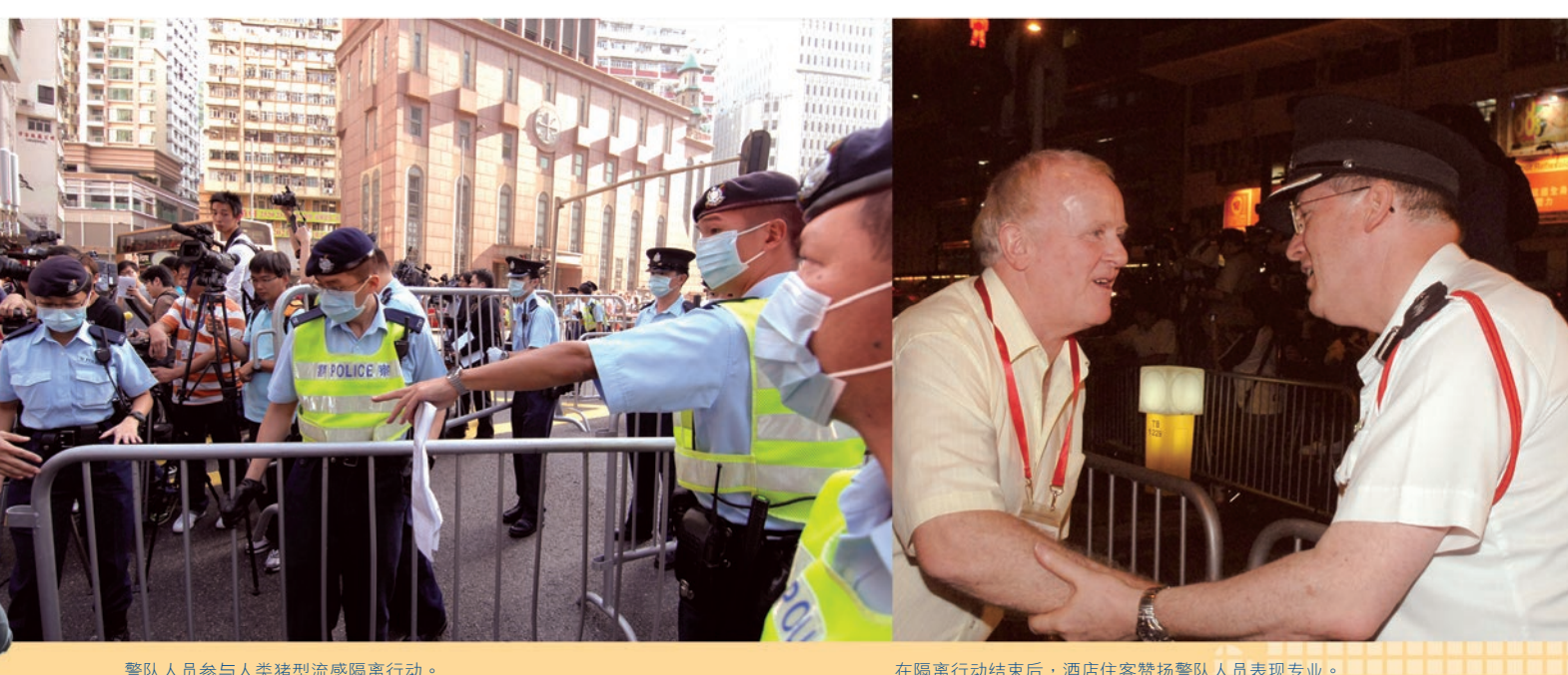
警队人员参与人类猪型流感隔离行动。 Police officers take part in the human swine influenza quarantine operation.

Apart from combating crimes locally, the sharing of intelligence with overseas countries during 2009 culminated in the successful neutralisation of a Hong Kong-based burglary syndicate in Singapore. Another highlight of the year was a large-scale anti-youth drug abuse education and publicity campaign organised in partnership with the Narcotics Division and Action Committee Against Narcotics. The event, which achieved a place in the Guinness World Records, involved over 3 300 students producing the largest ever 'Say No to Drugs' finger painting.