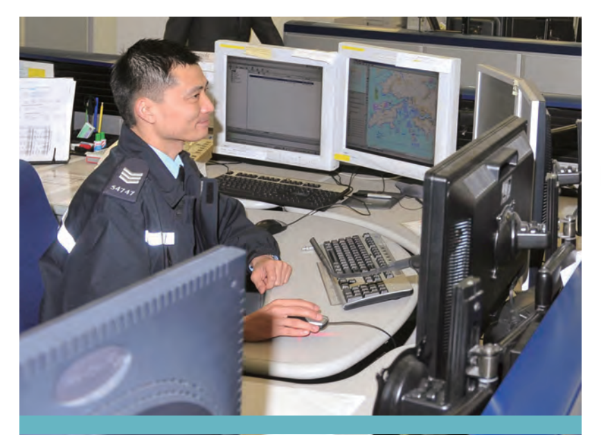
水警總區「海上警視系統」內的「中央指揮系統」,獲得2011 香港資訊及通訊科技獎三項大獎。 The Central Command System of the Versatile Maritime Policing Response Project wins three awards in the Hong Kong Information and Communications Technology Awards 2011.

More than 1 500 network computer terminals were replaced in 2011 and nearly 3 000 new desktop and notebook computers were distributed to officers, thereby ensuring that they are equipped to provide services as efficiently as possible to the public.