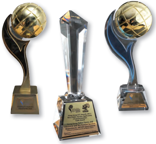
三項大獎分別是全年大獎、最佳公共服務應用大 獎及最佳公共服務應用(電子轉化)金獎。 The three awards are Award of The Year, Best Public Service Application Grand Award and Best Public Service Application (Transformation) Award.