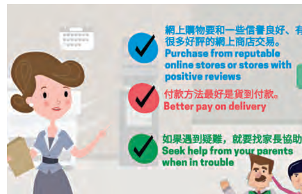
▲ The first animation covers tips on preventing online shopping scams.