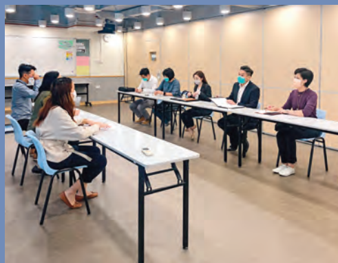
▲ JPS HKI officers (right row) exchange views with representatives of the Methodist Centre on the cooperation to support arrested youths.

During the meeting, both parties expressed their expectation for the support service and actively exchanged views on large-scale arrests, case referrals, liaison and follow-up matters, thereby enhancing their mutual understanding of each other's role in the CSSS. Consensus was reached on the implementation plan and the direction for future cooperation. Under the CSSS, both parties will continue to provide arrested youths and their families or guardians with timely referral for counselling and support service so as to relieve their stress, reduce recidivism and bring juvenile offenders back on the right track.