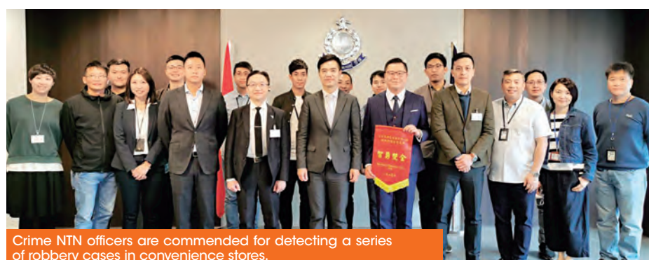
Crime NTN officers are commended for detecting a series of robbery cases in convenience stores.

In February 2020, a number of convenience store robberies occurred in the NTN Region. Upon thorough investigation by Crime NTN, the cases were swiftly detected with four males arrested by the end of February.