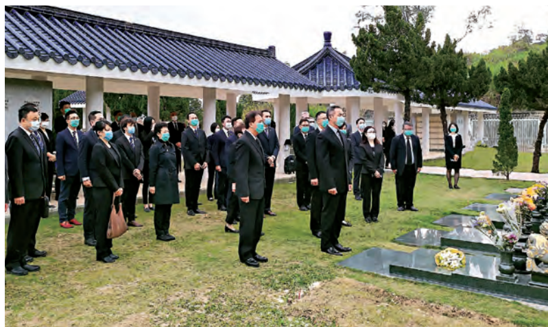
Force representatives pay homage to fallen officers at Gallant Garden.