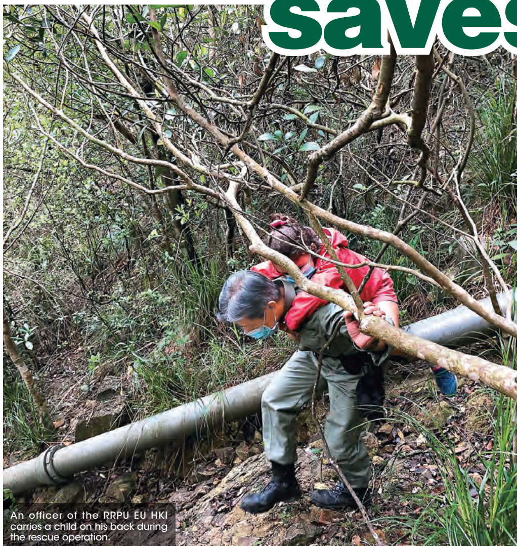
An officer of the RRPU EU HKI carries a child on his back during the rescue operation.

On March 29, the Police received a report that a family of four lost their way whilst hiking along an unnamed path and were trapped near Tai Tam Reservoir on Violet Hill. Officers of the Regional Rural Patrol Unit of Emergency Unit Hong Kong Island (RRPU EU HKI) were then deployed to carry out a rescue operation.