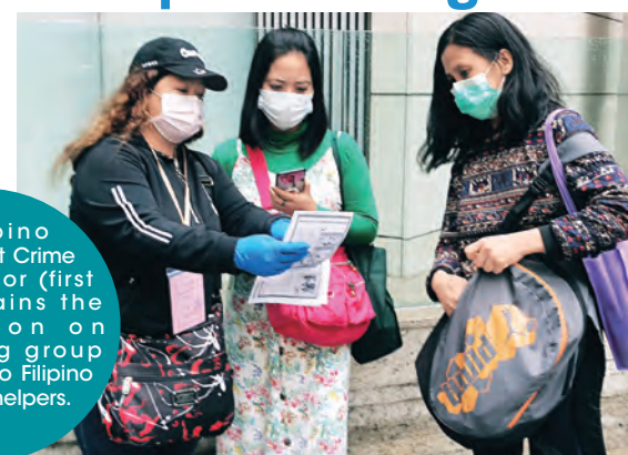
A Filipino CDIST Fight Crime Ambassador (first left) explains the regulation on prohibiting group gatherings to Filipino domestic helpers.

The Filipino CDIST Fight Crime Ambassadors reminded their fellow countrymen in Tagalog to comply with the requirements under the regulation and urge