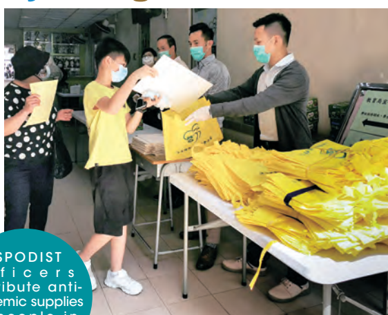
SSPODIST officers distribute anti-epidemic supplies to people in need.

With a view to enhancing the public's understanding of the Prevention and Control of Disease (Prohibition on Group Gathering) Regulation (Cap. 599G) which prohibits group gatherings with more than four people in public places, officers of PCRO SSPODIST and Cheung Sha Wan Division conducted a joint operation with