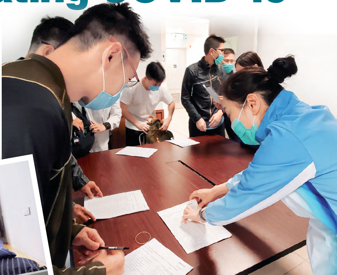
▲A member of the PACC makes the bed at the quarantine centre in Chun Yeung Estate. ▲Members of the PACC hold a meeting with CAS staff at the quarantine centre in Chun Yeung Estate.