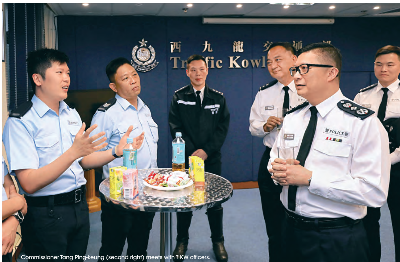
Commissioner Tang Ping-keung (second right) meets with T KW officers.

Meanwhile, the officers talked about the difficulties they had faced in the operation while the Commissioner responded to the officers' concerns on the operation and welfare issues. The Commissioner assured the officers that the Force would take care of their welfare needs as well as that of their family members. The officers felt encouraged by the Commissioner's visit and hoped that the Force could stop violence and curb disorder under the Commissioner's leadership and restore social order soon.