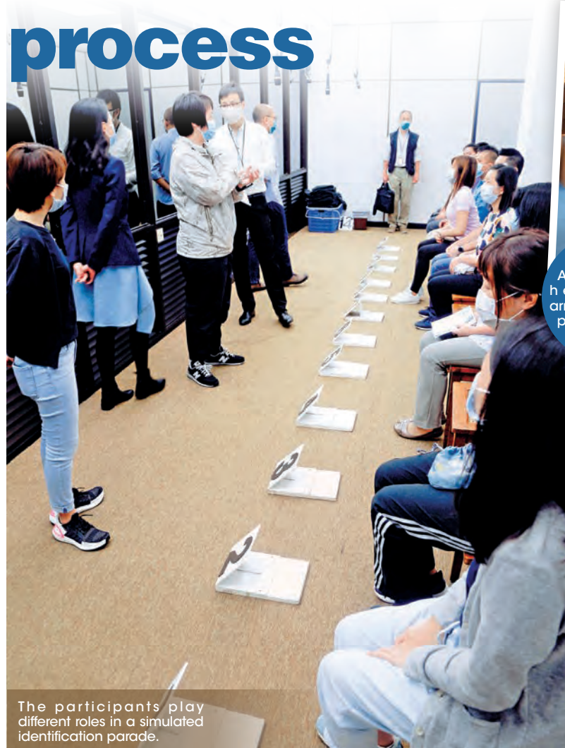
The participants play different roles in a simulated identification parade.

The participants were then interviewed by the Duty Officer in the report room at the police station. They could ask the Duty Officer questions by using the "scenario cards". The scenarios included going to the toilet, meeting a lawyer as well as requesting for meals and medication. This enabled the participants to understand the role of the Duty Officer, the rights of the arrestees and the Police's responsibilities to the arrestees. Afterwards, the participants experienced detention at Tsing Yi Police Station. Detention facilities including hot water showering facilities and fans as well as personal hygiene packs were