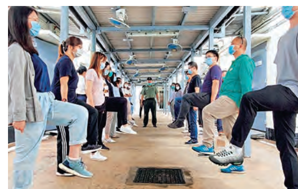
▲ The participants experience foot drill training at a prison.