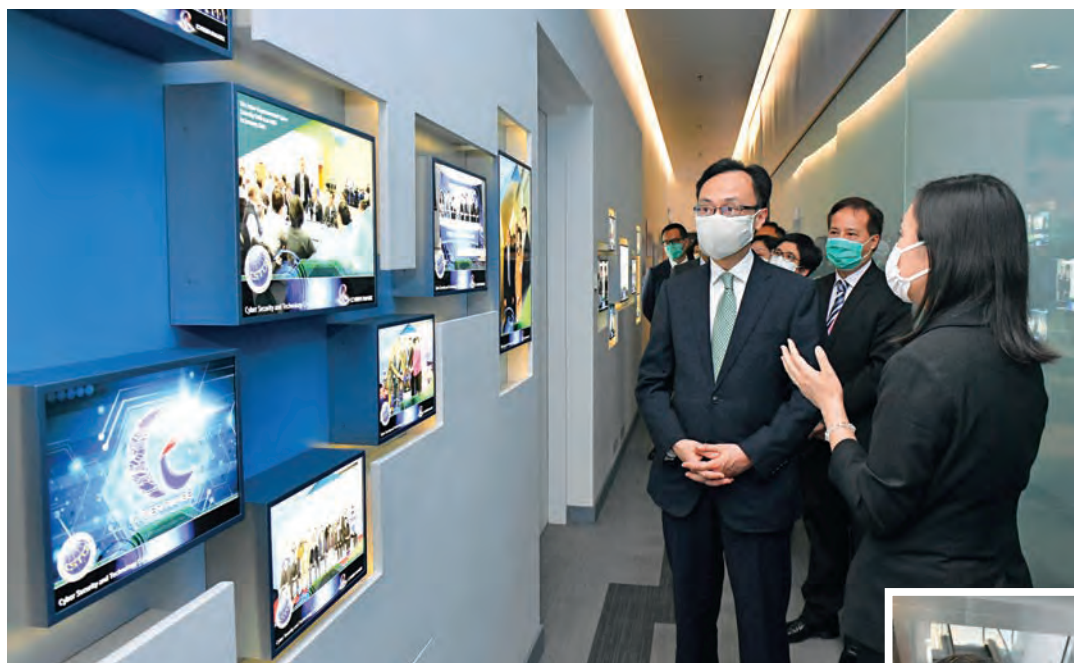
▲ The Secretary for the Civil Service, Mr Patrick Nip (third right), is briefed on the work of the Cyber Security and Technology Crime Bureau.

Mr Nip then proceeded to the Cyber Security and Technology Crime Bureau to receive an update on the bureau's work in combating technology crime and safeguarding cyber security in Hong Kong, as well as on the challenges ahead. He also toured the Cyber Range, and