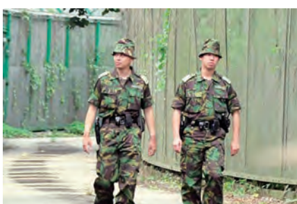
▲ BORDIST officers conduct patrol.