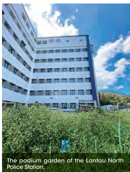
The podium garden of the Lantau North Police Station.