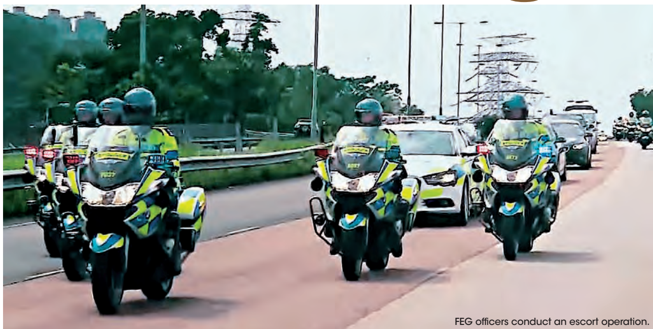
FEG officers conduct an escort operation.

The Force has partnered with Hong Kong Open TV to produce a police documentary entitled "Everlasting Mission". From May 16, the programme is being broadcast on eight consecutive Saturdays at 11pm on Channel 77 of Hong Kong Open TV.