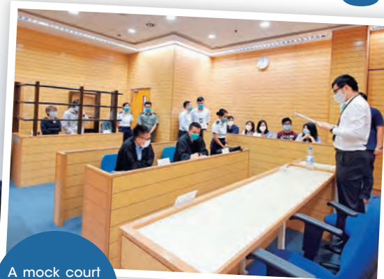
A mock court hearing is arranged for the participants.

The afternoon session of the activity took place in Stanley Prison and Ma Hang Prison. A mock court hearing was arranged for the participants. Afterwards, under the escort of CSD staff, the participants boarded the prison van and started their lives "in prison". CSD staff explained the activities of the persons in custody including reception procedures, custody in single cells, foot drill training and meal procedures to the participants. They also arranged young rehabilitated persons to share their experiences.