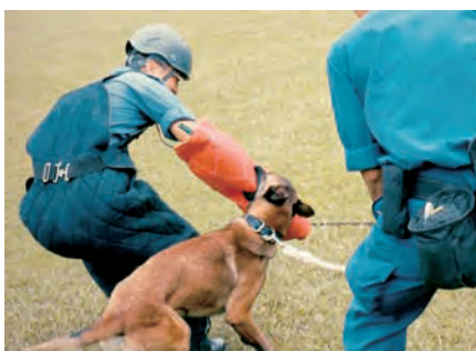
▲ PDU officers give training to police dogs.

immigration operations, BORDIST officers also introduce their defence line and the MacIntosh Fort. Meanwhile, dog handlers of the PDU talk about how to choose appropriate stray dogs to undergo training for police dogs, the daily duties of police dogs as well as how police dogs search for explosives and undergo tracing training.