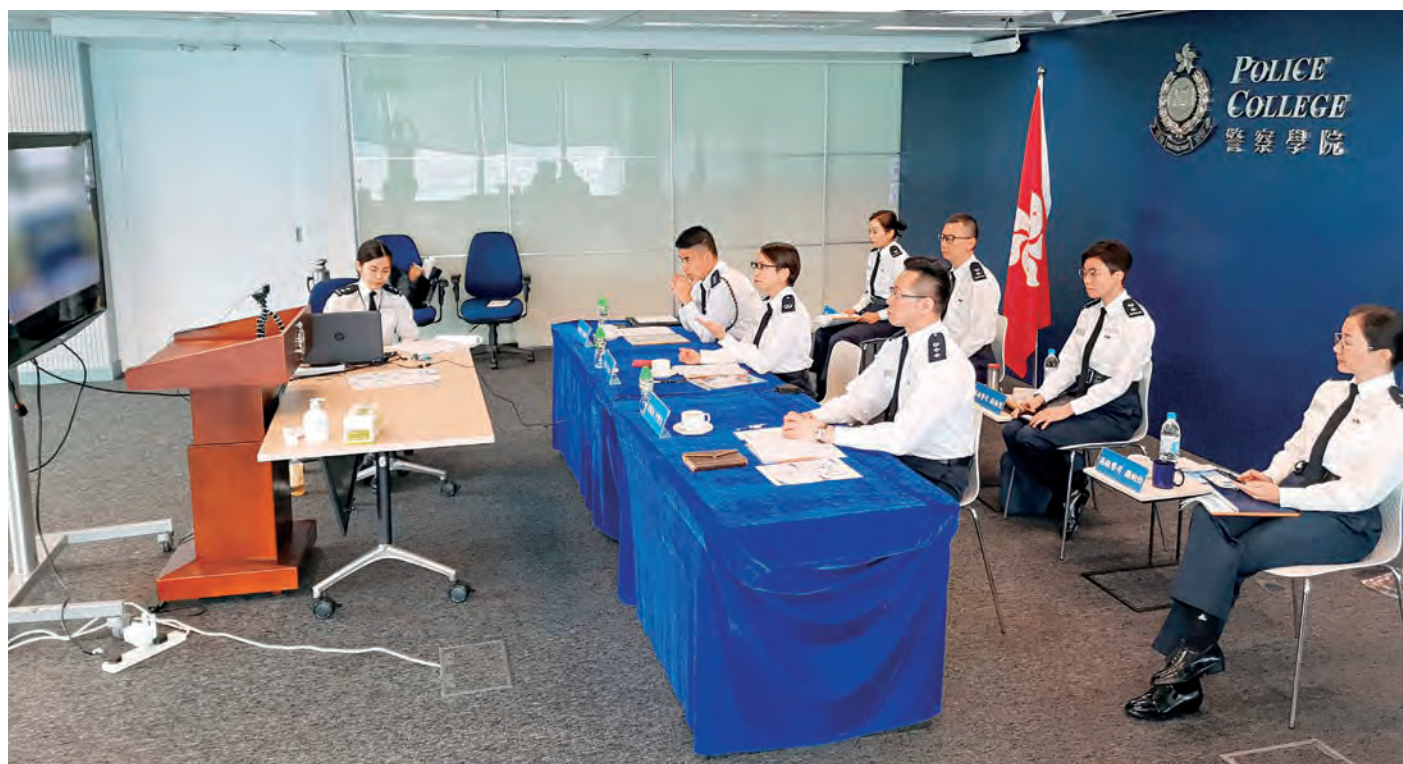
Management of the HKPC holds a video conference with a training counterpart.

Physical distancing does not stop our effort in partnership building. With the use of technology, the HKPC remains committed to networking and identifying training needs with its training partners far and near.