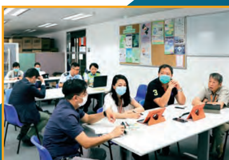
► Officers take part in the webinar at the NTS Regional Headquarters.