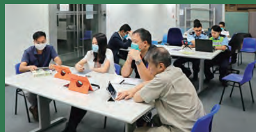
▲一眾人員在新界南總區總部參與網上研討會。