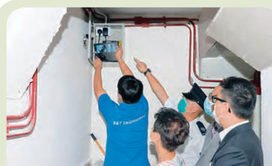
◀ An installation work of CCTV system is conducted in a building.