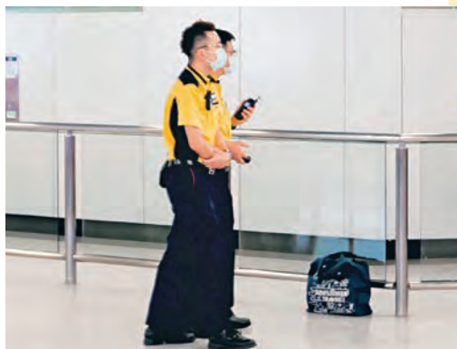
▲ MTRCL staff handle a simulated suspicious object during an exercise.

drills and exercises over the past couple of months to enable MTRCL staff to put security knowledge into practice. The latest being Exercise IRONFAN which took place between March and May 2020. During the exercise, a simulated suspicious object was placed at selected MTR stations in order to test the alertness, response and knowledge of MTRCL staff in handling suspicious objects. The exercise was concluded with positive outcomes. RAILDIST and the MTRCL will continue to work together to ensure the security and safety of the railway network in Hong Kong.