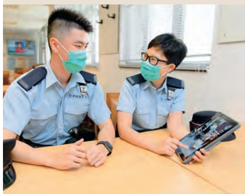
▲ CDIST officers are glad that they could offer a helping hand to the old lady.

A small role? But profound impact! Everyone can help build a more cordial and harmonious city by walking an extra mile and showing empathy.