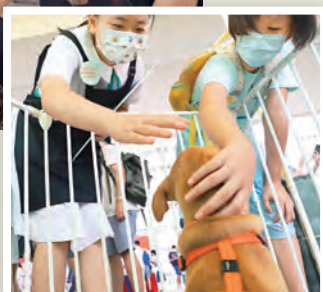
▶ A booth is set up at the KE animal carnival to encourage members of the public to adopt abandoned animals.