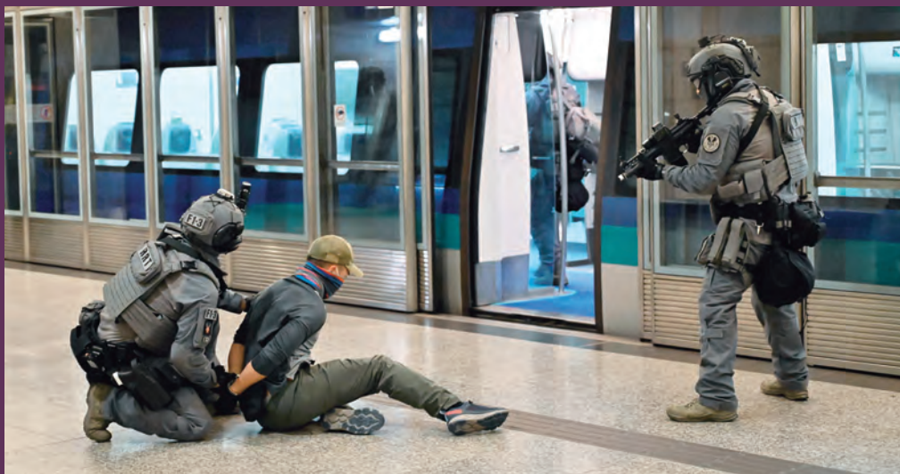
►鐵路應變部隊人員在月台上制服恐怖分子。 Officers of the Railway Response Team subdue the terrorist on the platform.