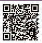
演習片段 Video of the exercise