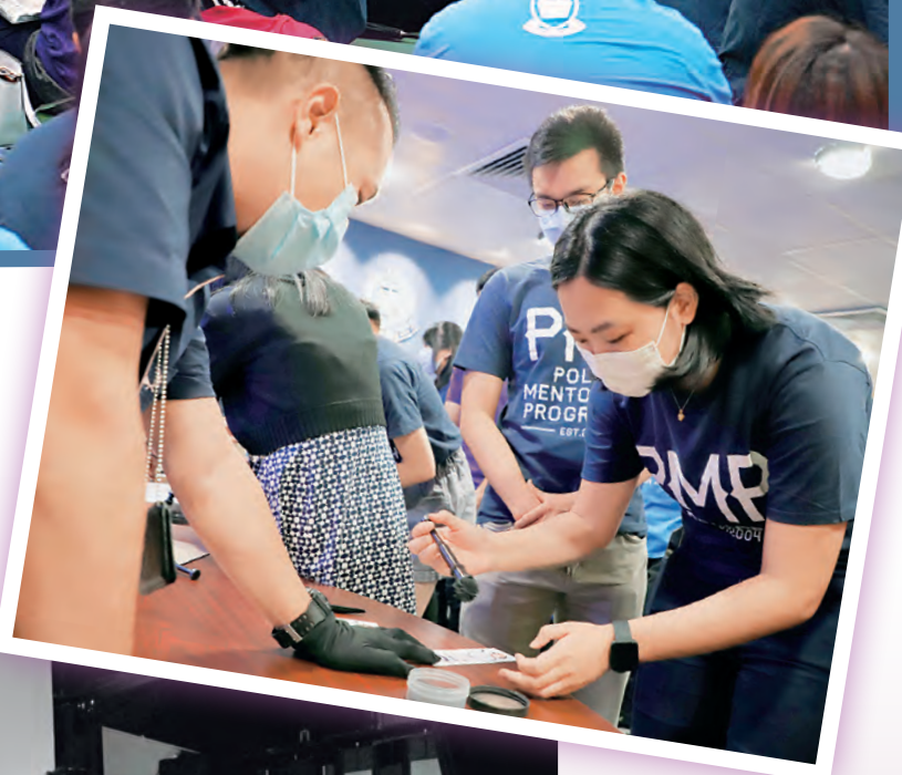
◀ Mentees try out the detective training system "Detective Boulevard" at the Detective Training Centre.