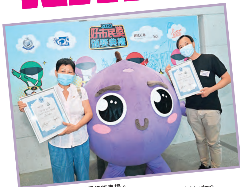
▲好市民協助警方撲滅罪行獲表揚。 GCA awardees are commended for helping the Police fight crime.