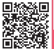
「好市民獎」專輯 GCA highlights