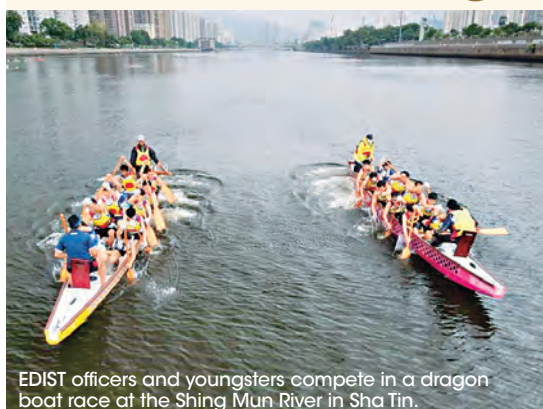
EDIST officers and youngsters compete in a dragon boat race at the Shing Mun River in Sha Tin.

Eastern District (EDIST) held a Dragon Boat Experience Day under "Project Tick Tick" for youngsters at the Shing Mun River in Sha Tin on August 5, with a view to promoting a healthy lifestyle as well as building up team spirit, confidence and resilience of young people. The youngsters and EDIST officers were split into two teams to compete in a dragon boat race.