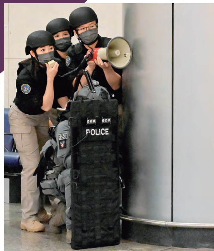
►警察談判組人員與恐怖分子談判。 Officers of the Police Negotiation Cadre negotiate with the terrorists.