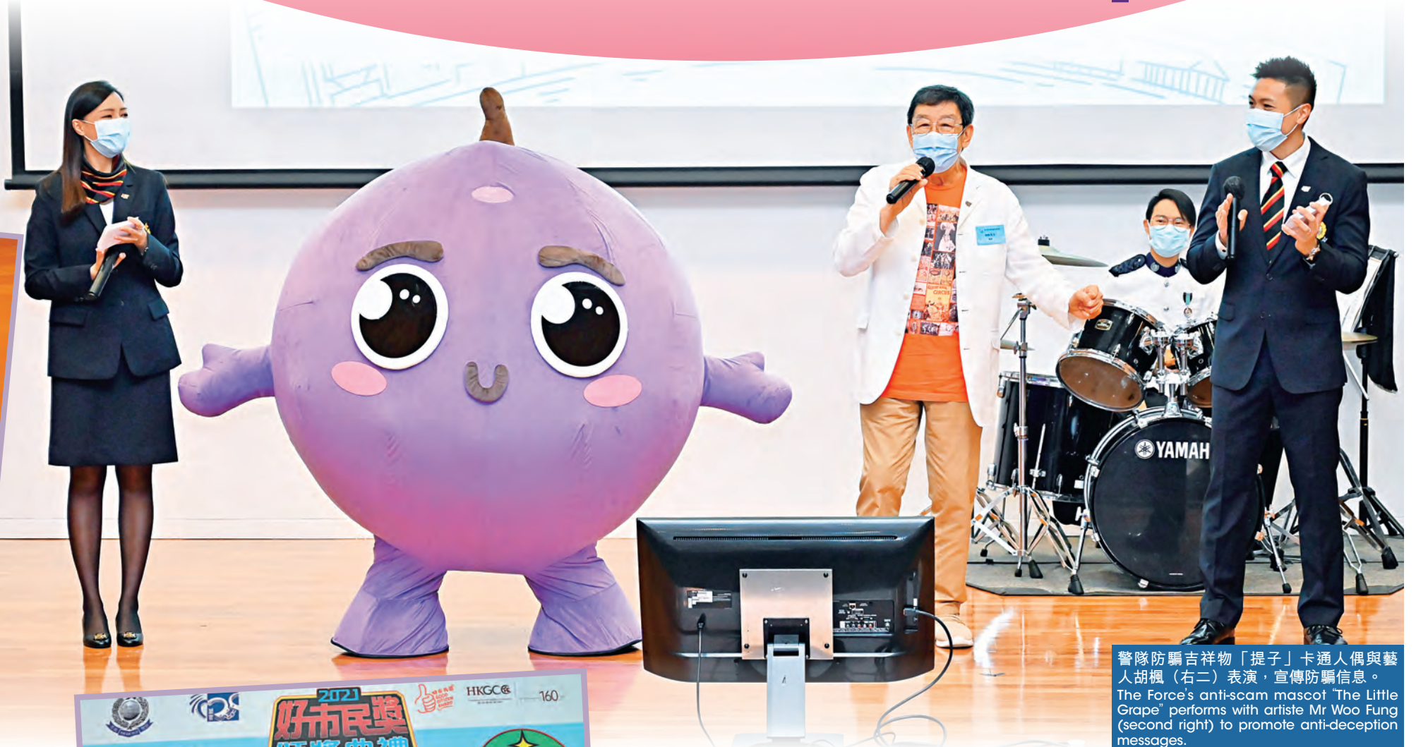
警隊防騙吉祥物「提子」卡通人偶與藝人胡楓（右二）表演，宣傳防騙信息。 The Force's anti-scams mascot "The Little Grape" performs with artiste Mr Woo Fung (second right) to promote anti-deception messages.