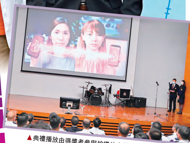
▲典禮播放由得獎者參與拍攝的宣傳短片。 Promotional videos featuring some of the awardees are broadcast at the ceremony.