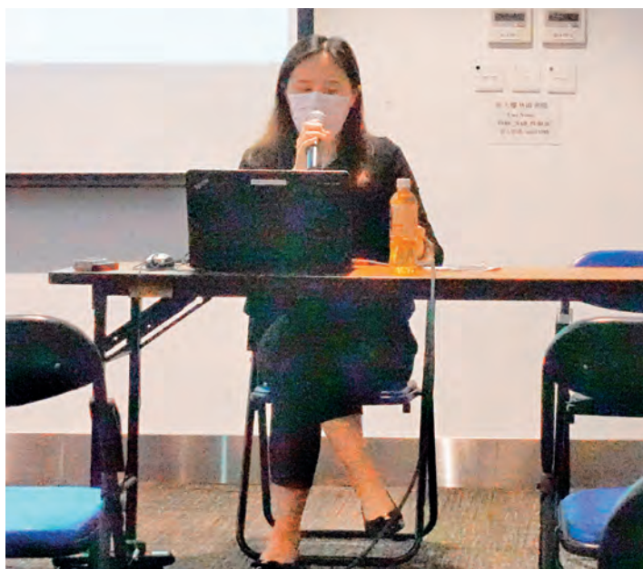
▲ A Public Prosecutor of the Department of Justice explains animal related legislations to the participants.