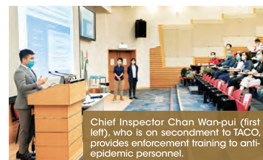
Chief Inspector Chan Wan-pui (first left), who is on secondment to TACO, provides enforcement training to anti-epidemic personnel.

areas and the relevant procedures, with a view to enhancing trainees' awareness of the law and their enforcement abilities. The course strengthened the trainees' investigative abilities, such as the collection of evidence, keeping documentary records and adopting contingency measures under different scenarios.