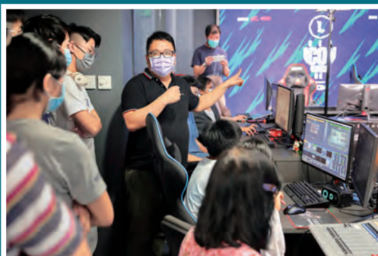
A lecturer shares knowledge of e-sports with the trainees.

This August, the Junior Police Call (JPC) and the School of Professional and Continuing Education of the University of Hong Kong co-organised the third "Foundation Certificate in eSports Science". The course, which is equivalent to Level Two of the Qualifications Framework, covered the history and development of e-sports and event planning, etc. In addition, trainees were provided with placement opportunities to put the acquired knowledge into practice. This year, 13 JPC members