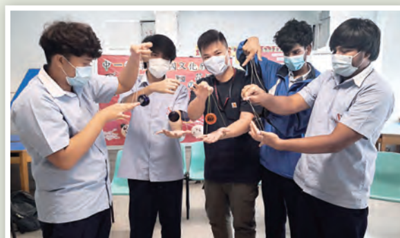
A T-Power ambassador (centre) teaches non-ethnic Chinese youngsters yo-yo tricks.

In February 2018, the Police Public Relations Branch launched a pilot e-sports programme for JPC members with the aim of using e-sports as a platform for enhancing communication with the youth, developing trainees' leadership, management and communication skills as well as nurturing them to become young leaders and crime-fighting partners.