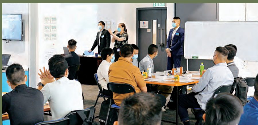
▲ Officers of Police Tactical Units and Patrol Sub-units learn how to use the "Beat App" to conduct record checks.

on persons, vehicles and vessels were conducted with "Beat App". Over 85 per cent of the users agreed that the app's performance is effective and outstanding.