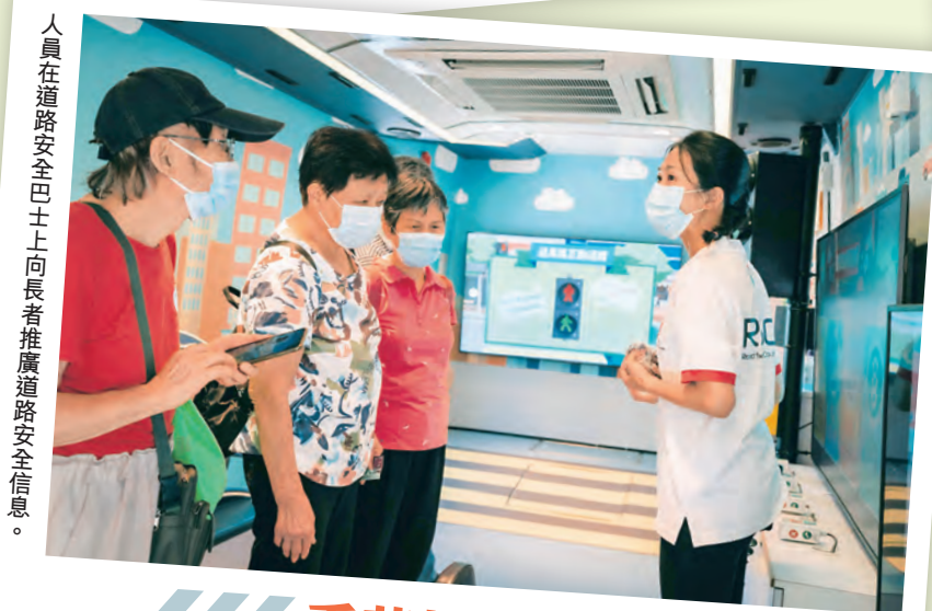
人員在道路安全巴士上向長者推廣道路安全信息。

秀茂坪警區指揮官黃廣興、秀茂坪區耆樂警訊長青團名譽會長會主席林煒橋與會長任威霖、東九龍總區交通部調查及支援組署理警司袁思豪及東九龍總區防止罪案辦公室高級督察馮家恒擔任活動主禮嘉賓。活動亦邀請了藝人李龍基及關浩揚表演，並分享防騙及交通安全資訊。