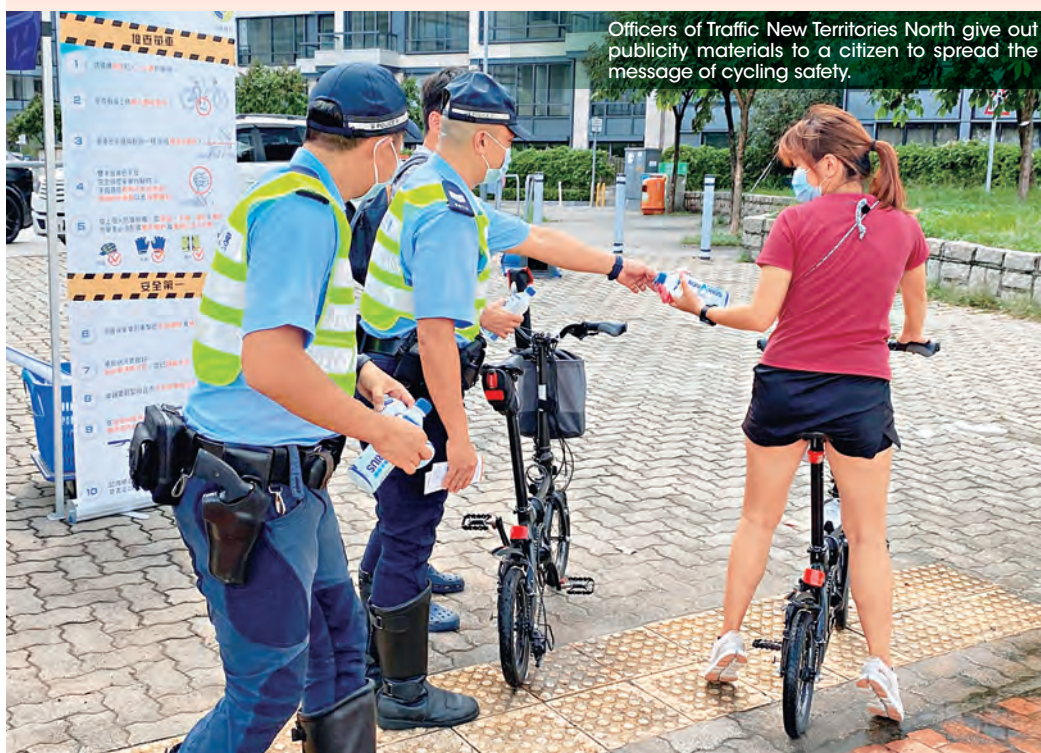
Officers of Traffic New Territories North give out publicity materials to a citizen to spread the message of cycling safety.