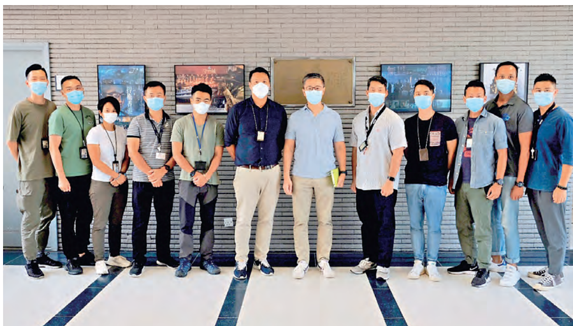
▲ Commissioner Siu Chak-yee (sixth right) visits officers of the Task Force Sub-unit of Marine North Division.

The Commissioner encouraged ABDDIV and MNDIV officers to continue to perform their duties with professionalism and communicate with the public sincerely so as to maintain the positive image of the Force. The officers appreciated the Commissioner's visits and they were confident that they could live up to the Force's motto of "Serving Hong Kong with Honour, Duty and Loyalty" under the Commissioner's leadership.