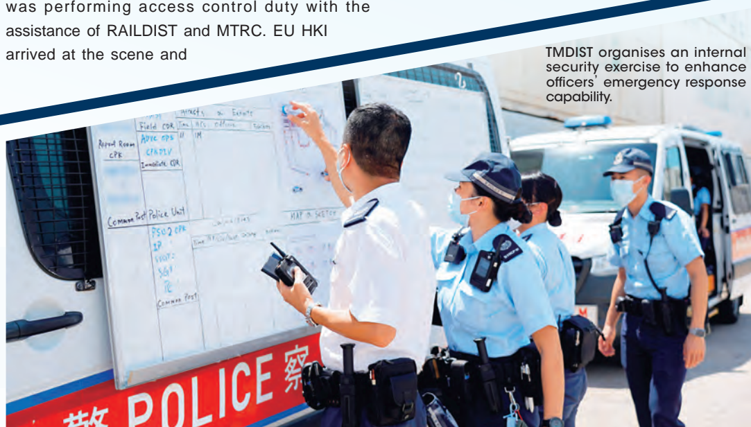
TMDIST organises an internal security exercise to enhance officers' emergency response capability.

The exercise enabled the Force and relevant stakeholders to enhance their capabilities in handling terrorist attacks in the railway system as well as strengthening their communication and collaboration.