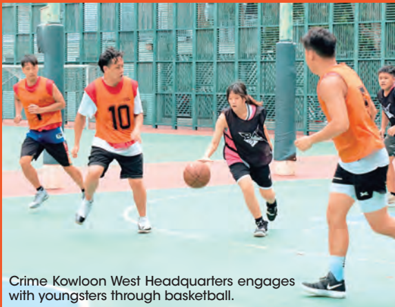
Crime Kowloon West Headquarters engages with youngsters through basketball.