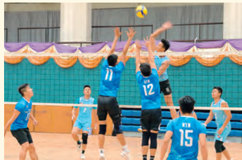
▲ Officers take part in the Inter-Major Formation Volleyball Competition.

Over 100 officers took part in the Inter-Major Formation Volleyball Competition organised by the Police Volleyball Club (PVC) at the Police Sports and Recreation Club