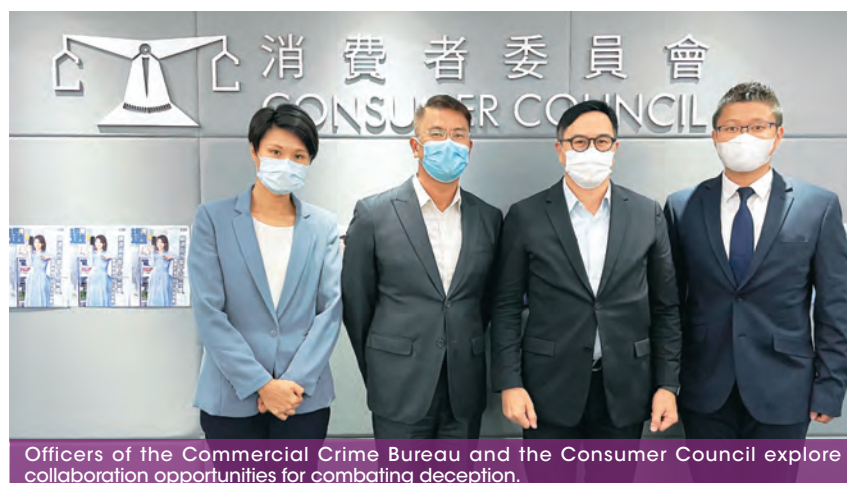
Officers of the Commercial Crime Bureau and the Consumer Council explore collaboration opportunities for combating deception.

The Force will also collaborate with the Consumer Council to provide the latest news and information regarding anti-deception in the Consumer Council's monthly publication "CHOICE Magazine" and on its website, and publicise the telephone hotline of the Anti-Deception Coordination Centre to the public.