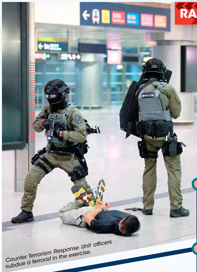
Counter Terrorism Response Unit officers subdue a terrorist in the exercise.