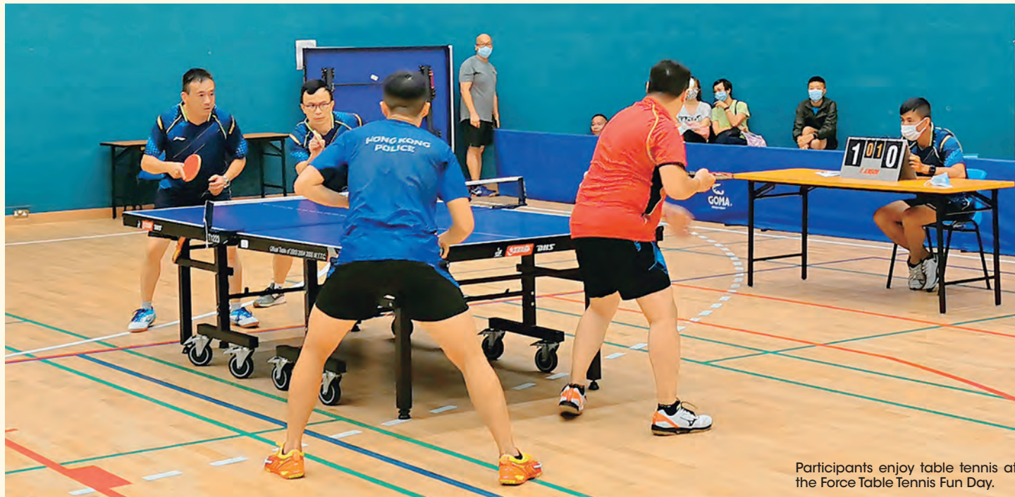
Participants enjoy table tennis at the Force Table Tennis Fun Day.