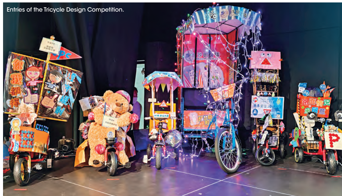
Entries of the Tricycle Design Competition.