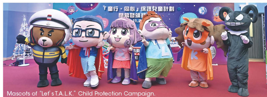
Mascots of "Let's T.A.L.K." Child Protection Campaign.

The "Be a Little Hero" Badge Design Competition attracted participation of more than 150 schools and 10 000 upper primary school students with unlimited creativity. The creative and inspiring