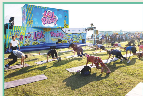
▲ 「Love Our Life-LOL Party」安排運動體驗，提升市民的抗逆能力。 Physical exercise experience of Love Our Life - LOL Party enhances people's resilience.