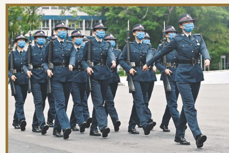
◀ Graduates on the march.