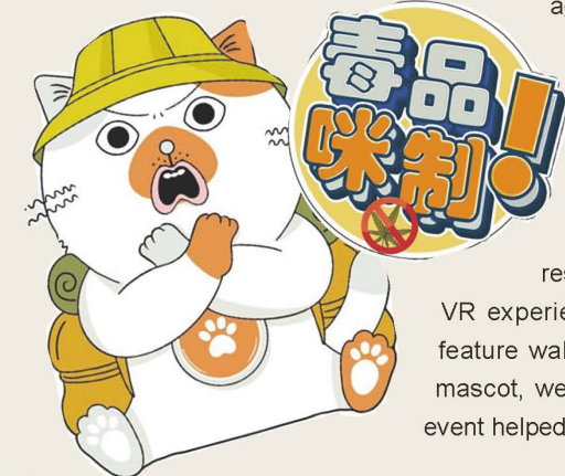
▼ 「禁毒領袖學院」學員設置創意抗毒攤位，以遊戲方式向市民宣傳抗毒信息。 L.I.O.N. members' anti-drug stall promotes anti-drug messages by means of games.