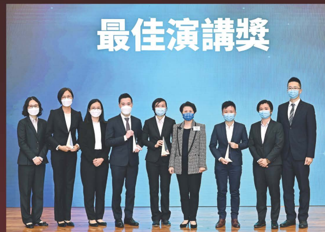
▲署理處長劉賜蕙(右四)頒發獎項予「最佳演講獎」金、銀、銅獎得主。 Acting Commissioner Lau Chi-wai (fourth right) presents the Gold, Silver and Bronze Awards to the winners of the Best Presentation Competition.