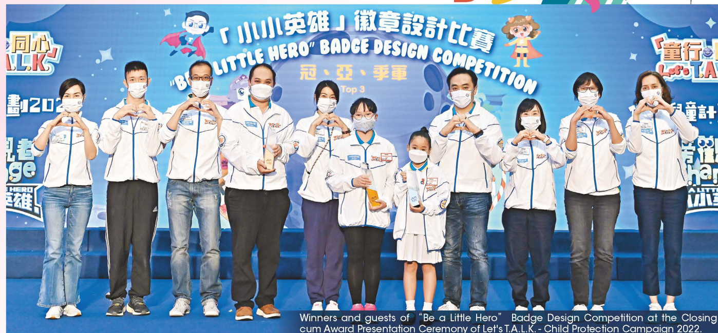
Winners and guests of "Be a Little Hero" Badge Design Competition at the Closing cum Award Presentation Ceremony of Let's T.A.L.K. - Child Protection Campaign 2022.

The Deputy Commissioner (Operations) expressed gratitude to the enthusiastic supporters of the Campaign