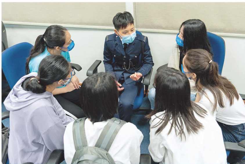
An ex-member shares experience with Project ACHIEVE members.