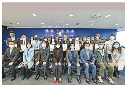
▲ Guests and awardees of PAC Annual Award Presentation Ceremony.

present. These clubs of diverse nature actively promote healthy lifestyles. Colleagues who are interested in joining the Arts Clubs may call 2860-3298 to contact the Secretary of PAC.