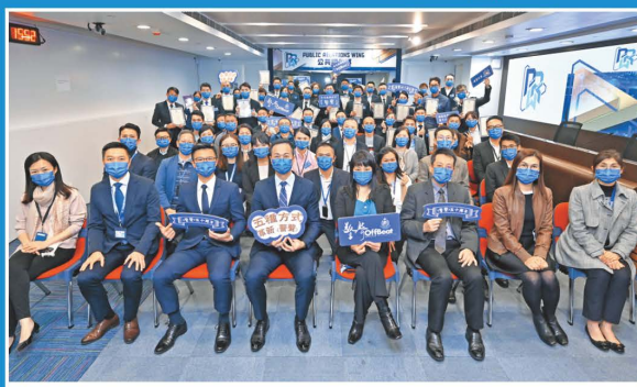
▲ The production team of OffBeat 50th Anniversary Special Edition and the Editorial Committee members are backed up by the competition winners.

Since its inception in January 1973, OffBeat has been published with more than 1 200 issues, spanning half a century to witness every important moment of the Force. To celebrate this important milestone of OffBeat , the 50th anniversary of its founding, the production team of the special edition of OffBeat and the Editorial Committee publish the OffBeat 50th Anniversary Special Edition, a publication of great significance, on January 18, 2023 to tell the history, development and reform of OffBeat , as well as interesting anecdotes, precious photos and interview. The