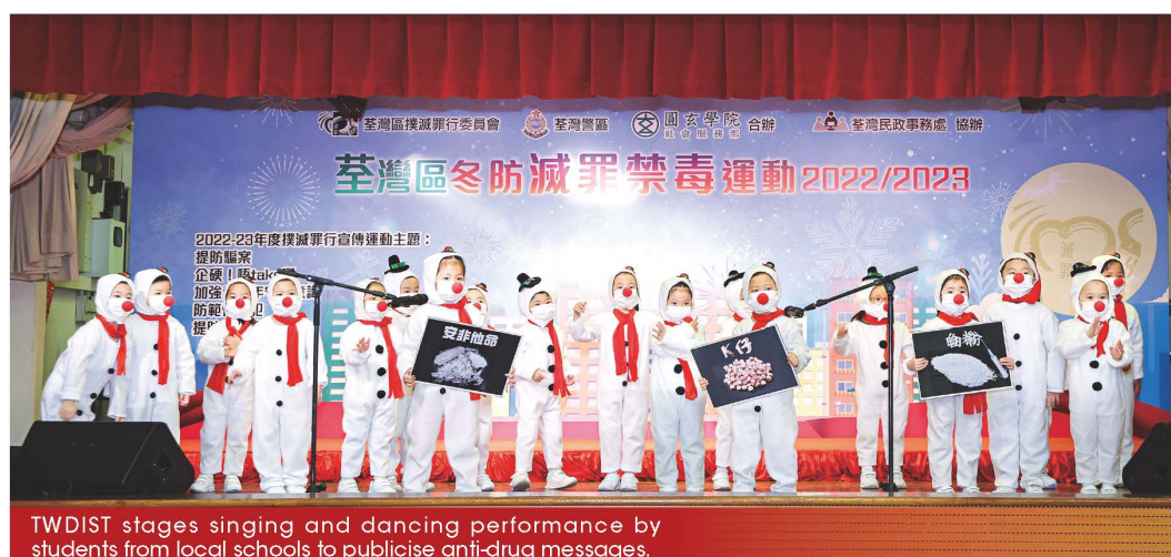
TWDIST stages singing and dancing performance by students from local schools to publicise anti-drug messages.

At the same time, TWDIST launched various winter precaution and fight crime measures to implement winter precaution measures by deploying more officers to convey anti-burglary messages to the community and remind members of the public to keep an eye on their personal belongings and foster police-community co-operation.