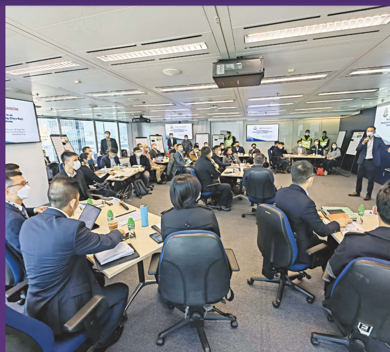
▲ Different scenarios are studied during the table-top exercise.

Participants actively participated in the discussions throughout the table-top exercise.