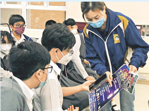
▲澳門司警在學校宣傳「網絡攻防菁英培訓」。 Macao Judicial Police promotes CADET in a school.