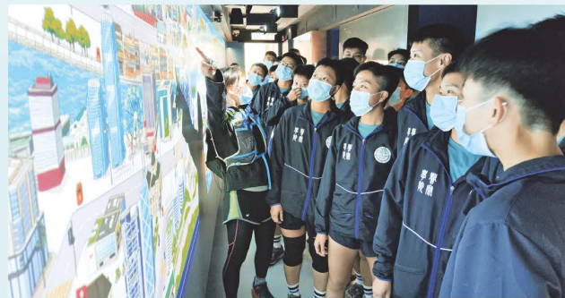
▲一眾學員參與名為「傳承跑」的七公里跑及警隊博物館參觀活動，了解警隊的歷史和成就。 The trainees join the "Police Museum Run", the 7 km Run cum Visit to Police Museum, to understand the history and achievements of the Force.