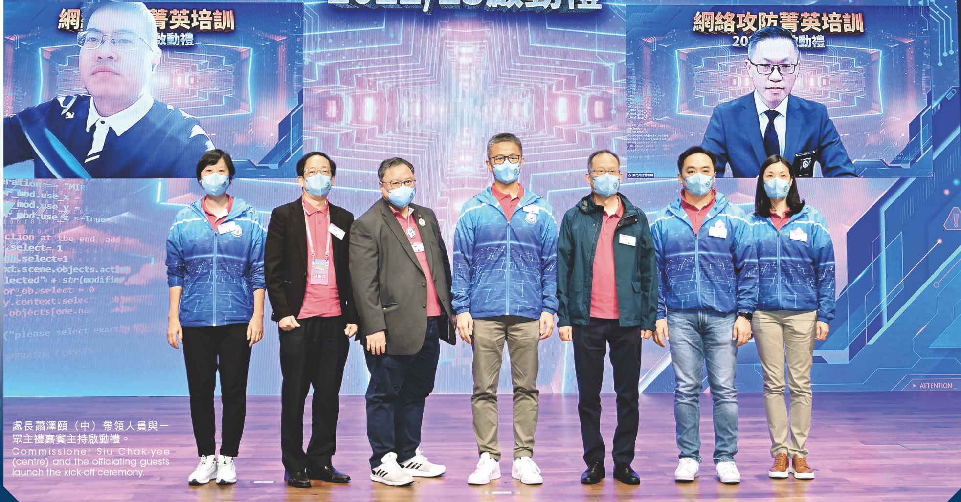
處長蕭澤頤（中）帶領人員與一眾主禮嘉賓主持啟動禮。 Commissioner Siu Chak-ye (centre) and the officiating guests launch the kick-off ceremony.