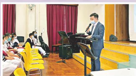
▲警察大使在網絡安全分享會上講解相關資訊。

上良好行為、保護私隱及「起底」刑事化的相關知識，並就網絡陷阱展開深入討論。學生踴躍發問，對日新月異的科技發展及網絡罪案調查深感興趣，並期待日後能參與更多交流活動。