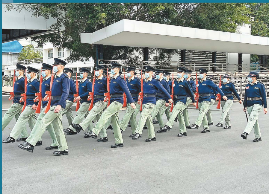
▲ Participants are taught Chinese drill movements.

Hong Kong Police College (HKPC) organised a two-week Foot Drill Instructors Course between November 28 and December 9, 2022. The participants came from ten formations, including Police Community Relations Office of various Districts. The course helped them deliver Chinese drill training to youth and schools in the future.