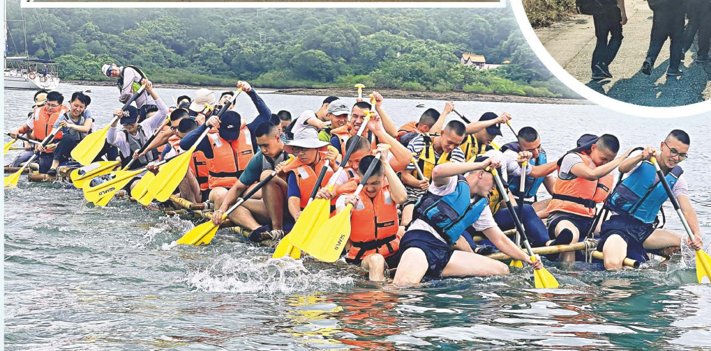
學員在「思維啟發課程」中透過紮木筏加強溝通技巧及建立團隊精神。 Trainees enhance their communication skill and establish team spirit through the rafting session of PMAP.