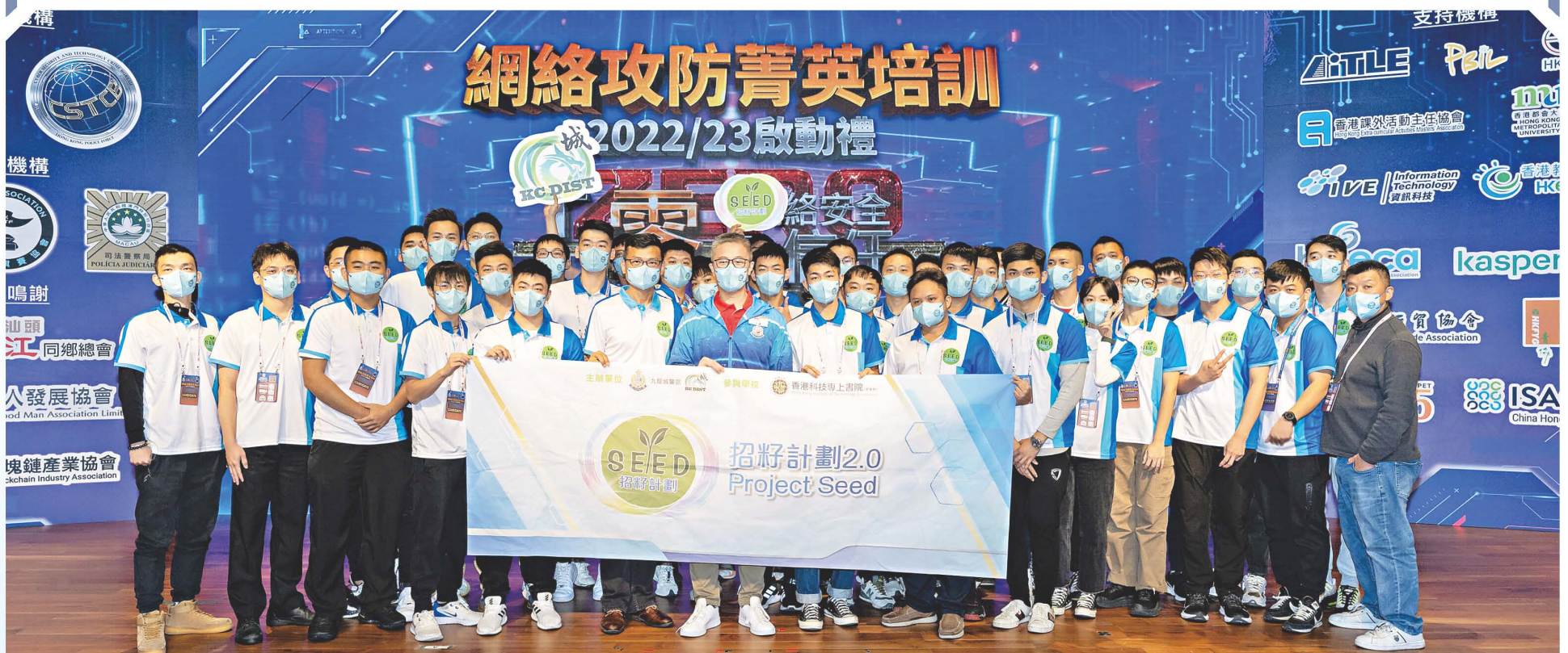
處長蕭澤頤與一眾青少年合照。 Commissioner Siu Chak-ye takes group photo with the youths.

The series of activities in CADET Youth 2022/23 include Cyber Attack Elite Game Design Competition, online quizzes and online game platform, as well as a simulated cyber-attack and defence competition on cyber ranges of the three areas. Competitions on cyber intelligence gathering, digital forensics, case investigation and incident response will also be held. For details, please visit the website https://hkcadet.net .