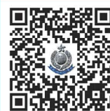
《警聲五十周年紀念特刊》電子版

另外，為加強與讀者互動，人員特別舉辦名為「五種方式 革新《警聲》」活動，包括徵文比賽、攝影比賽、中文報頭設計比賽、英文報頭設計比賽及「我最喜愛的《警聲》頭版故事選舉」，亦透過網上問卷調查，蒐集讀者對《警聲》不同範疇的意見，務求切合讀者需要，精益求精。活動反應熱烈，首四項比賽共收到近500份投稿。而「我最喜愛的《警聲》頭版故事選舉」更吸引超過2 000名同袍投票，並由第1157期獲得最高票數。