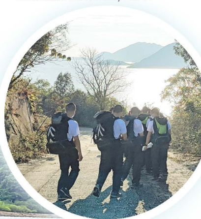
為強化思維發展訓練，基礎訓練學校引入名為「思維啟發課程」的兩天戶外活動。 To strengthen mental development training, SFT introduces the two-day PMAP.