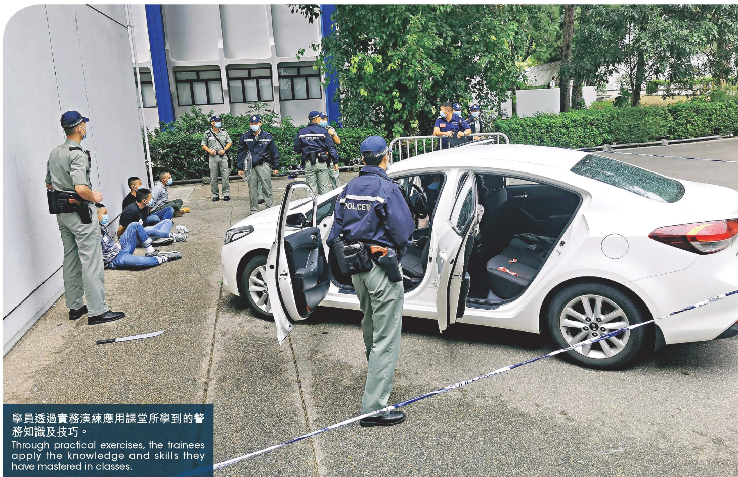
學員透過實務演練應用課堂所學到的警務知識及技巧。 Through practical exercises, the trainees apply the knowledge and skills they have mastered in classes.