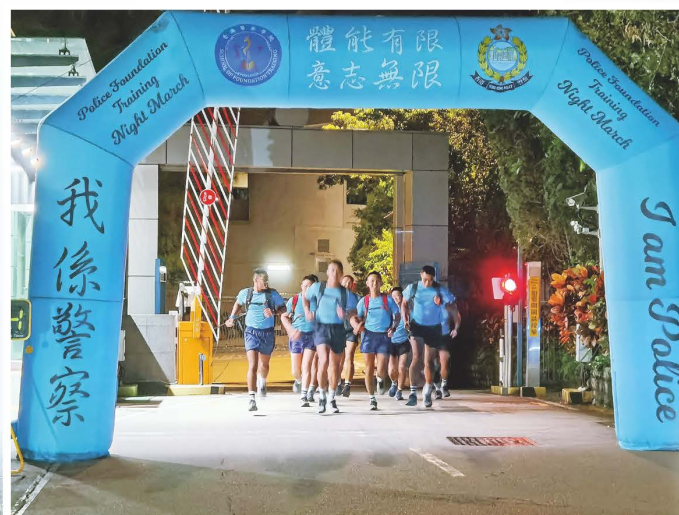
學員參與21公里夜行。 The trainees take part in the "21 km Night March".

學院會不斷優化課程和提升教學方式，以確保培訓的專業水平及成效。為有效支援前線人員，學院亦會與各單位保持緊密聯繫，確保所提供的訓練切合前線需要和不斷轉變的社會需求。