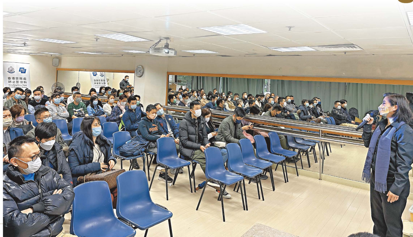
► Nearly 100 officers attend the training.

The seminar was attended by around 100 officers from CPB and Regional Crime Prevention Offices, who found the session inspiring and conducive to enhancing their knowledge of crime prevention. CPB will keep inviting stakeholders to share the latest trends of crimes while amplifying the Force's commitment to community engagement.