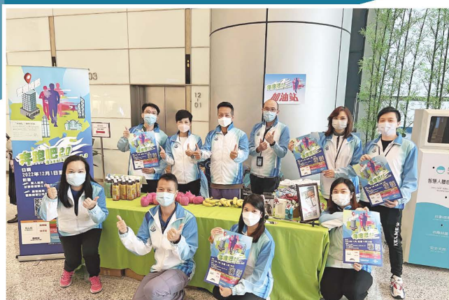
▲ A cheering point is set up to encourage more colleagues to take part in Running Man 2.0.