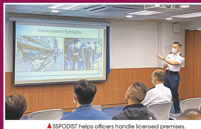
▲ SSPODIST helps officers handle licensed premises.