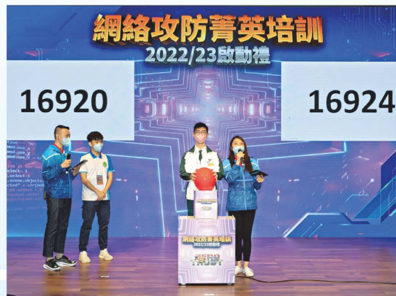
◀青少年在啟動禮上進行遊戲。 The teenagers play games during the kick-off ceremony.

今次培訓設有一系列活動，包括網絡攻防菁英遊戲設計比賽、網上問答及遊戲平台，以及在三地網絡靶場進行的模擬網絡攻防比賽。比賽會就網上情報蒐集、數碼法理鑑證、調查案件及事故應變進行競賽。有關詳情可瀏覽網頁 https://www.hkcadet.net 。