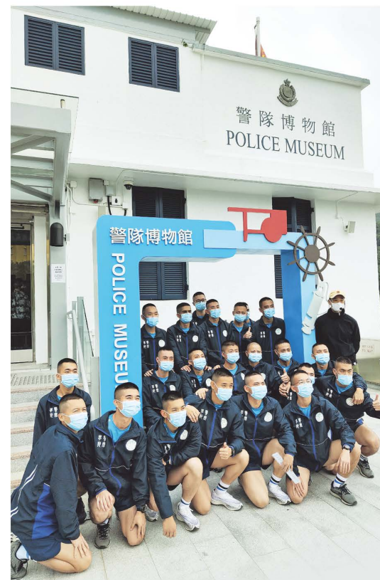
學員由警校跑往警察博物館，除鍛鍊體能外，亦參觀博物館。 The trainees run from the HKPC to the Police Museum to exercise and visit the museum.