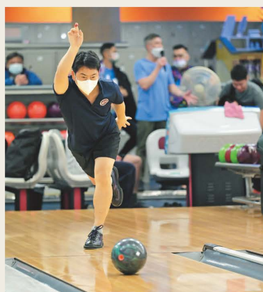
▲ A bowling match on MAR sports day.