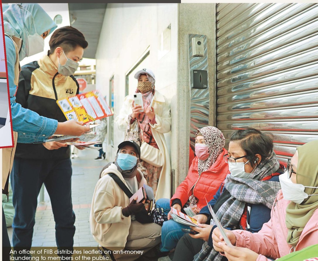
An officer of FIIB distributes leaflets on anti-money laundering to members of the public.

Moreover, FIIB attaches great importance to stakeholder engagement and public