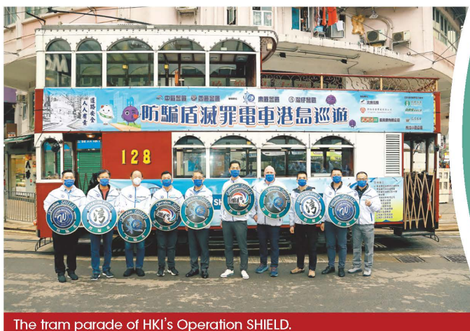
The tram parade of HKI's Operation SHIELD.

Given the increasing number of deception cases, Eastern District (EDIST) officially established Operation SHIELD in July 2022 to actively engage members of various sectors to utilise community resources. A series of publicity campaigns have been rolled out through different social media platforms. EDIST held the launching ceremony of the SHIELD Fight Crime Hong Kong Island (HKI) Tram Parade at Shau Kei Wan tram terminus on February 21, 2023. The float toured from Shau Kei Wan terminus to Shek Tong Tsui terminus, promoting anti-deception information to the public along the way. Regional Commander of HKI Kwok Ka-chuen spoke at the ceremony. The four Districts under HKI joined their respective District Fight Crime Committees in setting up publicity booths to distribute pamphlets and explain anti-deception tips to members of the public to avoid their falling prey to scams.