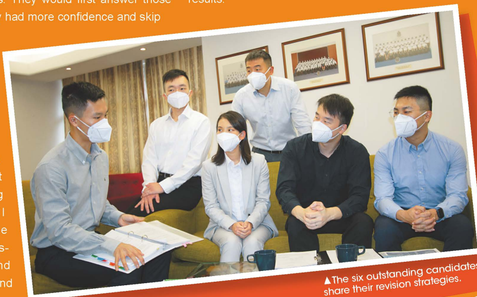
▲ The six outstanding candidates share their revision strategies.

then present her views in simple and clear words. Finally, the six outstanding candidates unanimously encouraged candidates to form study groups to exchange experience and good practices in learning for more efficient revision and outstanding results.