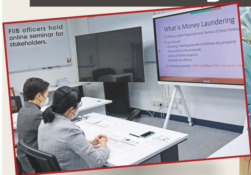
FIIB officers hold online seminar for stakeholders.

The Financial Intelligence and Investigation Bureau (FIIB) launched its publicity campaign Anti-Money Laundering Month (AML Month) between January 9 and February 17, hoping to enhance the public's awareness of anti-money laundering and related knowledge through a series of promotion campaigns, outreach education and enforcement actions.