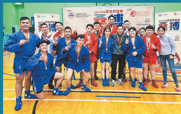
▲ Police Judo Club members achieve good results in the competition.