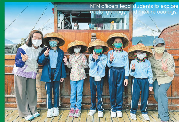
NTN officers lead students to explore coastal geology and marine ecology.