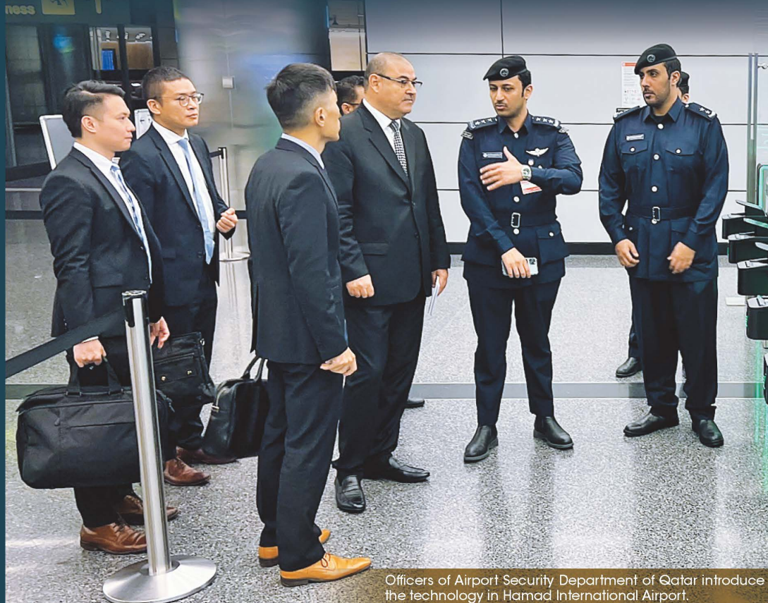
Officers of Airport Security Department of Qatar introduce the technology in Hamad International Airport.

The visit enabled the officers to learn from overseas experience and better understand the policing regime in Qatar. It also offered an opportunity for the officers to forge closer ties with local law enforcement officers for meeting future challenges.