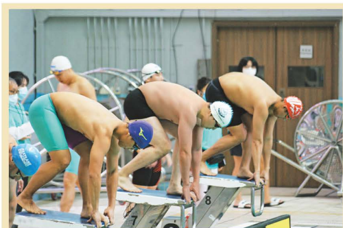
▲ Members of the Force Swimming Team kick start the year with strong performance.

to be held soon. In addition to exchanging and improving swimming skills, members of PSC will take the opportunity to promote the positive image of the Force externally.