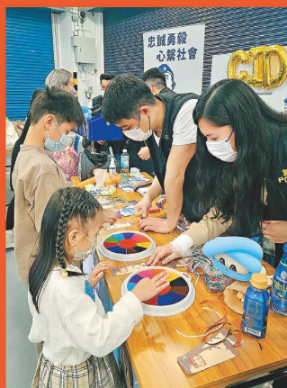
▲ The family finger printing booth at STDIST's Family Fun Day.

The Fun Day attracted 350 officers and their families. Various handicraft classes and booth games were held on the day. The Airport Security Unit, Counter Terrorism Response Unit and National Security Department set up booths to promote anti-terrorism and national security information. Members of Project SLASH, a youth engagement project initiated by Shatin District, also had a booth for recruiting regular and auxiliary officers. Performances of the Police Band, Police Dog Unit and a magician were arranged to give much fun and joy to the event.