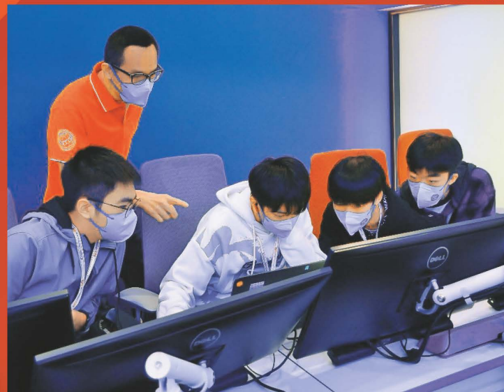
▼參賽隊伍在模擬網絡防衛比賽中一較高下。 The teams compete vigorously at the simulation challenge.