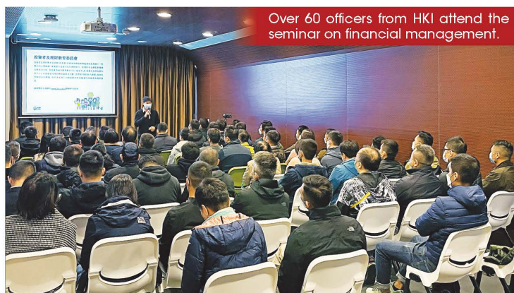
Over 60 officers from HKI attend the seminar on financial management.

The campaign has enhanced not only the officers' understanding of financial wellness, but also the culture of healthy financial management in the Force.