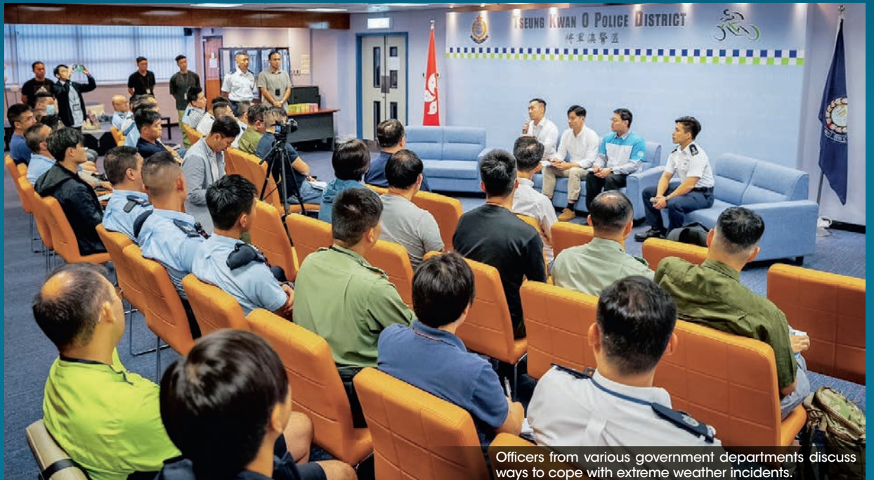
Officers from various government departments discuss ways to cope with extreme weather incidents.

Representatives of DSD, HyD and FSD shared and discussed previous real cases. For each case, topics such as why the incident happened, whether the scene of incident was suitable for carrying out search and rescue work, as well as the risk factors to be considered in the course of rescue, were deliberated. Moreover, there was an interactive session, during which different scenarios were discussed to effectively boost the frontline officers' capabilities and confidence in dealing with extreme weather incidents.