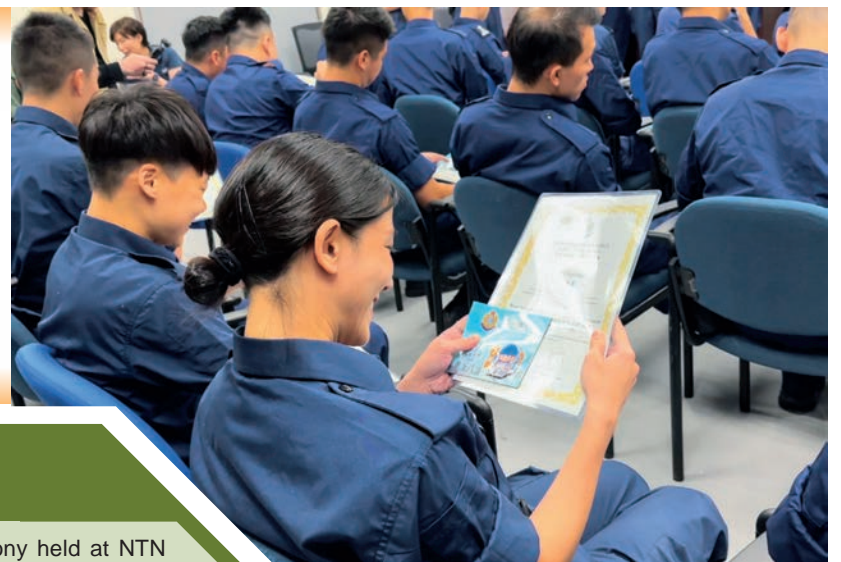
▲ Second edition of Pixel Police themed with voluntary secondary duty cadre is released.

Moreover, NTS promoted integrity activities among the Force Escort Group and Force Search Unit in early November, and expressed appreciation for their contribution to and efforts in the Force.