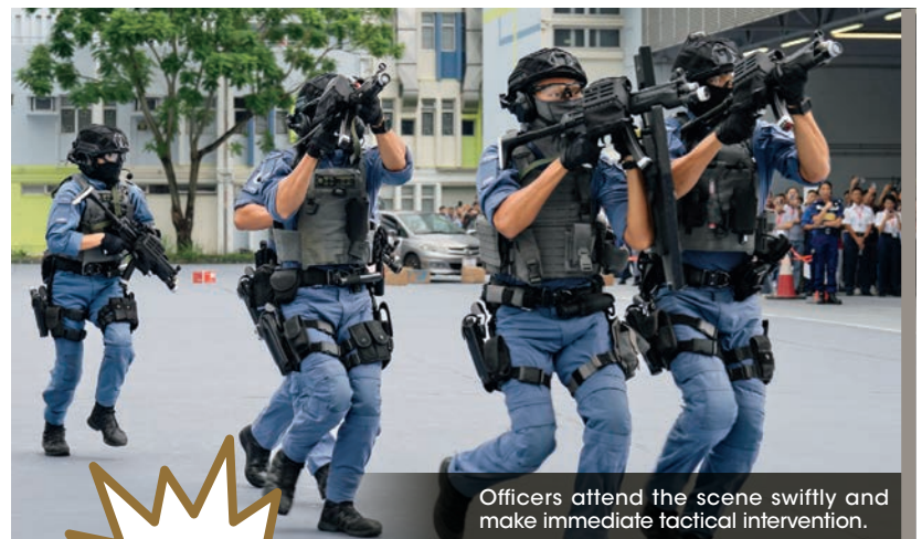
Officers attend the scene swiftly and make immediate tactical intervention.