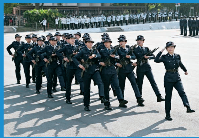
▲ The passing-out parade is held at the Police College on November 25.