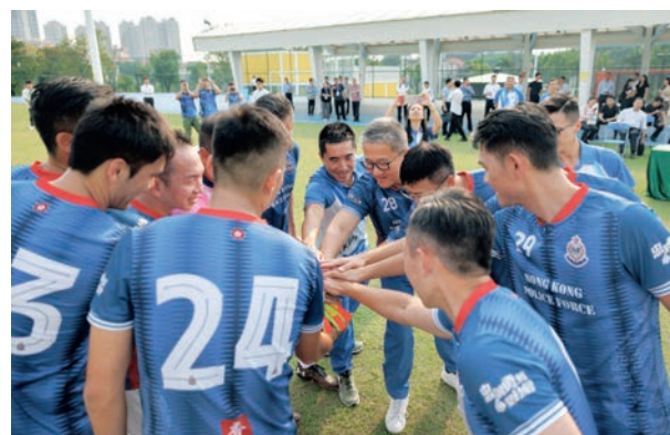
◀ The football team led by the Commissioner wins the champion of the football game.