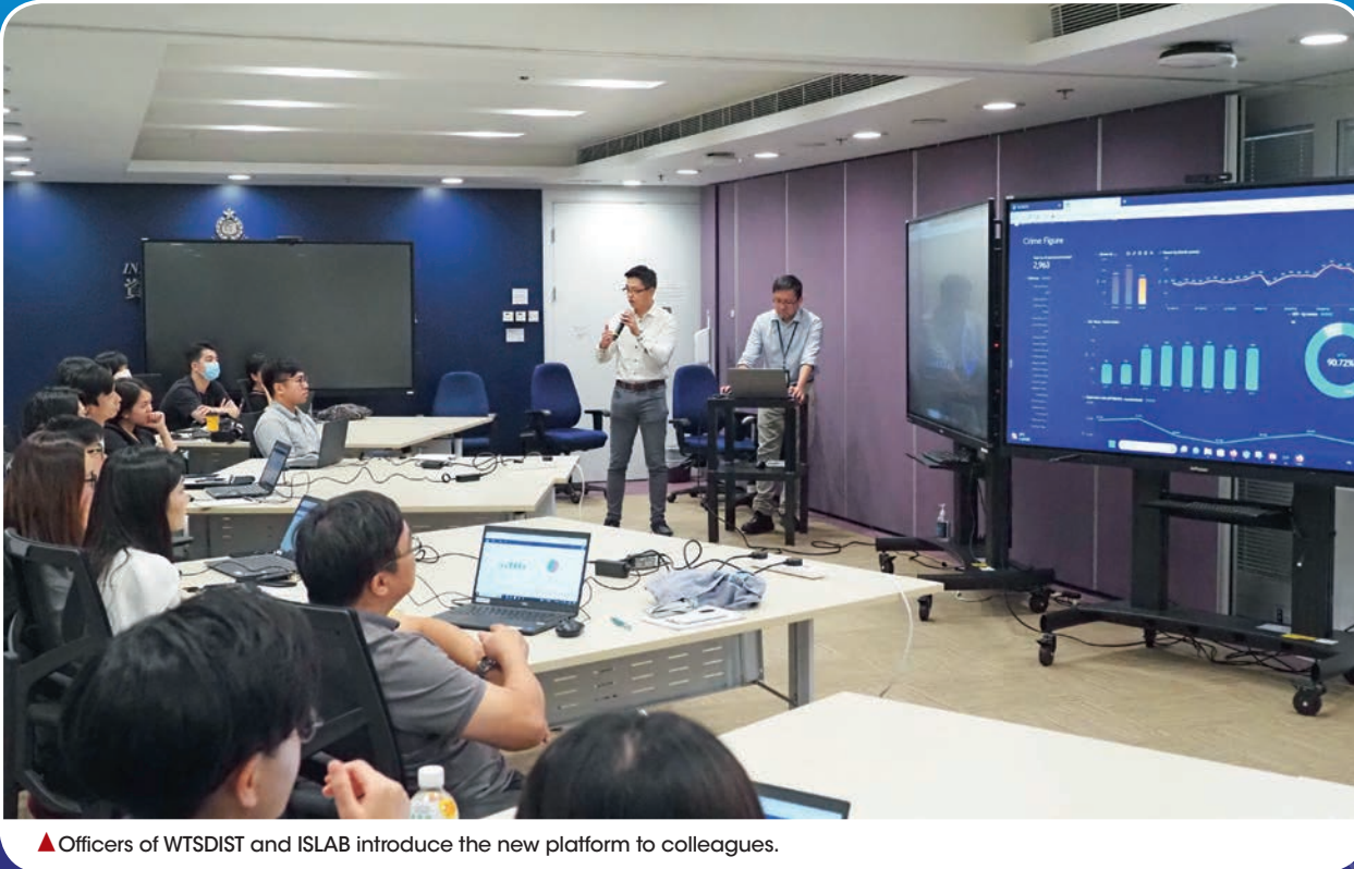
▲ Officers of WTSDIST and ISLAB introduce the new platform to colleagues.

Wong Tai Sin District (WTSDIST) developed the interactive big data analytics e-platform DeTECH with the support of the Innovation and Solution Lab (ISLAB) of Information Systems Wing. It has been made available to WTSDIST officers on a trial basis since September 9. DeTECH visually presents the figures, black spots and trend analysis of crimes in the form of charts for officers to master the latest situation conveniently via the platform and formulate effective strategies and measures for combatting and preventing crimes.