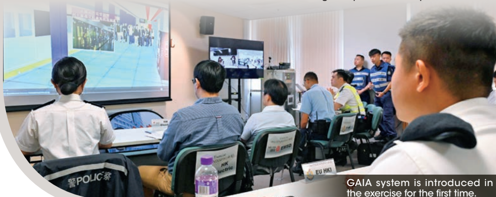
GAIA system is introduced in the exercise for the first time.

The Geospatial Analytics, Information and Applications (GAIA) system developed by Information Systems Wing's Innovation and Solution Lab was applied for the first time in the exercise. The system is able to provide spatial information of a specific location by presenting the images of various terrains and buildings in a 3D format for the participating units to acquire information of the relevant terrains and situation promptly in case of an accident for formulating and executing an optimal action plan.