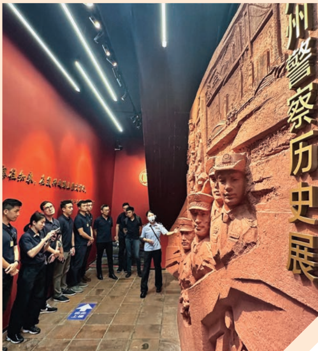
► The delegation visits Guangzhou Police History Museum.

The training delegation has deepened the participants' understanding of the history and development of the motherland. At the same time, it has strengthened co-operation and exchanges between the police agencies of the two places through learning the concepts of policing, public security management and criminal investigation in the Mainland.