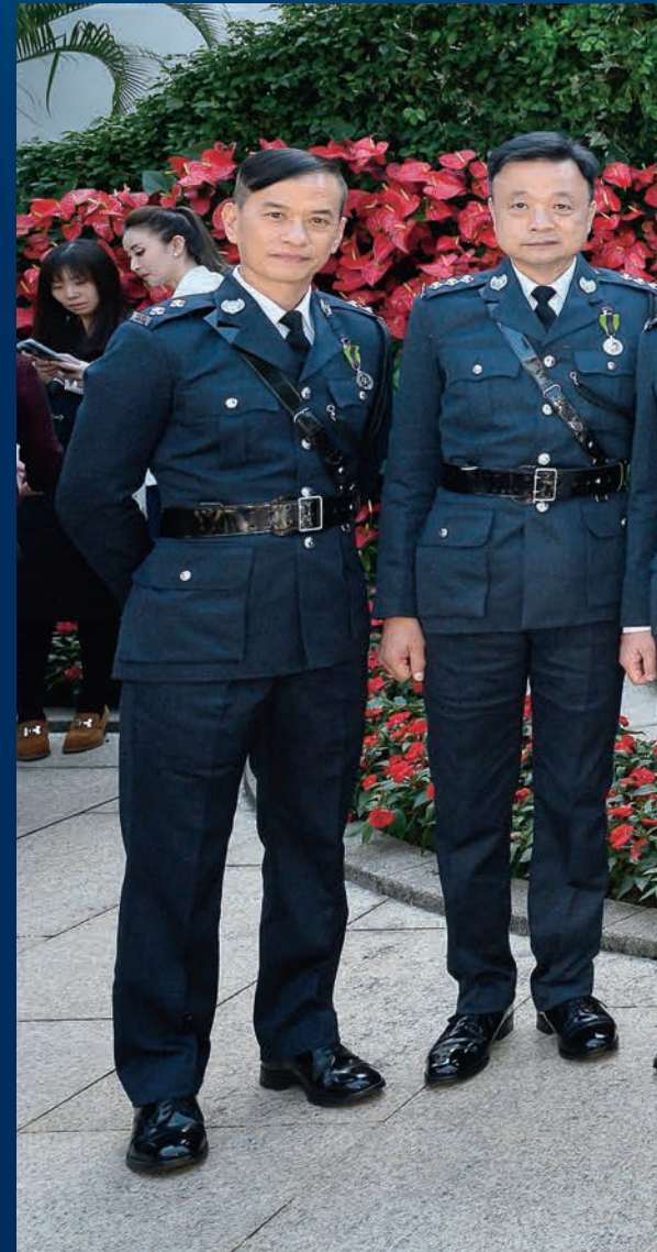
▶行政長官李家超（前排左五）及處長蕭澤頤（前排左四）祝賀一眾獲頒香港警察榮譽獎章及榮譽勳章的人員。 Chief Executive Mr John Lee (fifth left, front row) and Commissioner Siu Chak-ye (fourth left, front row) congratulate the Force awardees of the Hong Kong Police Medal for Meritorious Service and the Medal of Honour.