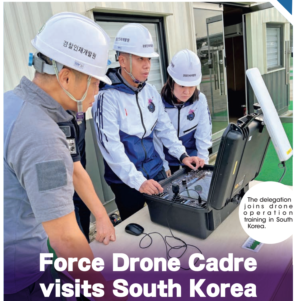
The delegation joins drone operation training in South Korea.