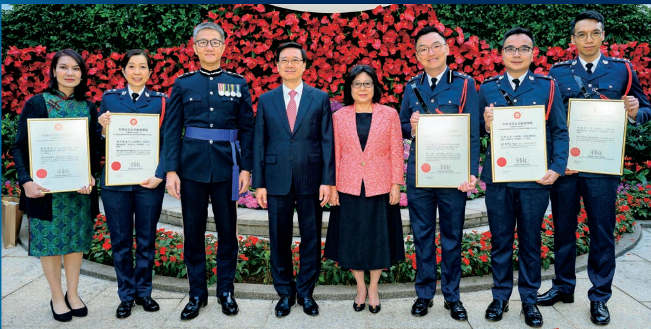
▲行政長官李家超（左四）及處長蕭澤頤（左三）祝賀一眾獲頒行政長官公共服務獎狀的人員。 Chief Executive Mr John Lee (fourth left) and Commissioner Siu Chak-ye (third left) congratulate the Force awardees of the CE's Commendation for Government/Public Service.

四名人員獲頒行政長官公共服務獎狀，以表揚他們任職警隊期間表現出色。另外，一名人員亦獲頒行政長官公共服務獎狀，以表揚他作為被派往土耳其的香港特別行政區救援隊人員的貢獻。一名前高級臨床心理學家獲頒榮譽勳章，以表揚他在警隊竭誠工作，表現出色。