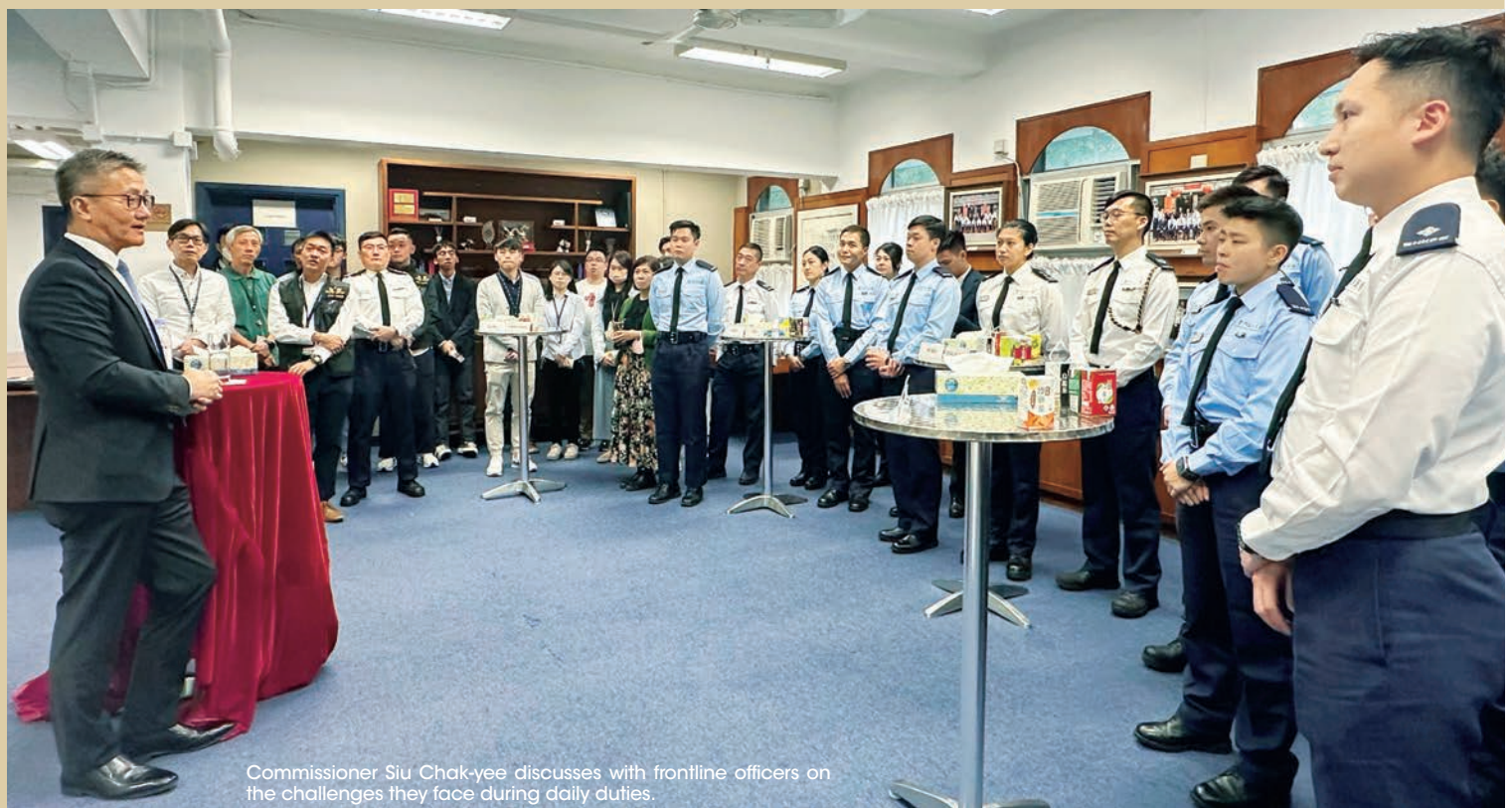
Commissioner Siu Chak-ye discusses with frontline officers on the challenges they face during daily duties.

The Commissioner also discussed with frontline officers on the challenges they faced during their daily duties and addressed their enquiries on Force development, work procedures, human resource