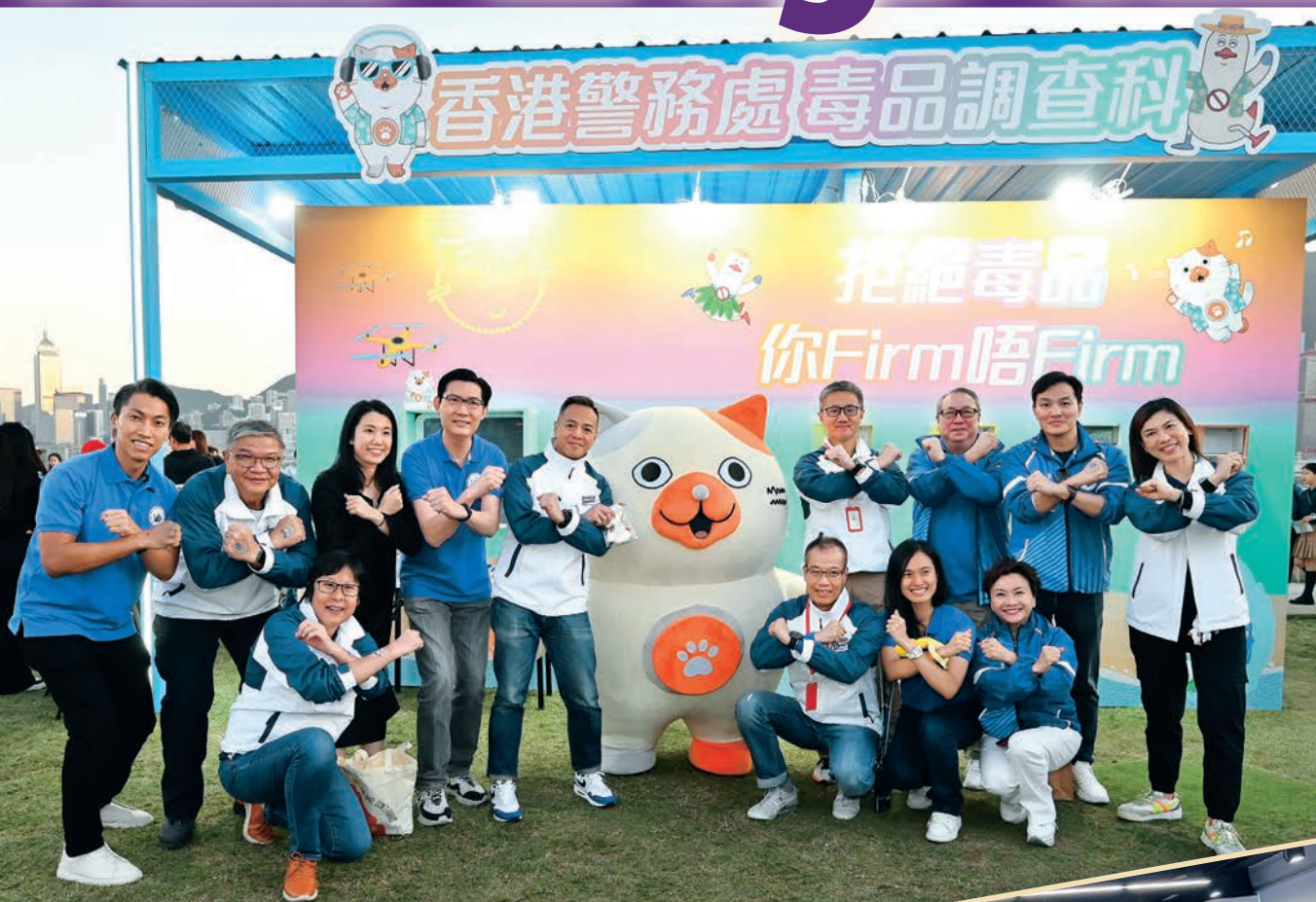
The guests of honour support the anti-drug campaign by posing with the anti-drug mascot Mighty Cat.

To cultivate students' anti-drug awareness, NB in collaboration with the Education Bureau will provide learning and teaching resources for teachers to help students distinguish different types of drugs and learn about harmful effects of drugs and serious legal consequences of drug trafficking, as well as enhancing the students' anti-drug awareness through the interactive learning and teaching process.