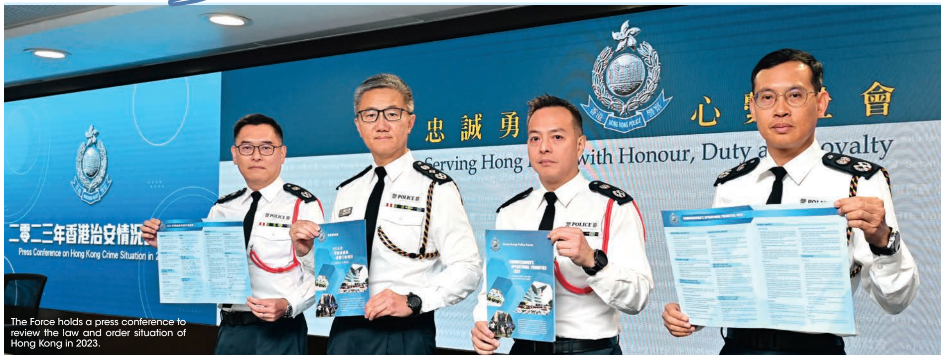
The Force holds a press conference to review the law and order situation of Hong Kong in 2023.