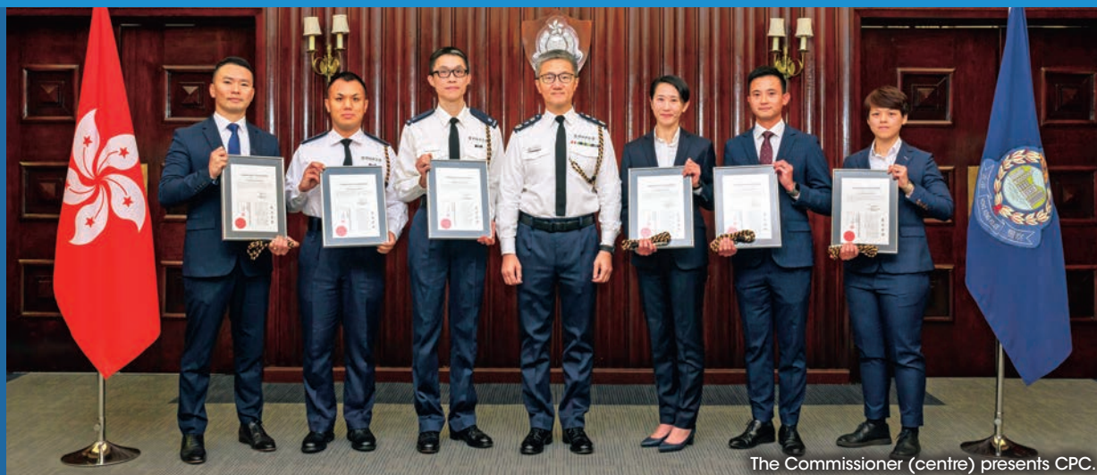
The Commissioner (centre) presents CPC.