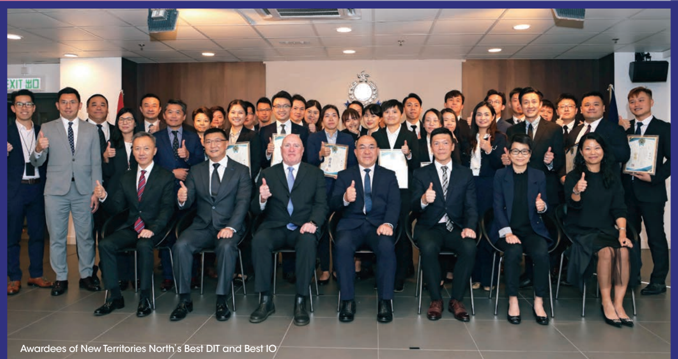
Awardees of New Territories North's Best DIT and Best IO