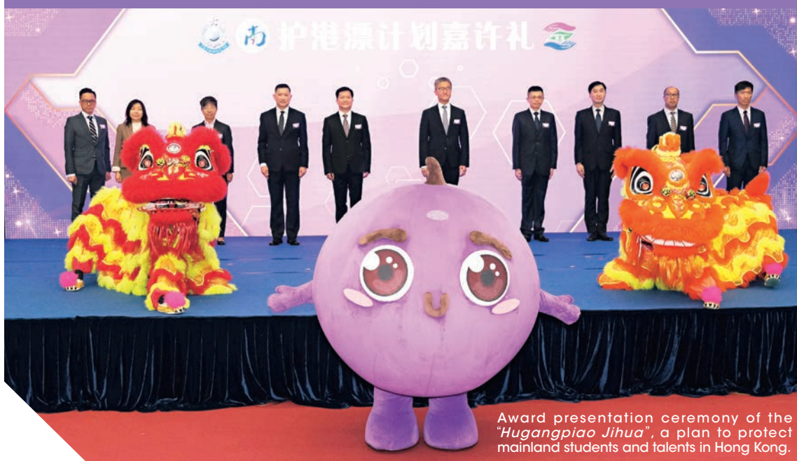
Award presentation ceremony of the “ Hugangpiao Jihua ”, a plan to protect mainland students and talents in Hong Kong.

During the sharing session of the event, a student of The Chinese University of Hong Kong cum Anti-deception Ambassador, and the president of Mainland University Student (Hong Kong) Volunteers shared their real life stories in which they encountered scams. They also thanked the Force for organising various anti-deception events continuously.