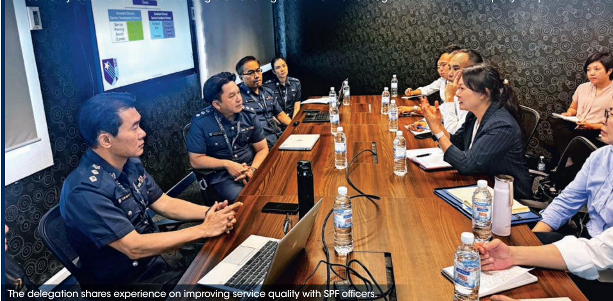
The delegation shares experience on improving service quality with SPF officers.

found properties through an automated system operated by an outsourced company. The exchange was highly enlightening, with SPF officers sharing their robust internal governance, their internal investigation and discipline actions, as well as utilising technologies to optimise frontline police resources whilst ensuring service quality. During the visit to the Ang Mo Kio Division, the local officers introduced various e-services and demonstrated how to operate e-lockers for self-help exhibit storage and the Found Property Drop Box.