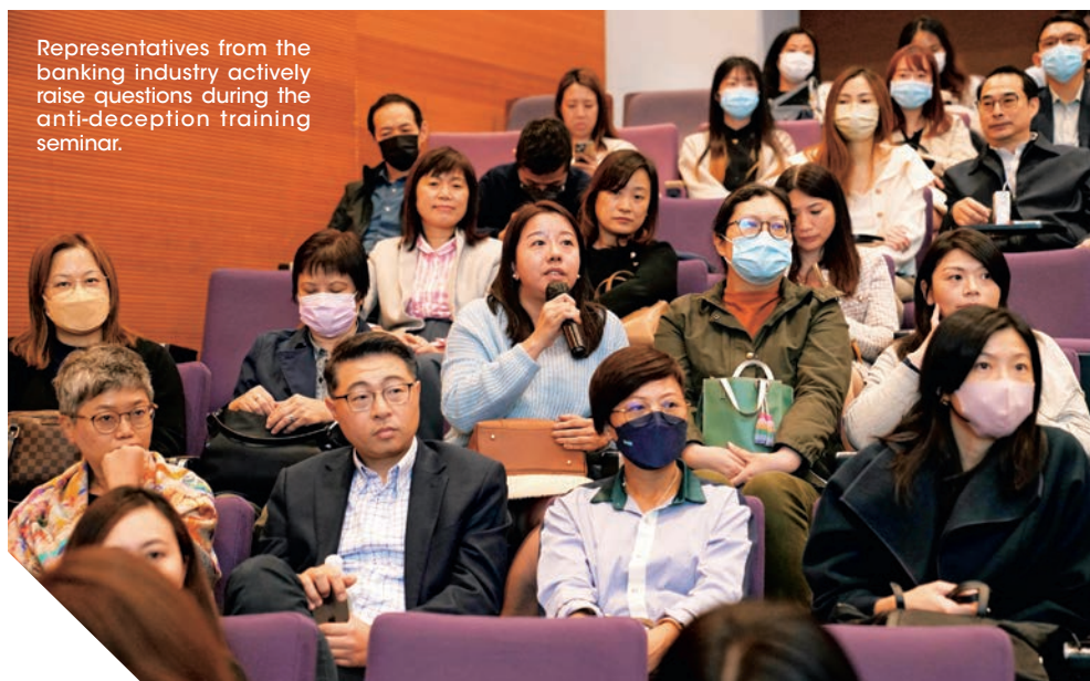
Representatives from the banking industry actively raise questions during the anti-deception training seminar.

The Anti-Deception Coordination Centre (ADCC) under Commercial Crime Bureau (CCB) organised an anti-deception training seminar at the Police Headquarters on January 11, attracting approximately 230 participants from 28 banks.