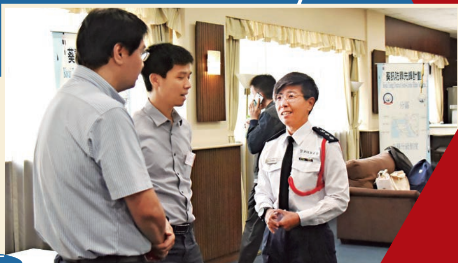
► District Commander of KWTDIST Tam Nga-ching discusses community policing and crime prevention with members of District Council.