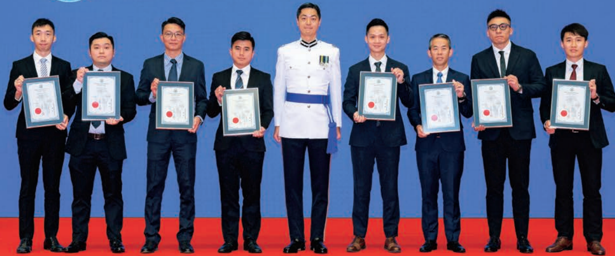
DIT 5 of Western District (WDIST) is awarded the Best DIT of WDIST.