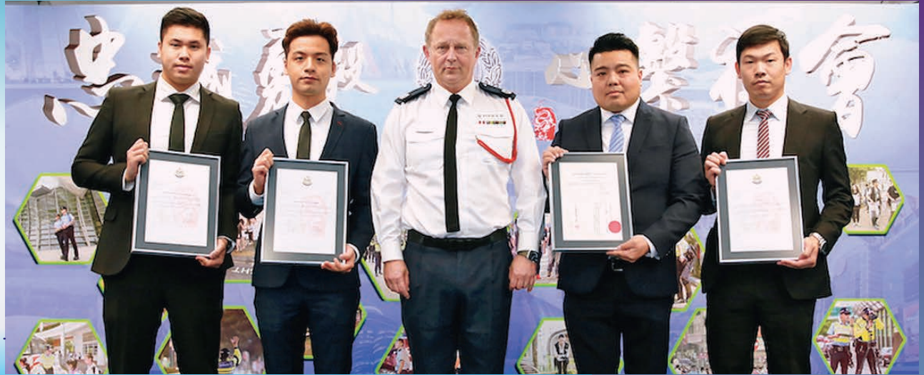
►Awardees of Kowloon West's Best Investigation Officer(IO)

In achieving one of the initiatives of the Force Committee on Service Quality, Service Quality Wing co-ordinated with all land Regions under the Police Staff Motivation Scheme and formed a judging panel in each Region to select the best District Investigation Team (DIT) and outstanding DIT officers with a view to encouraging the detectives in sustaining a high level of quality service with continuous improvement. The results were announced in late 2023 and January 2024, followed by award presentation ceremonies.