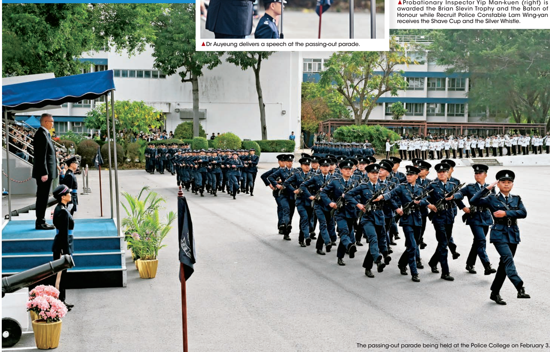
The passing-out parade being held at the Police College on February 3.