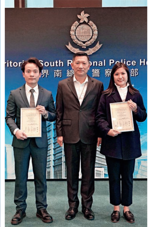
►DIT 8 of Shatin District (STDIST) is awarded the Best DIT of STDIST.