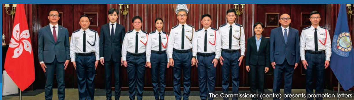
The Commissioner (centre) presents promotion letters.