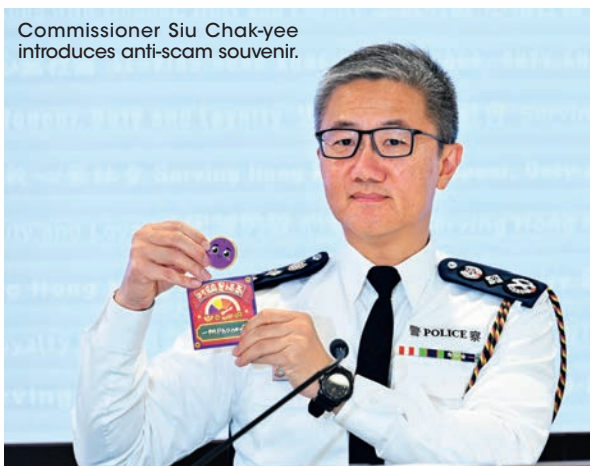
Commissioner Siu Chak-ye introduces anti-scam souvenir.

As for enforcement, the Force conducted joint operations with the Public Security Bureau of the Mainland in June. A total of 19 persons were arrested in both the Mainland and Hong Kong. The arrestees were involved in at least 149 deception cases, including "naked chat" blackmail cases.