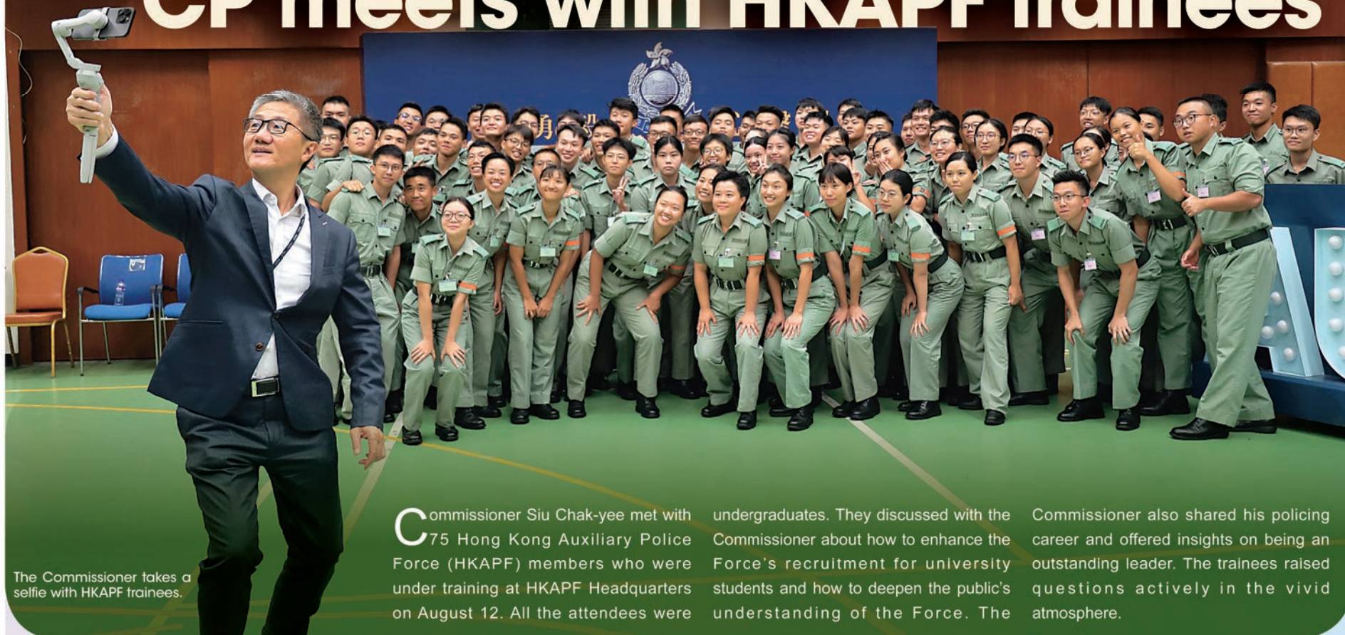
The Commissioner takes a selfie with HKAPF trainees.

Commissioner Siu Chak-yeet met with 75 Hong Kong Auxiliary Police Force (HKAPF) members who were under training at HKAPF Headquarters on August 12. All the attendees were