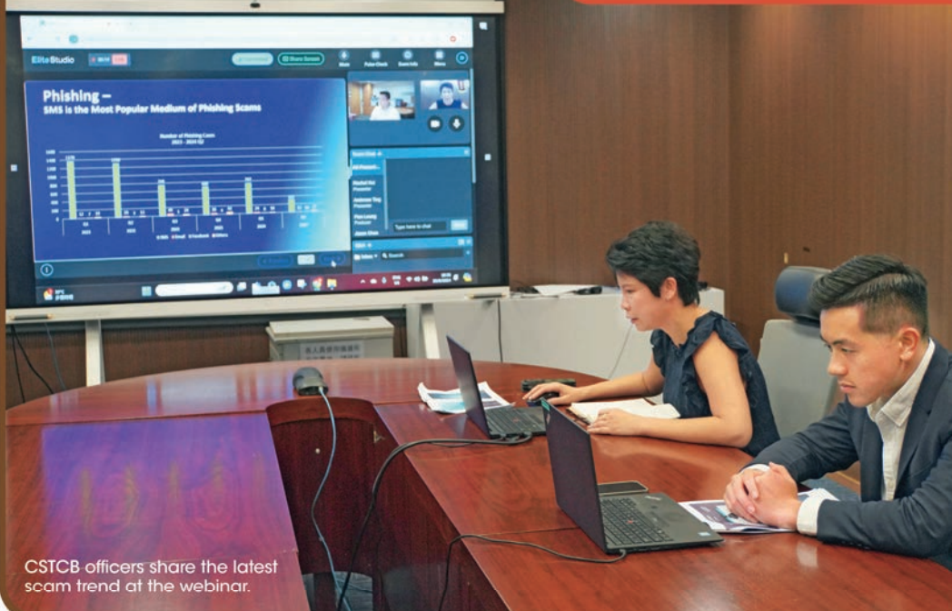
CSTCB officers share the latest scam trend at the webinar.

CSTCB conducted a webinar on August 30 for more than 500 members of the Association of Chartered Certified Accountants Hong Kong to enhance their awareness of digital fraud and equip them with the necessary knowledge and AI tools to avoid becoming victims. Officers shared real-life cases and provided practical prevention advice during the webinar.