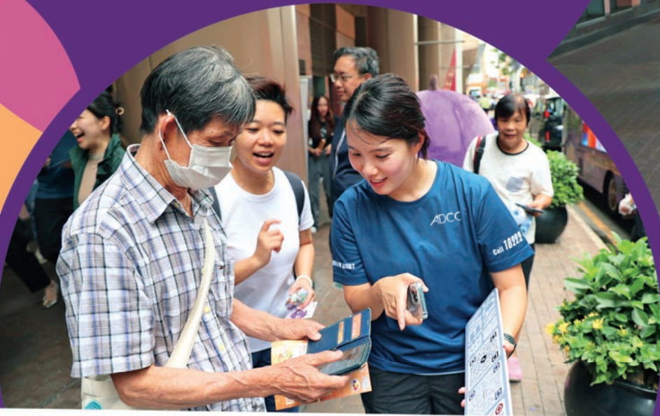
◀ 協調中心人員向市民分享防騙資訊。 Officer from ADCC shares anti-deception information with citizens.

To promote collaboration among public and private stakeholders in stepping up efforts to combat fraud, the Anti-Deception Coordination Centre (ADCC) under Commercial Crime Bureau is launching the Anti-Scam Month from mid-August to late September for raising public awareness of the latest scams.