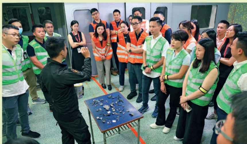
▲ An officer from Explosive Ordnance Disposal Bureau demonstrates components of a homemade explosive during the field exercise.

scenario-based field exercise conducted jointly with the Counter Terrorism Response and Exercise Division of Operations Wing, as well as multiple site visits, to enable participants to effectively apply CT theory and knowledge to practical scenarios.