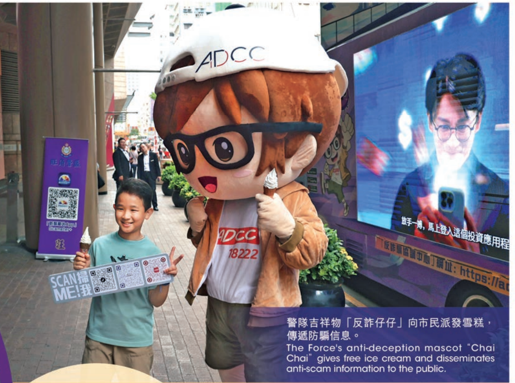
警隊吉祥物「反詐仔仔」向市民派發雪糕，傳遞防騙信息。 The Force's anti-deception mascot "Chai Chai" gives free ice cream and disseminates anti-scam information to the public.