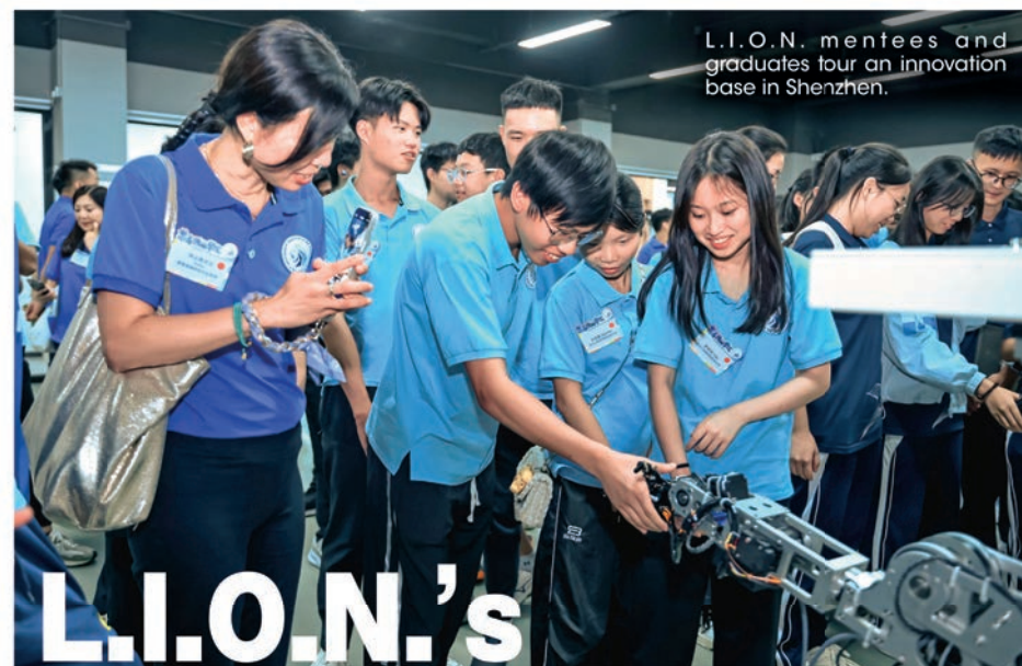
L.I.O.N. mentees and graduates tour an innovation base in Shenzhen.

discussions were pioneered, during which keynote speakers were invited to share their insight on AML strategies. Moreover, to further strengthen AML awareness among students, young adults and foreign domestic helpers, a range of activities were held at universities and the Kowloon Mosque and Islamic Centre. In addition to seminars and fun games, an AML comic book The Dirty Money Trap was published. It features three stories adapted from real cases so as to allow the public to understand the legislations on AML and how to avoid falling prey to money laundering traps. In addition to publicity, FIIB organised AML Induction Course for 25 frontline officers to enhance their capabilities in handling relevant cases.