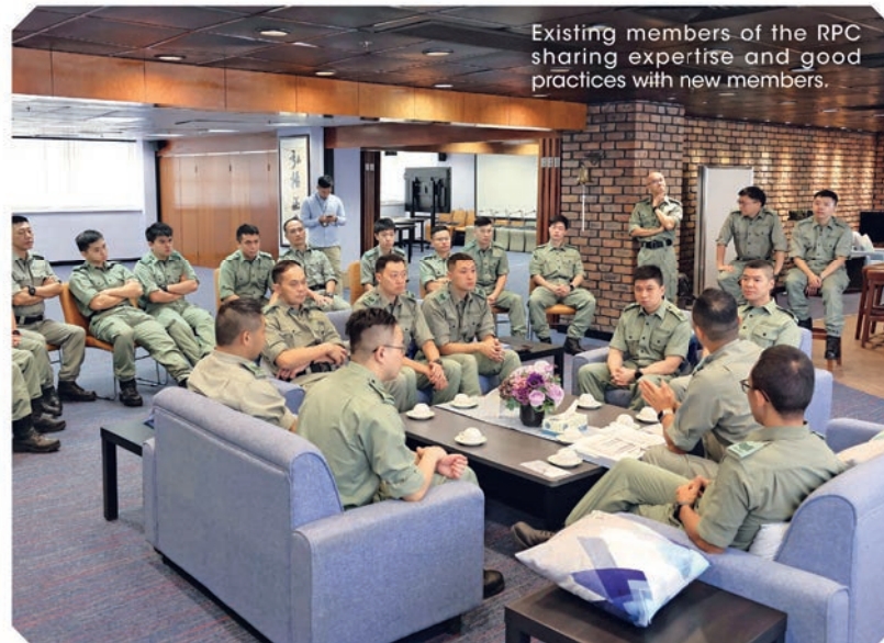
Existing members of the RPC sharing expertise and good practices with new members.