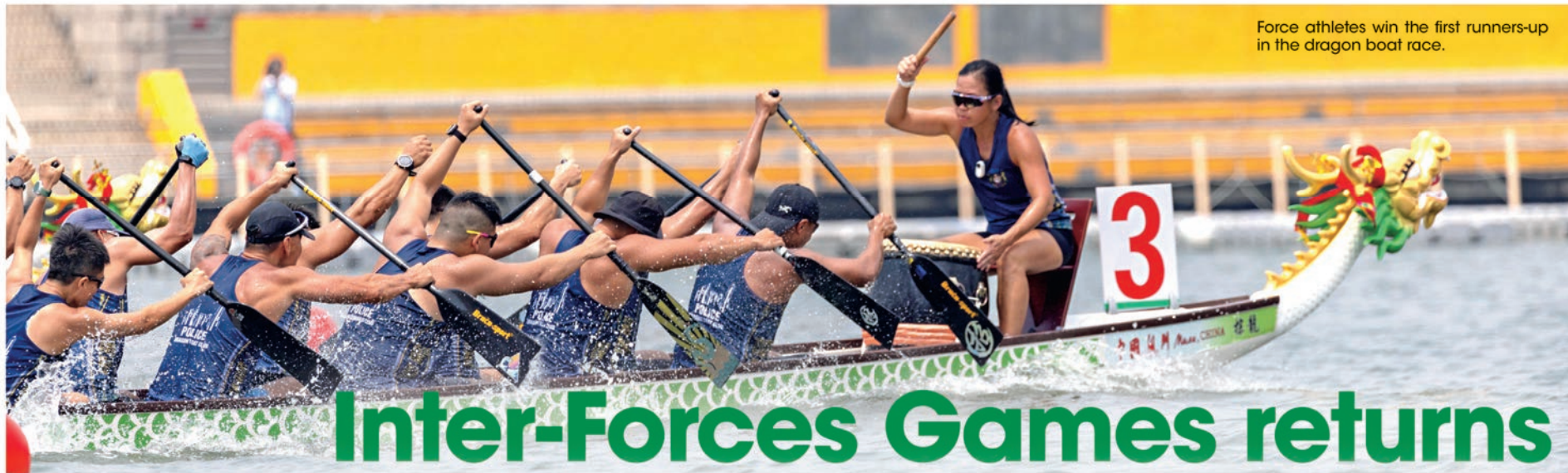
Force athletes win the first runners-up in the dragon boat race.