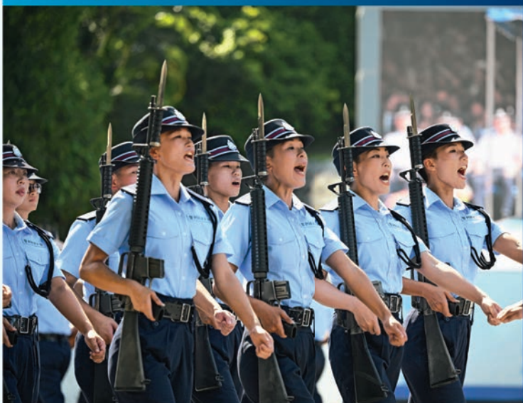
▼ 29 probationary inspectors and 164 recruit police constables participate in the passing-out parade.

External forces continue to keep an eye on us, intending to curb the development of the country by interfering in Hong Kong's affairs and wantonly smearing the city and our country. Local terrorism is also going underground. In recent years, we have detected many cases involving firearms and bombs, which are enough proof of such risks. These cases not only pose a threat to national security, but also seriously endanger the personal safety of every Hong Kong citizen."