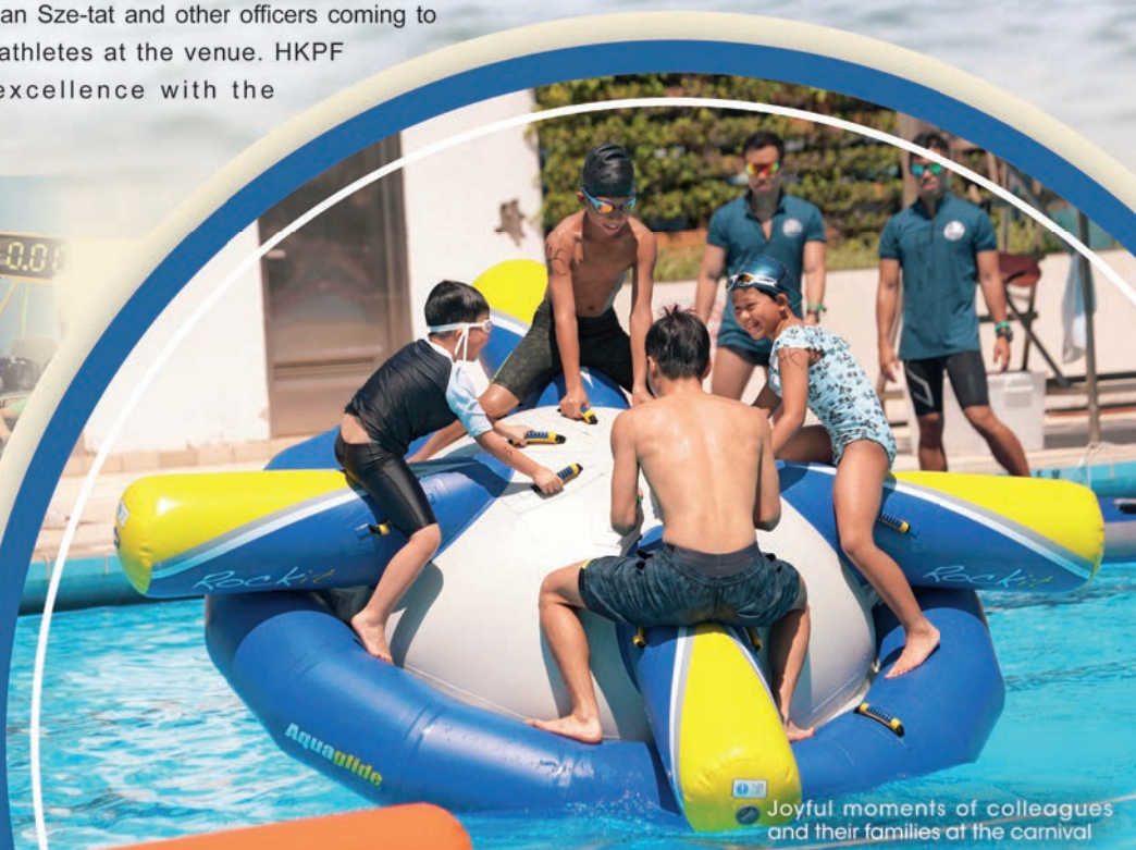
Joyful moments of colleagues and their families at the carnival