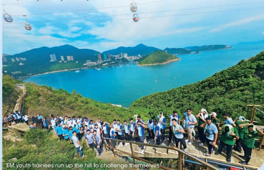
EM youth trainees run up the hill to challenge themselves.

The training programme aimed to help EM youths integrate into society and establish positive values, as well as encouraging them to strive for their goals. The activities included discipline and teamwork training, mock physical fitness tests, a visit to the Tactical Training Complex, an introduction to riot police gear and trail running. Representatives of the disciplined services also introduced the work scope and entry requirements of their respective services for the participants to know more about the duties of disciplined forces.