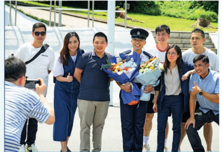
▲ A graduate shares the joy of passing out with his family members and friends.

He continued that with the change of the times and circumstances, "evils" referred not only to fraudsters who cheated in real life and the cyber world, but also traitors who endangered national security. In addition to the everchanging modus operandi of crimes, there were also challenges in dealing with unprecedented national security risks. "As the head of the National Security Department of the Force, I especially want to refer to the national security risks we are facing. At present, our society seems to be stable on the surface, but in fact the national security risks are secretly surging everywhere. There are still people who use 'soft confrontation' to infiltrate the society and endanger national security.