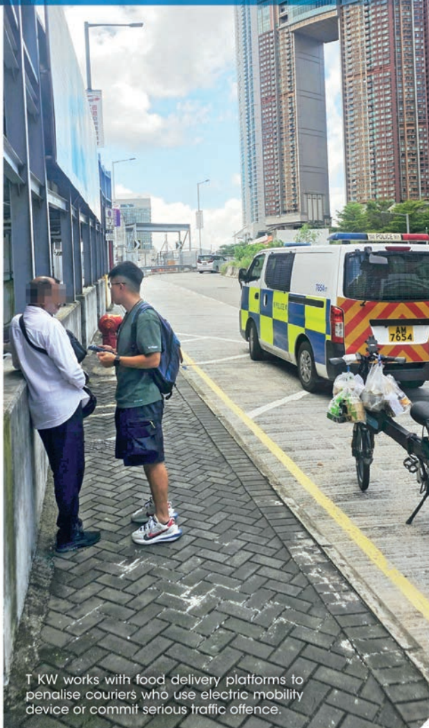
T KW works with food delivery platforms to penalise couriers who use electric mobility device or commit serious traffic offence.

Moreover, representatives from RCU KW suggested enhancing the application of technology on the platforms to prevent couriers from lending their accounts to other individuals, including illegal workers. KW RCPO also proposed the platforms include an anti-fraud message in their mobile apps to raise public awareness of fraud prevention.