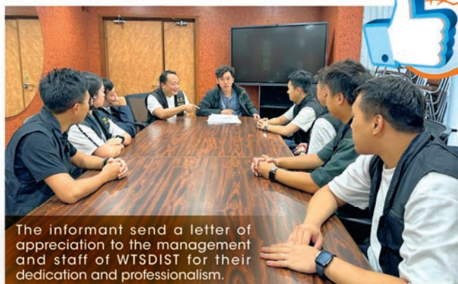
The informant send a letter of appreciation to the management and staff of WTSDIST for their dedication and professionalism.