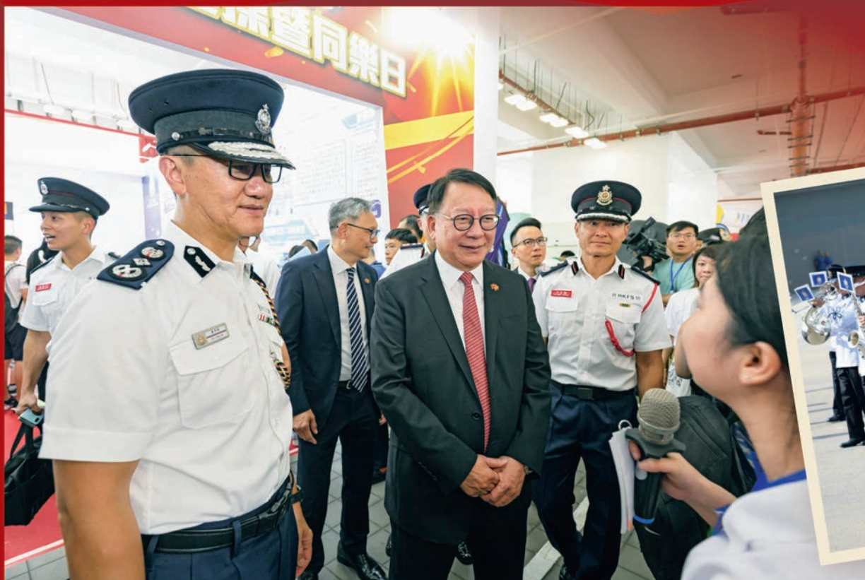
◀CS (third left) and the Commissioner (first left) are briefed by a member of the youth uniformed groups.