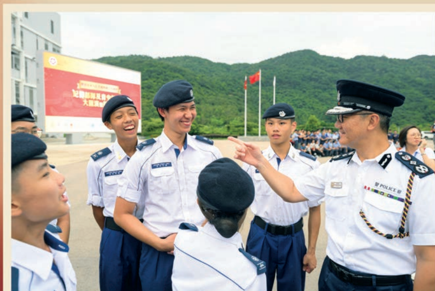
▲The Commissioner (first right) chats with JPC members.

Moreover, exhibition and game booths were hosted by SB and the eight disciplined and auxiliary services to deepen public understanding of their daily operations. The disciplined services participating in the grand parade included the Force, Immigration Department, Customs and Excise Department, Correctional Services Department, FSD and Government Flying Service, as well as the youth groups of various disciplined services, Auxiliary Medical Service Cadet Corps, Civil Aid Service Cadet Corps and Hong Kong Army Cadets Association.