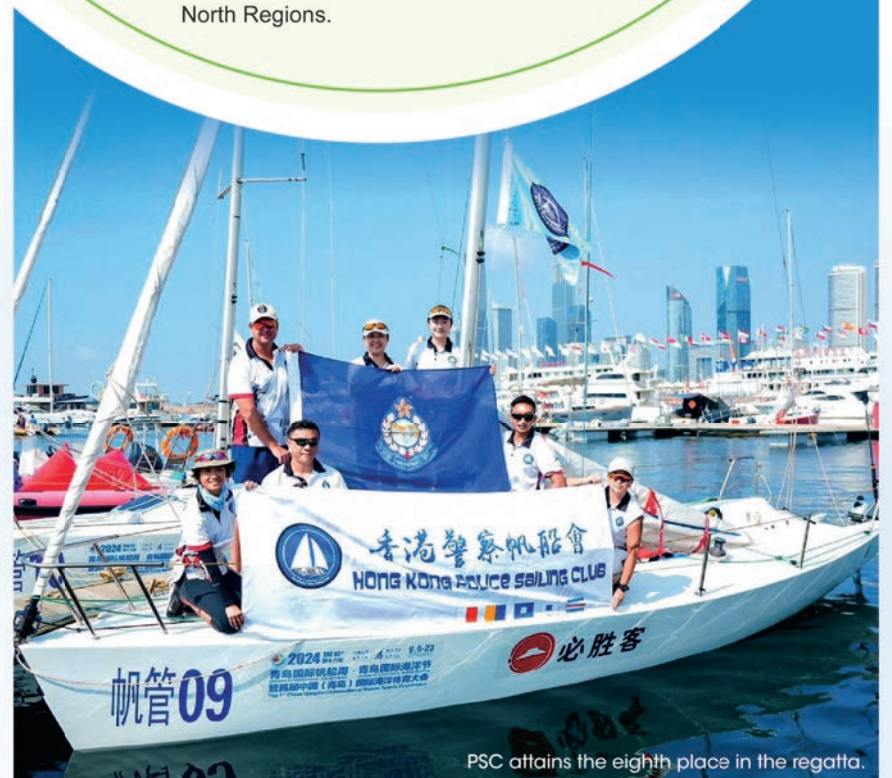
PSC attains the eighth place in the regatta.