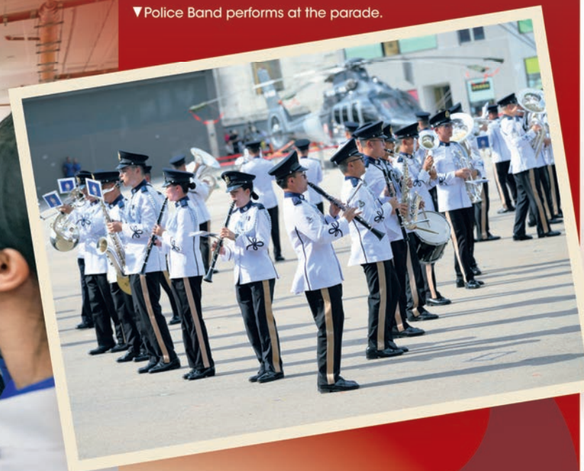
▼Police Band performs at the parade.