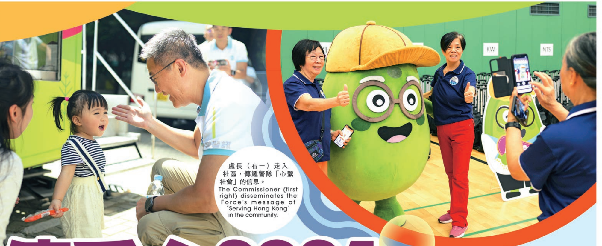
處長（右一）走入社區，傳遞警隊「心繫社會」的信息。 The Commissioner (first right) disseminates the Force's message of "Serving Hong Kong" in the community.