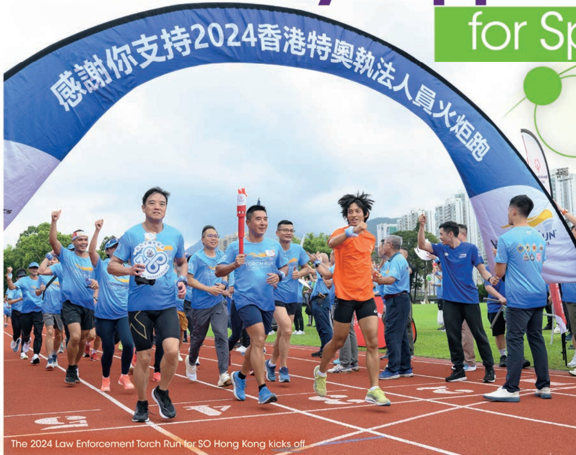
The 2024 Law Enforcement Torch Run for SO Hong Kong kicks off.

The Special Olympics (SO) Hong Kong, in collaboration with the Hong Kong, China Sports Association for Persons with Intellectual Disability and the seven disciplinary forces, namely the Force, Immigration Department, Customs and Excise Department, Correctional Services Department, Fire Services Department, Government Flying Service and Independent Commission Against Corruption, organised the 2024 Law Enforcement Torch Run for SO Hong Kong Kick-off Ceremony at Sha Tin Sports Ground on September 22 to raise fund for supporting the athletes taking part in the Summer/Winter Games of SO World Games, SO East Asia and local training.