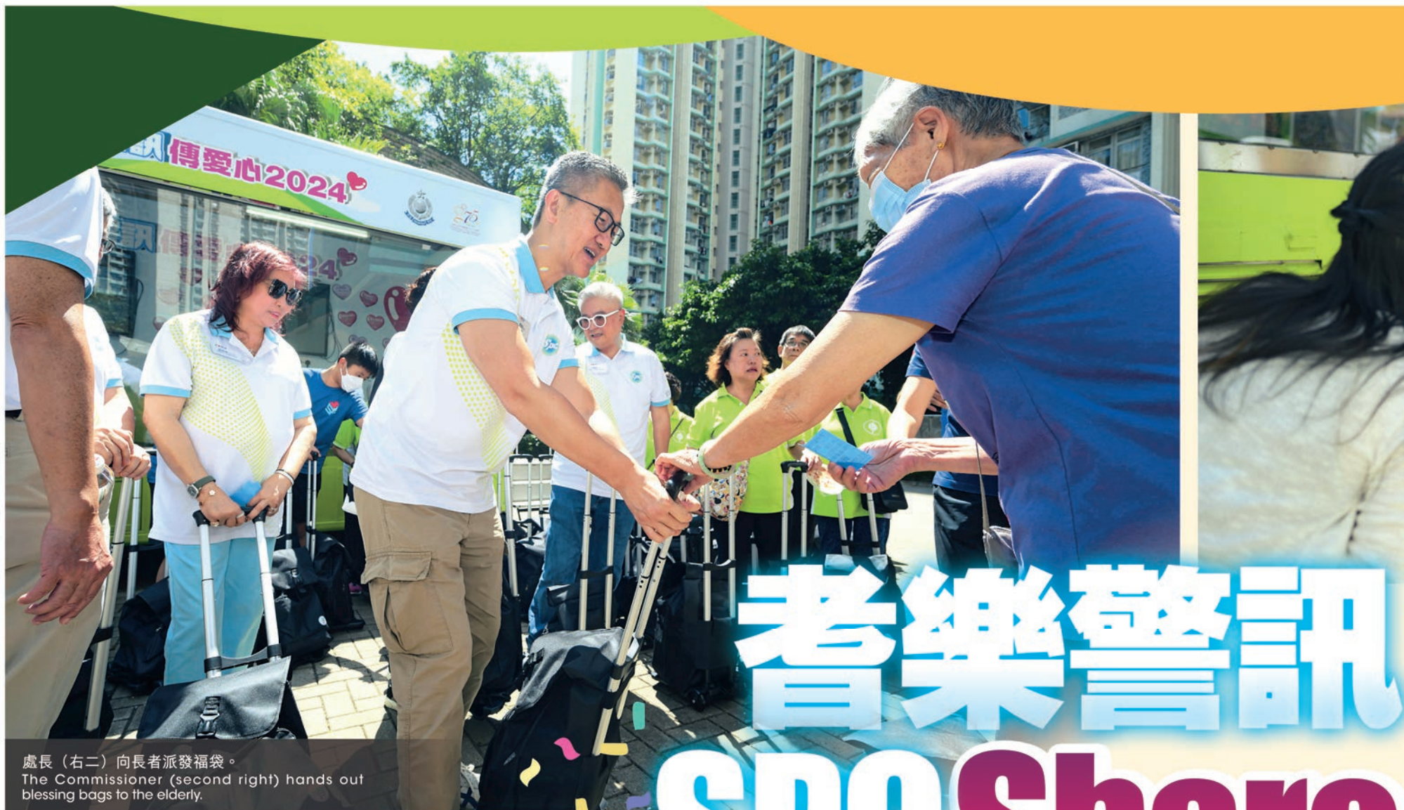
處長（右二）向長者派發福袋。 The Commissioner (second right) hands out blessing bags to the elderly.