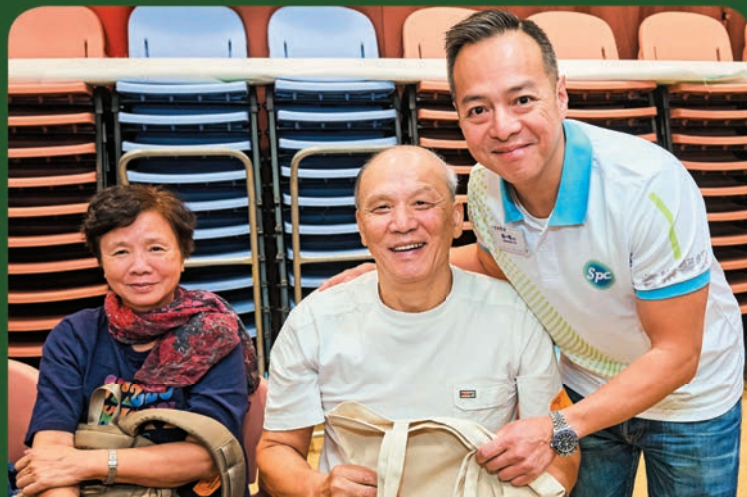
◀副處長（行動）周一鳴（右一）到長者中心派發福袋。 Deputy Commissioner (Operations) Chow Yat-ming (first right) distributing blessing bags in an elderly centre.