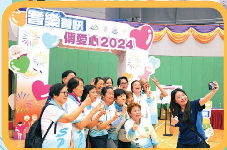
◀耆樂警訊傳愛心2024於十月五日開展。 SPC Share the Love 2024 starts on October 5.