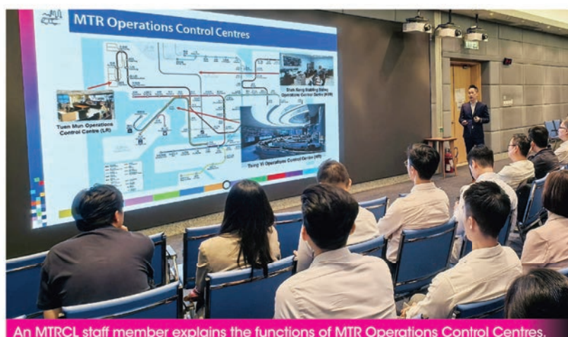
An MTRCL staff member explains the functions of MTR Operations Control Centres.

CISCC is actively planning for the first Advanced Module as the extension of the Foundation Module.