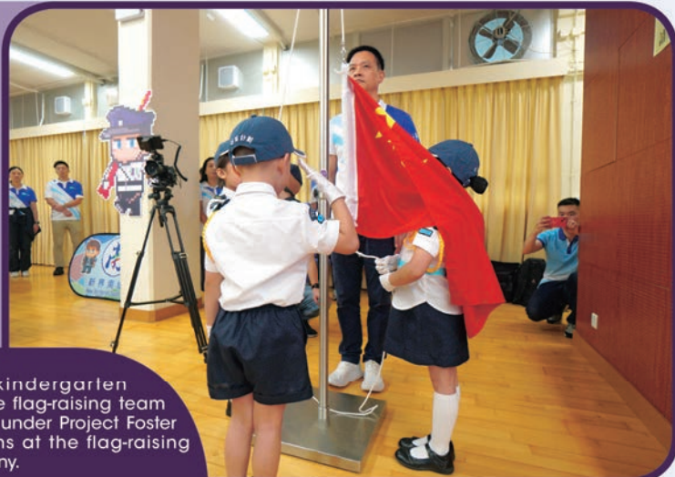
►The kindergarten Chinese flag-raising team trained under Project Foster performs at the flag-raising ceremony.