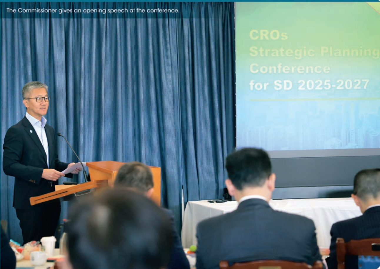
The Commissioner gives an opening speech at the conference.

The attendees discussed actively, exchanged views and considered the issues prudently. In the light of the discussion result from this conference, the Commissioner and the Senior Directorate Group will set the next Strategic Directions in their Strategic Planning Review Conference to be held in December.