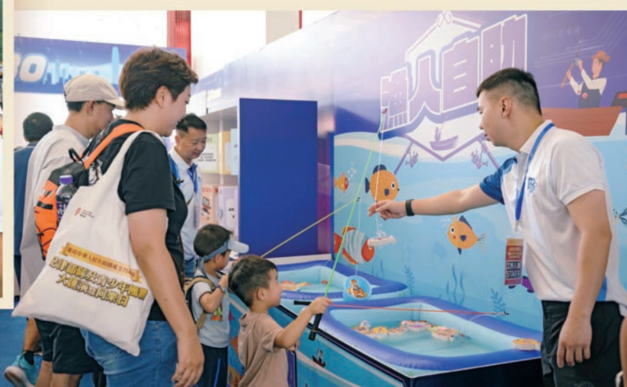
▶A child enjoying the game booth set up by the Force.