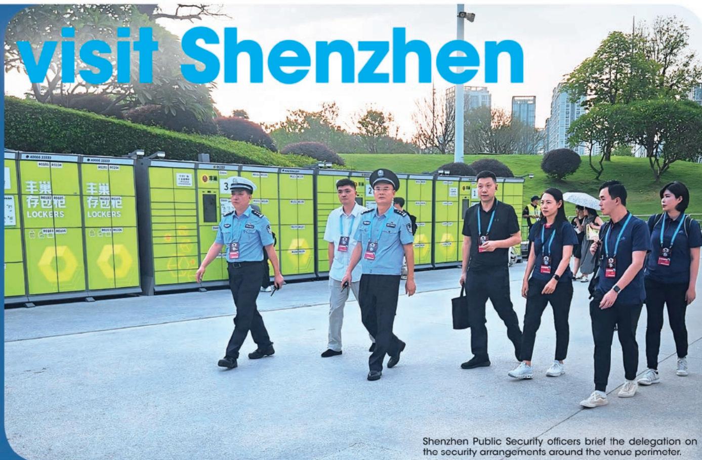
Shenzhen Public Security officers brief the delegation on the security arrangements around the venue perimeter.

Shenzhen Public Security officers' experience sharing greatly benefits the preparation work for the upcoming opening of Kai Tak Sports Park and the 15th National Games. The visit not only strengthened cooperation between the two authorities in managing large-scale events but also provided valuable reference for future events.