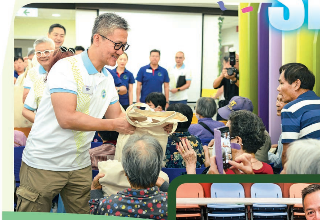
▲處長（左一）到訪長者中心，並派發載有食物和日用品的福袋。 The Commissioner (first left) visits an elderly centre to distribute blessing bags with food and daily necessities.