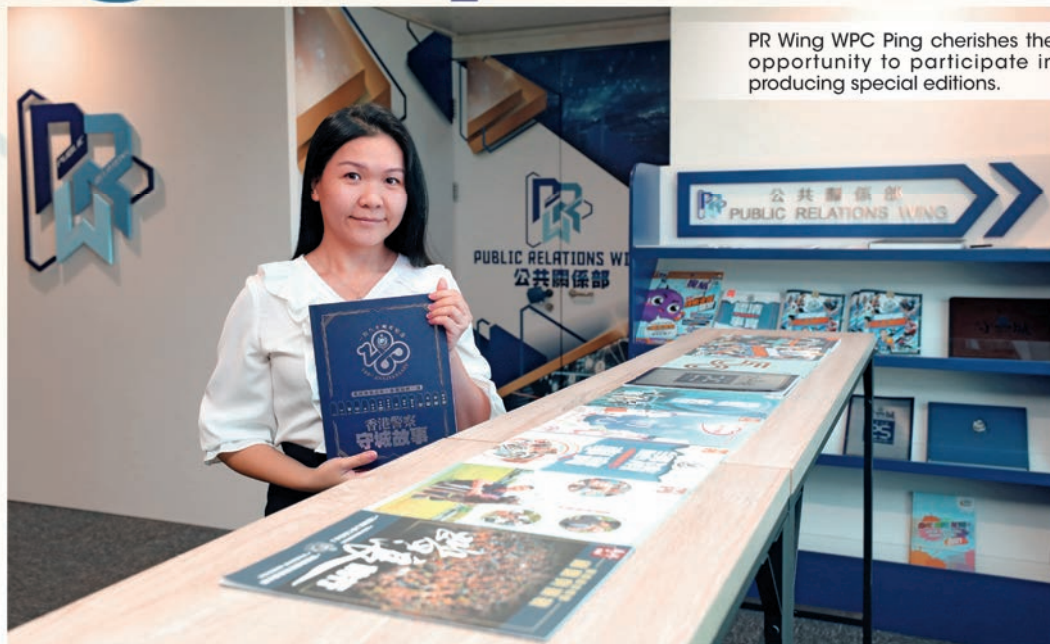
PR Wing WPC Ping cherishes the opportunity to participate in producing special editions.

Hard work pays. The first special edition was widely echoed and acclaimed. Subsequently, special editions were published when necessary, with more