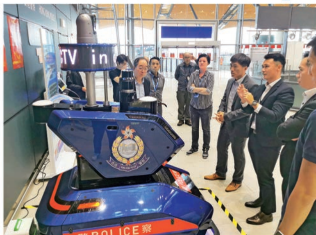
▲Force's first patrol robot will commence trial operation in the departure hall of the Passenger Clearance Building at the Hong Kong Port of HZMB.

To align with smart city development and enhance the efficiency of policing operations, the Information Systems Wing (ISW) has introduced the Force's first patrol robot, which will commence its six-month trial operation in mid-October in the departure hall of the Passenger Clearance Building at the Hong Kong Port of the Hong Kong-Zhuhai-Macao Bridge (HZMB).