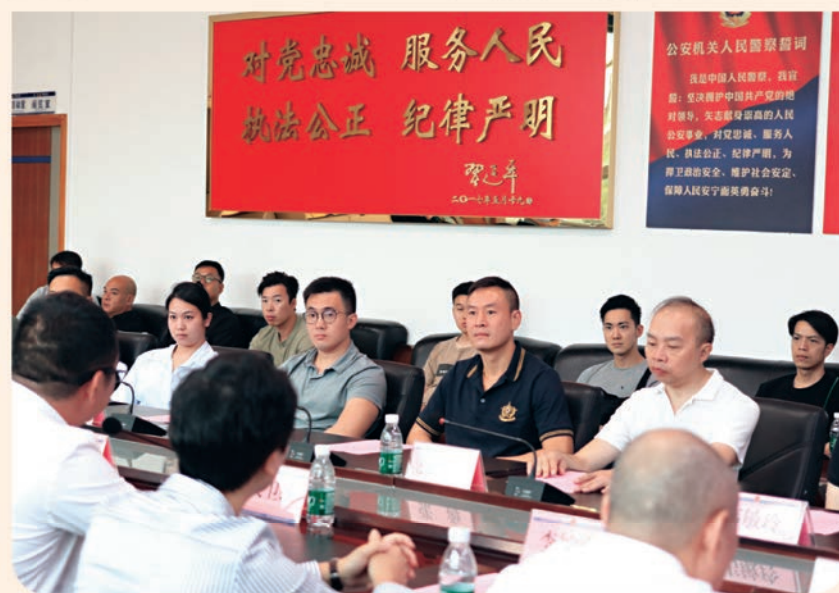
▲ The delegation exchanges views with officers of a police station at Jiangmen.