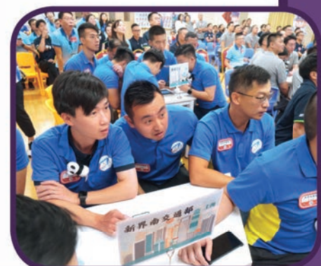
▲Over 100 NTS officers join the on-site quiz on NS knowledge.