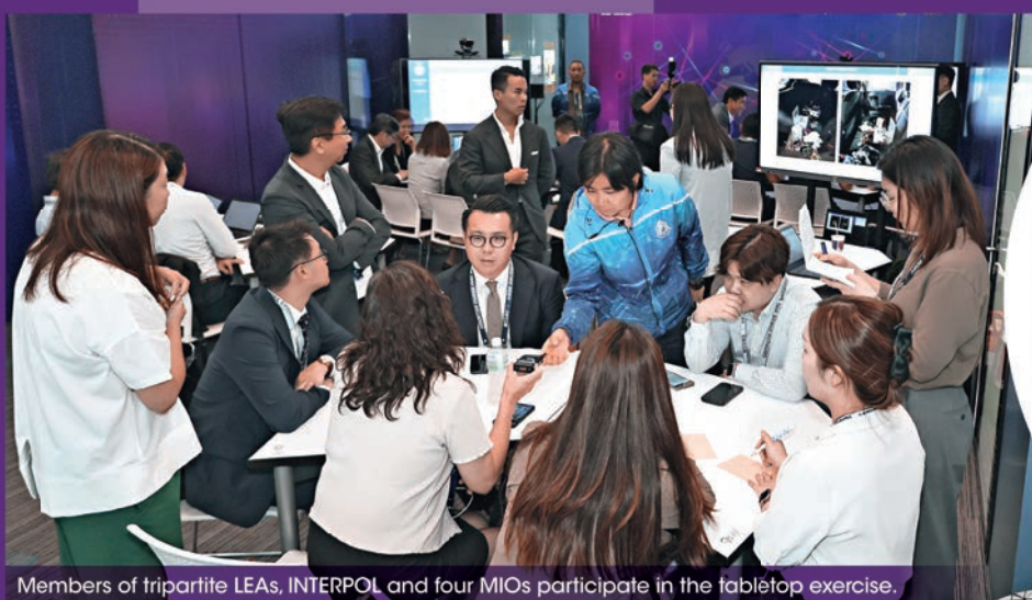
Members of tripartite LEAs, INTERPOL and four MIOs participate in the tabletop exercise.

KPMG Advisory (Hong Kong) Limited was invited for the first time to provide insights and participate in the exercise as a member of Cyber Security Action Task Force to promote collaboration among public and private organisations.