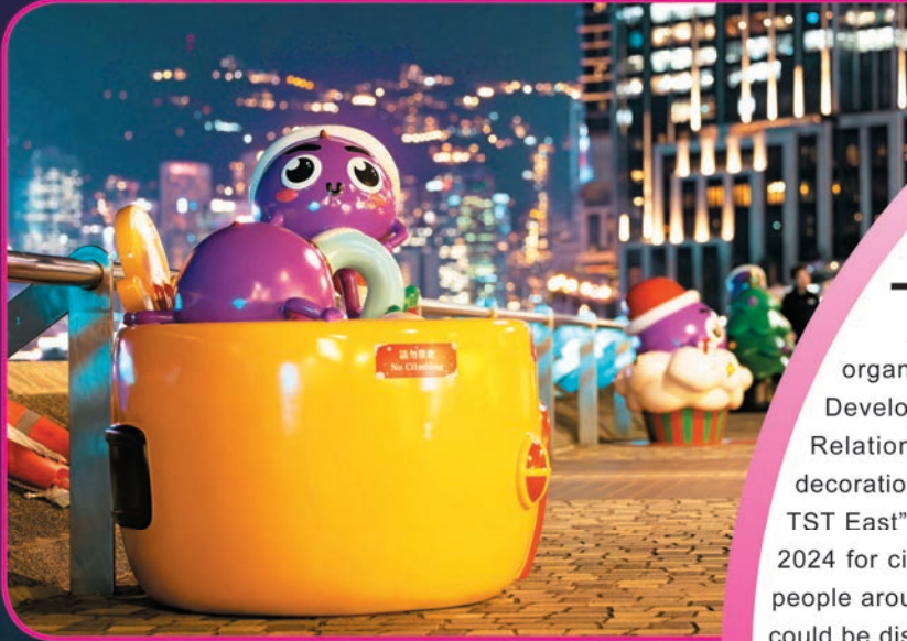
▲An art installation featuring "The Little Grape" at the promenade

►Citizens can collect stamps unique to each hut using the complimentary stamp cards.