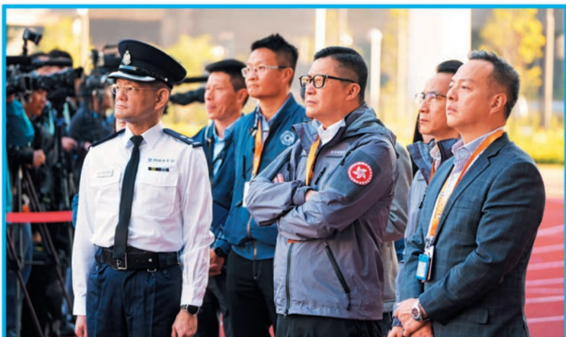
保安局局長鄧炳強（右三）、保安局常任秘書長李百全（右二）、副處長（行動）周一鳴（右一）及反恐專責組高級警司梁偉基（左一）視察演習情況。