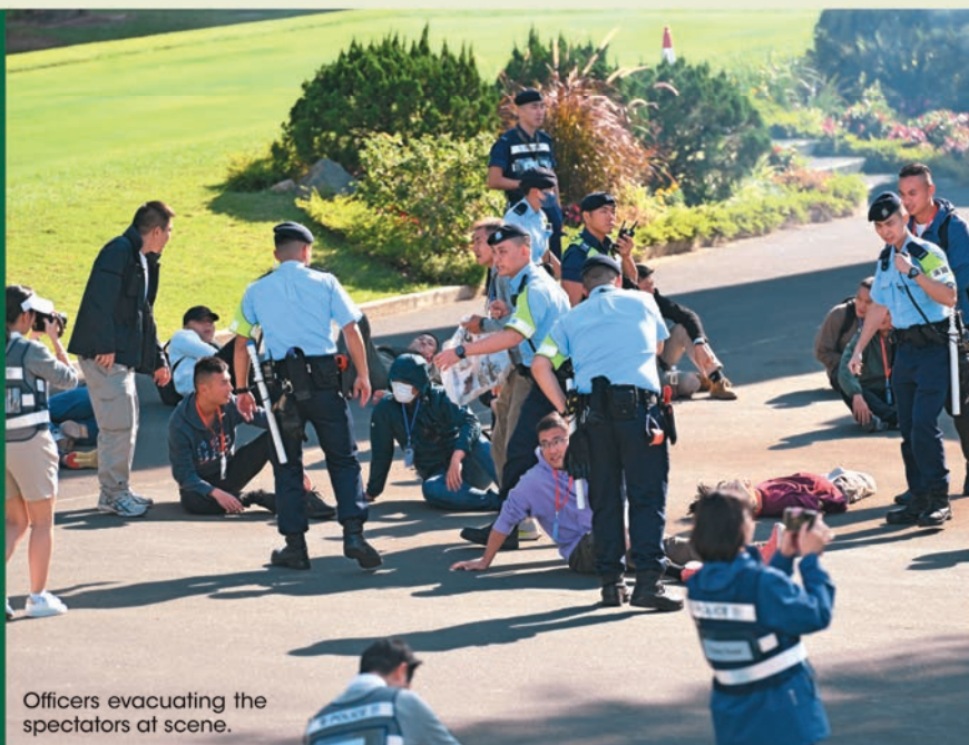
Officers evacuating the spectators at scene.

New Territories North (NTN), Counter Terrorism and Major Incidents Bureau of