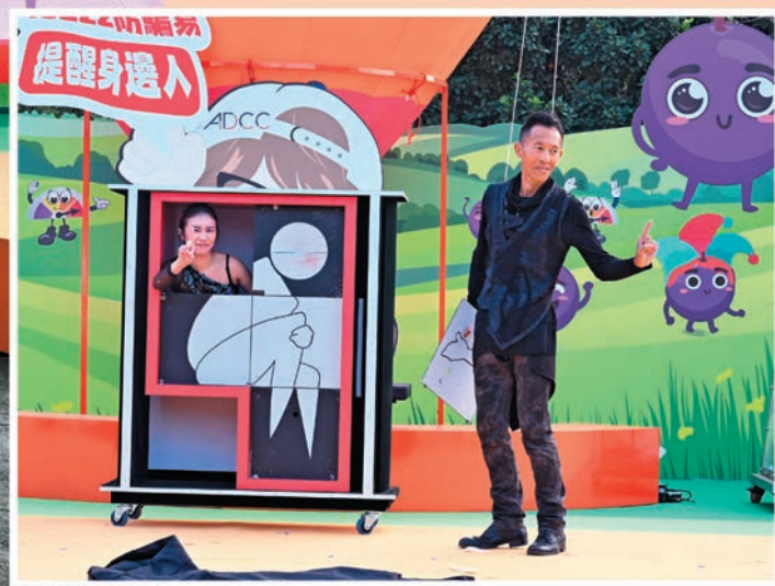
◀魔術師獻上精彩的魔術表演。 The carnival features an exciting magic performance.