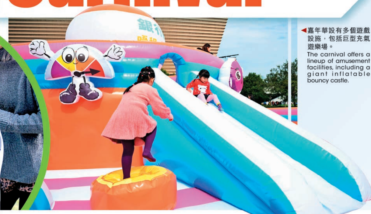
◀嘉年華設有多個遊戲設施，包括巨型充氣遊樂場。 The carnival offers a lineup of amusement facilities, including a giant inflatable bouncy castle.

The Commercial Crime Bureau, Cyber Security and Technology Crime Bureau (CSTCB) and Financial Intelligence and Investigation Bureau co-organised for the first time the Anti-Scam Carnival at the West Kowloon Cultural District on December 14 and 15, 2024 to enhance public awareness of scam prevention, money laundering and cyber security threats through thematic game booths, the interactive Anti-Scam Hub and various performances.