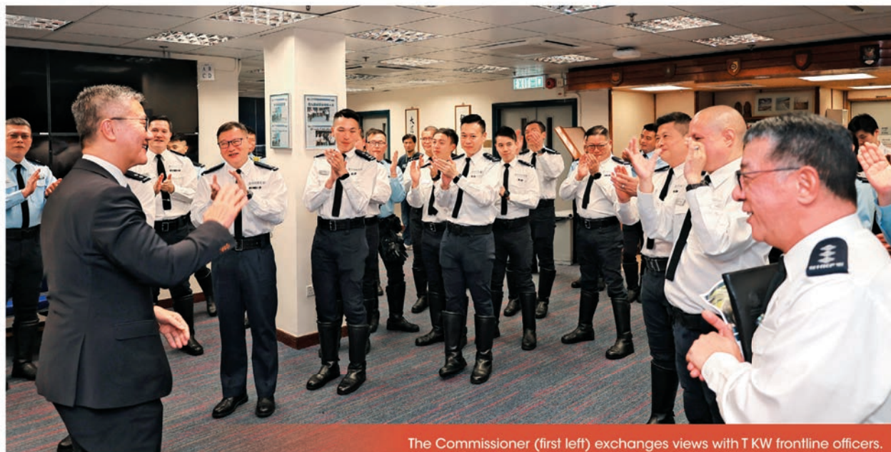
The Commissioner (first left) exchanges views with T KW frontline officers.

The Commissioner visited the Emergency Unit of New Territories South (EU NTS) on November 20, 2024 to understand the in-house training and tactics for officers to more effectively deal with incidents involving suspected mentally disordered persons and targeted vehicles. He also recognised EU's efforts in arranging regular training. Moreover, the Commissioner exchanged with the officers on their daily challenges and responded to their suggestions on work procedures, human resources and enhancing public safety.