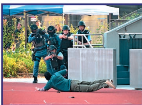
ICTU's CT exercise codenamed WISDOMLIGHT is held at the Youth Sports Ground in KTSP.

Various community groups from different sectors and age groups were also invited to participate voluntarily, with a view to further promoting the "whole-of-community" approach in CT and reminding the public to "spot and report" by paying more attention to suspicious circumstances and apply the advisory of "Run, Hide, Report" in the event of emergency.