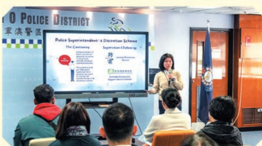
A KE officer discusses with NEC community leaders on child protection.