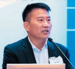
商罪科總警司游健雄為研討會致開幕辭。

商業罪案調查科（商罪科）反訛騙及洗黑錢情報工作組於二零二四年十一月二十九日舉辦反訛騙及洗黑錢情報工作組培訓研討會，吸引近200名來自金融管理局、香港銀行公會、香港海關、廉政公署和金融機構的代表出席。