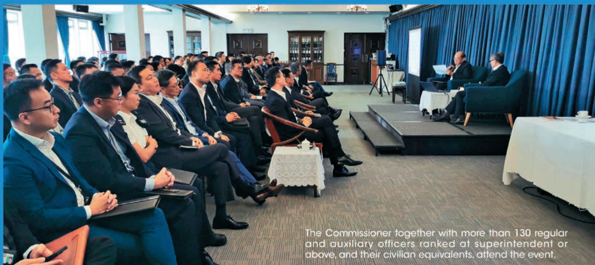
The Commissioner together with more than 130 regular and auxiliary officers ranked at superintendent or above, and their civilian equivalents, attend the event.