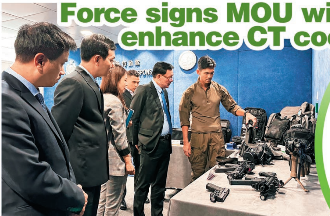
▲ An officer introduces the Force's counter terrorism capabilities and equipment to the Vietnamese delegation.

Director of Vietnam's Homeland Security Department under Ministry of Public Security