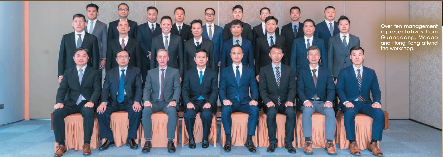
Over ten management representatives from Guangdong, Macao and Hong Kong attend the workshop.

The participants observed a tabletop exercise held by HKPF, shared their experience in organising major sports events and had an understanding on the progress of preparation within the three territories for coordinating and optimising respective operational plans.