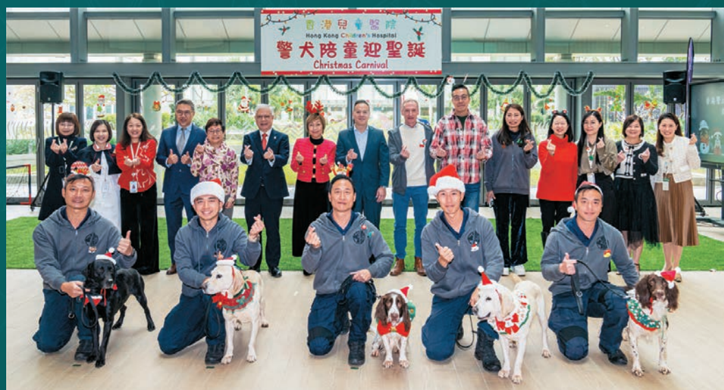
► Police dogs and their handlers visit Children's Hospital to spread love and trust at Christmas.