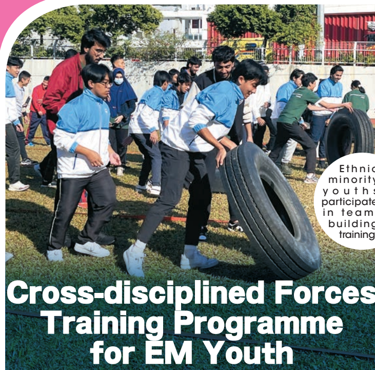
Ethnic minority youths participate in team-building training.