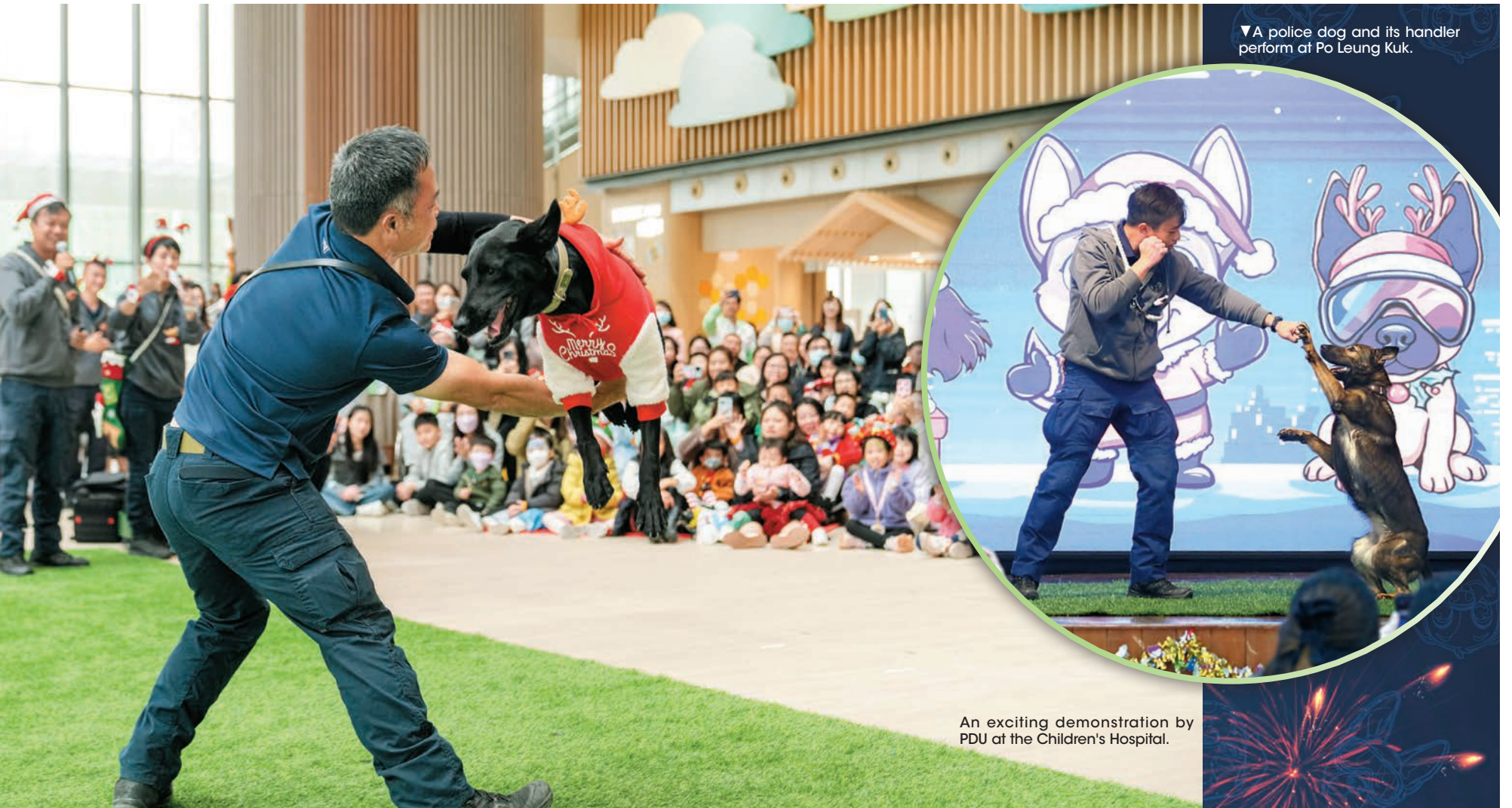
▼ A police dog and its handler perform at Po Leung Kuk.