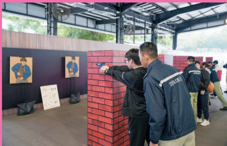
◀The Simulated Shooting Range Station is first introduced in READ for participants to learn about the Force's firearm training.

brought its second Community Outreach Recruitment Express (CORE) into the community by setting up recruitment information booth with the theme of panda in Yuen Long District between January 4 and 5, 2025. The three Recruitment Spokespersons shared the latest recruitment information for the public to gain better knowledge of the job requirements and selection process. The Interactive Police Unit Display at the venue also showcased the diversity of policing work. Applicants could attend the on-spot group interview for Police Constable inside the Panda Recruitment Express. They would receive a limited edition calendar produced collaboratively by RECDIV and the Police Dog Unit. The response was overwhelming with over 100 applications received.