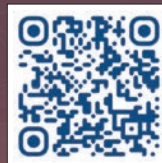
掃描觀看《毛敵拍檔》

近年警犬隊除了日常反罪惡及協助前線人員負責大型活動中的安保工作外，還積極與社會互動，建立良好的警民關係。警犬隊藉着成立75周年及聖誕節兩個喜慶日子，前往不同社福機構展開親善關懷活動，包括保良局和兒童醫院，以爭取社區對警務工作的信任和支持。