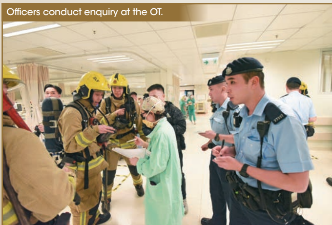
Officers conduct enquiry at the OT.

More than 200 officers and personnel participated in this exercise, which was the first one in the territory involving mass evacuation of patients from an operating theatre (OT). The exercise simulated a fire and chemical leakage inside the OT which required immediate evacuation. Officers of EU and FSD conducted evacuation at the OT whilst officers of TSDIV promptly set up an inflatable command tent outside the hospital to serve as the command post. A digital camcorder was used to broadcast live footage to the command post for officers to timely assess the situations and make prompt and appropriate deployment.