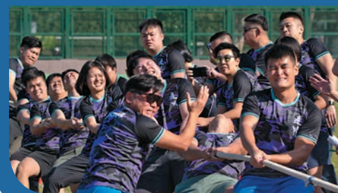
◀ Officers competing at the tug-of-war.