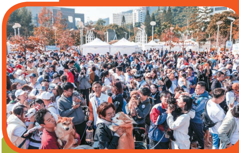
◀ 333 dog owners and their dogs set the record of “Most People Kissing Dogs Simultaneously”.