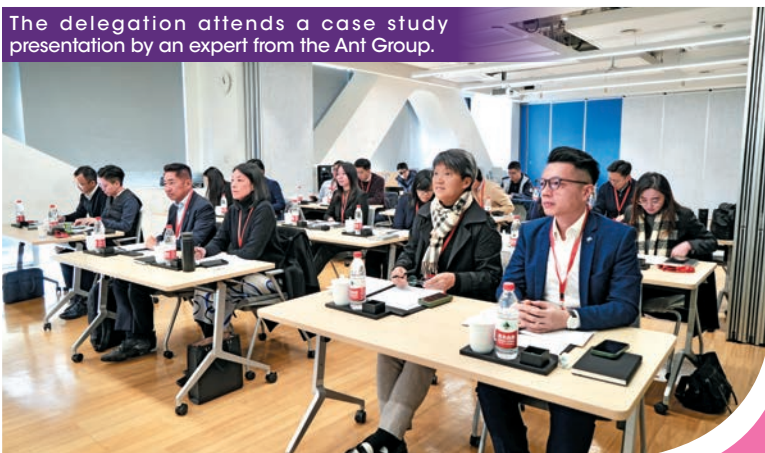
The delegation attends a case study presentation by an expert from the Ant Group.