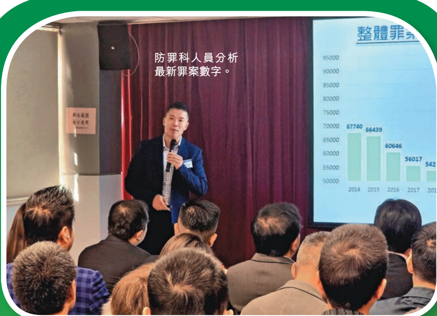
防罪科人員分析最新罪案數字。