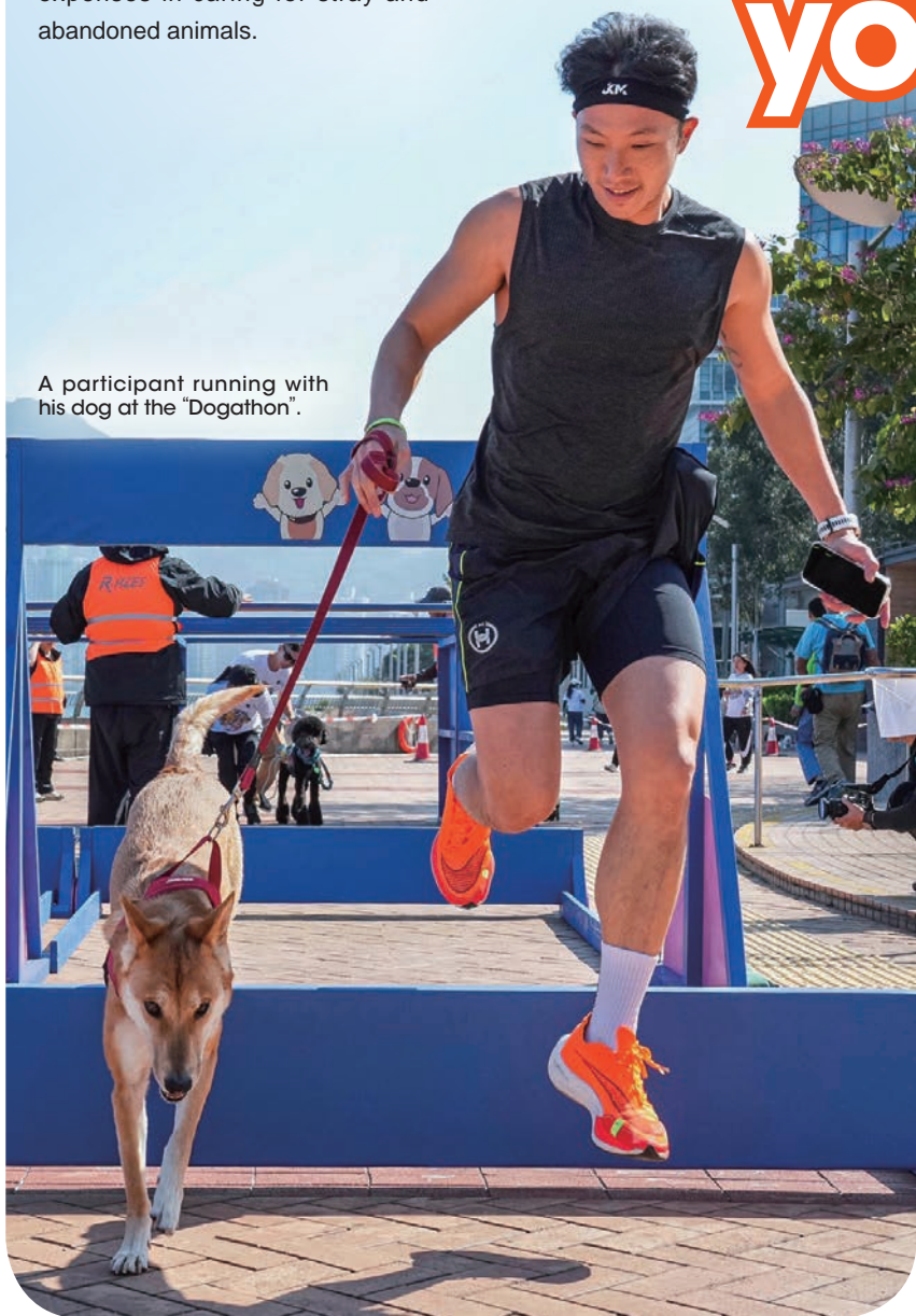
A participant running with his dog at the “Dogathon”.