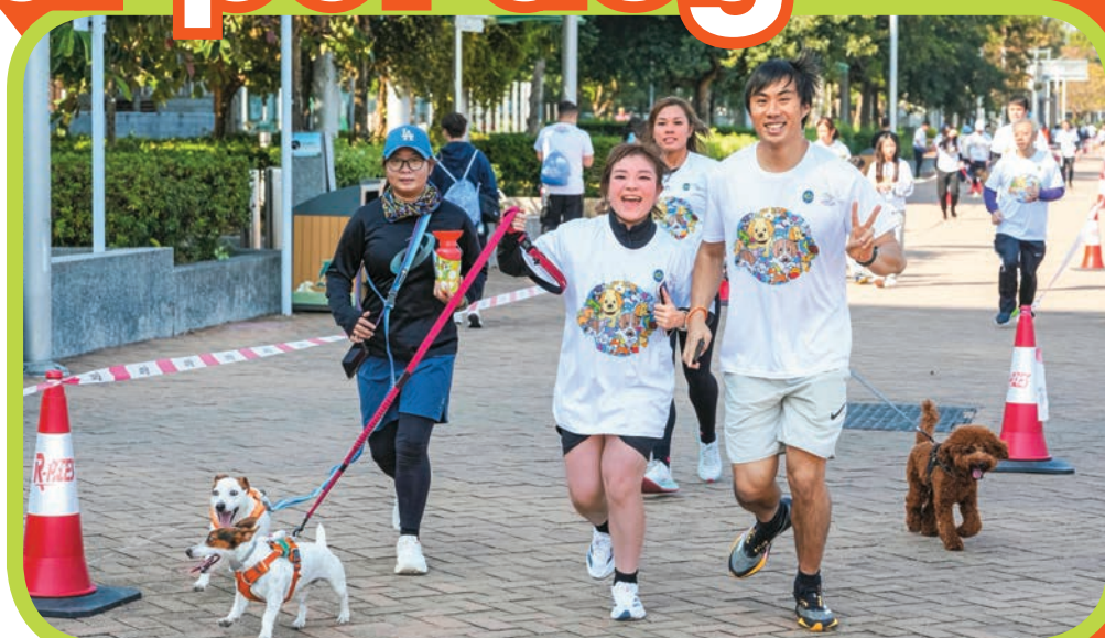
▲ The “Dogathon” attracts over 1 000 participants.