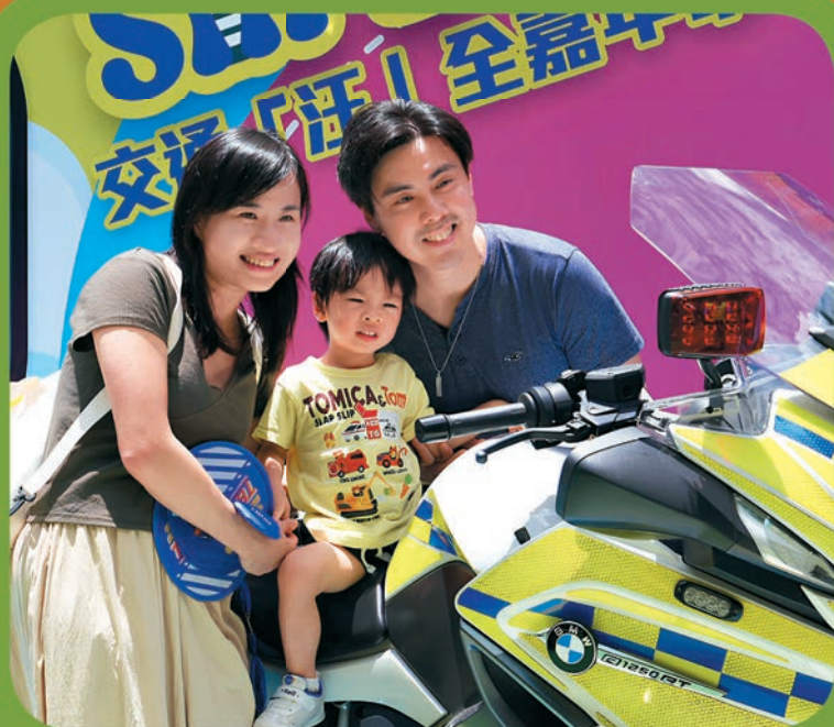
▲ A child experiences the thrill of riding a police motorcycle with his parents.