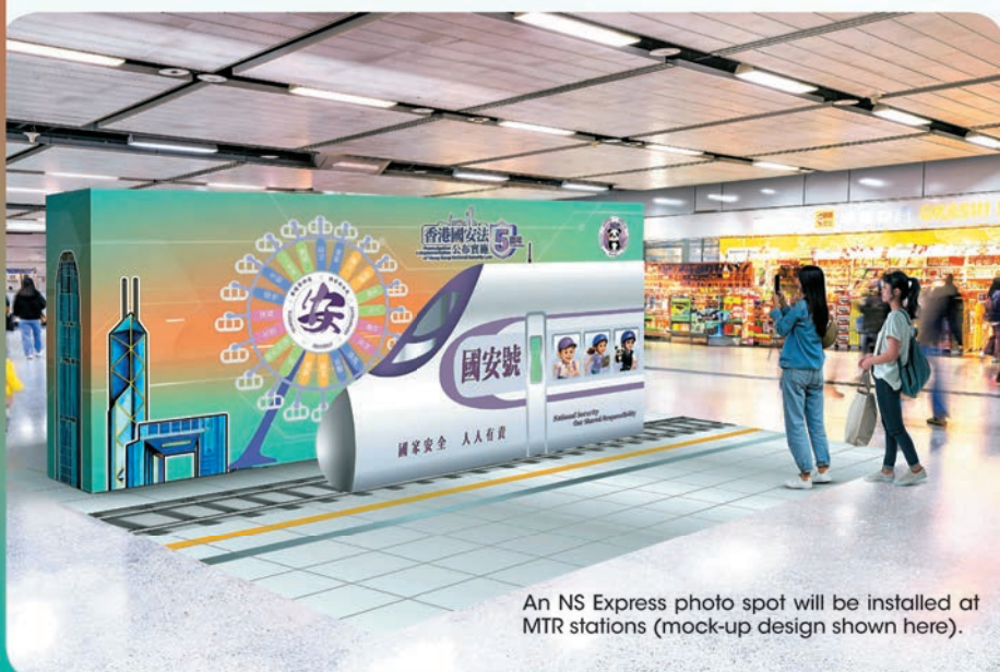
An NS Express photo spot will be installed at MTR stations (mock-up design shown here).

This year marks the 5th anniversary of the implementation of the Hong Kong National Security Law (HKNSL). National Security Department will organise a series of publicity events in collaboration with various Force units and police clubs to enhance national security (NS) awareness among officers and the public.