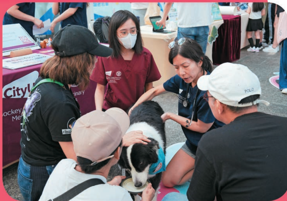
▲ Professional veterinarians share animal care knowledge with the participants.

The carnival attracted nearly 10 000 participants, many of whom brought along their own pets to show solidarity with the Force and animal protection organisations. Over 20 caring individuals applied on-site to adopt animals. NTS and NTN will host another Animal Care Market at Hong Kong Science Park on June 14. Your participation and support are most welcome.