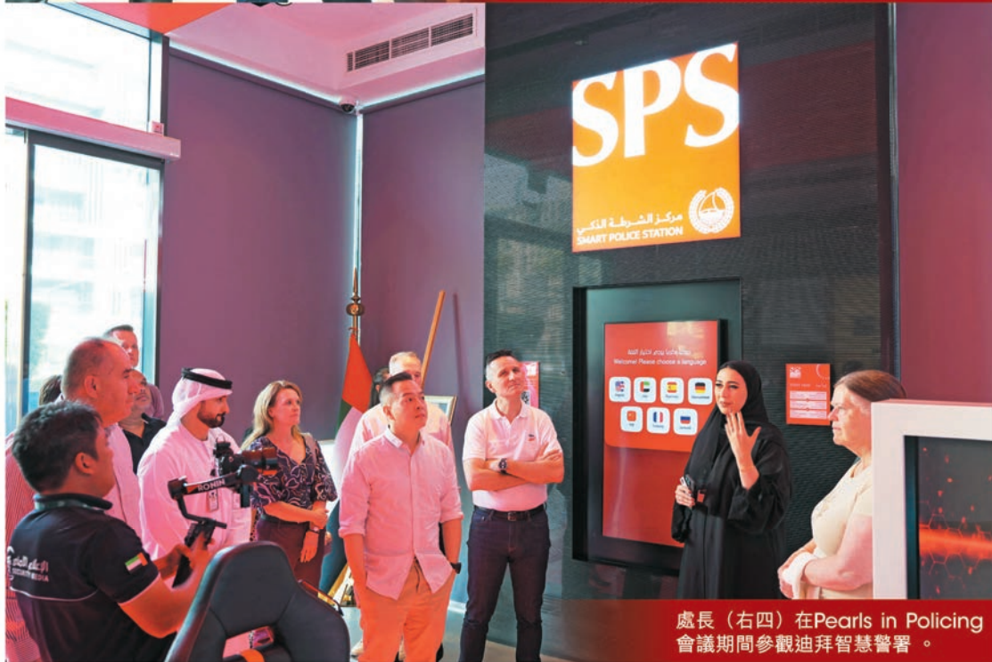
處長（右四）在Pearls in Policing會議期間參觀迪拜智慧警署。