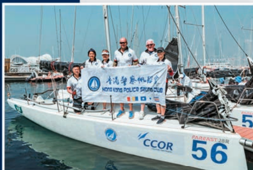
▲The PSC athletes secure a fourth-place finish in one of the races.