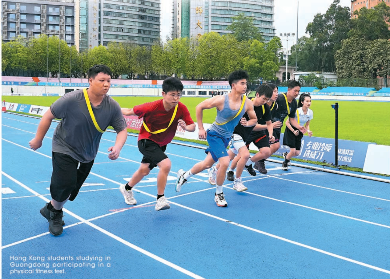
Hong Kong students studying in Guangdong participating in a physical fitness test.