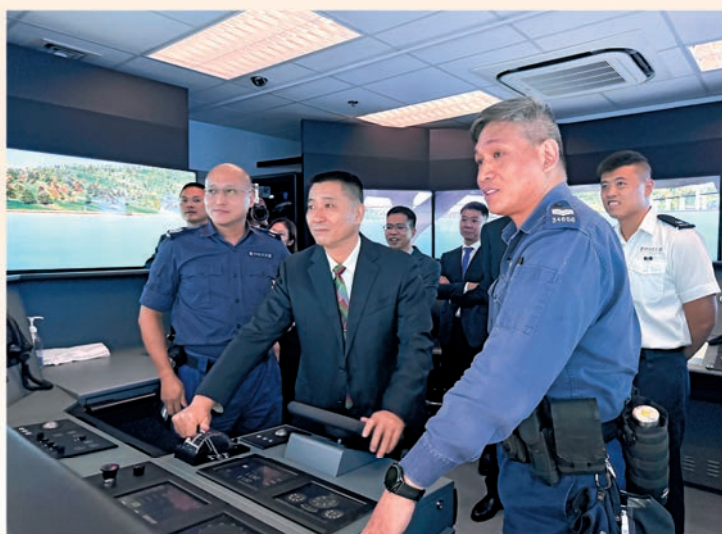
▲GDCG delegation touring the Marine Police Training School.

Administration. Working under the Boundary Liaison Mechanism between the Force and the Mainland authority, MAR and GDCG have been combatting cross-border illegal activities together over the years. Taking the year 2023 as an example, GDCG collaborated with National Immigration Administration, Guangdong Provincial Public Security Department, and the Force to effectively combat the influx of non-ethnic Chinese illegal immigrants entering Hong Kong through the sea route within a few months.