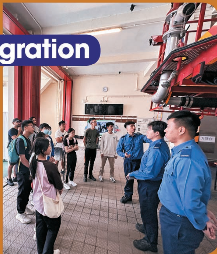
► Participants visit Mong Kok Fire Station to learn more about disciplined services.

Through such cross-district collaboration, participants may learn about diverse career options, exchange insights and build friendship with their peers from other Districts. KW will further strengthen collaboration among Districts and integrate resources to create a harmonious society with NEC individuals together.