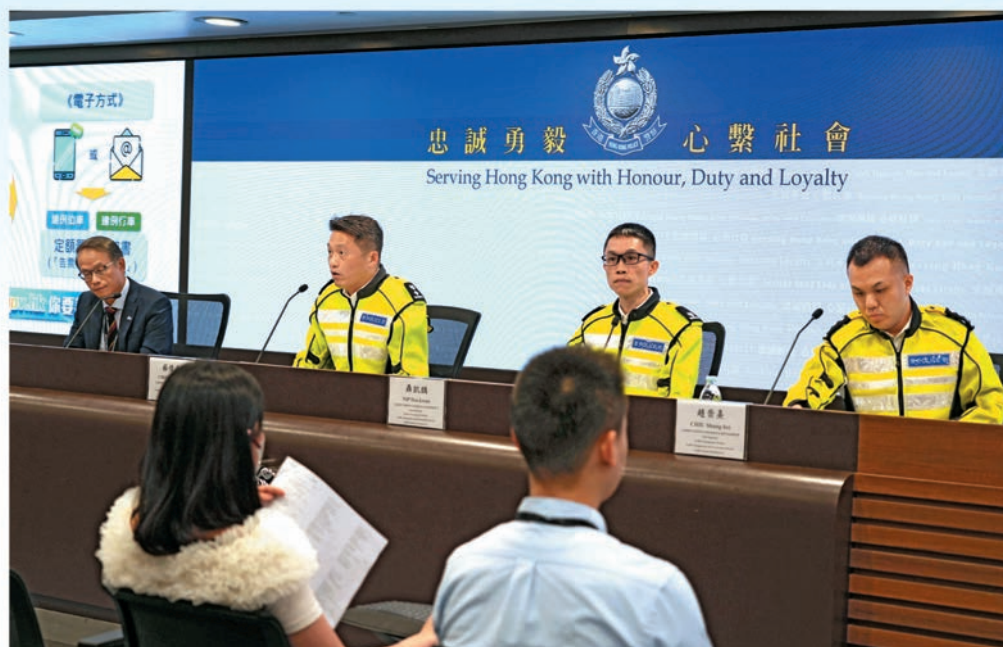
TBHQ holds a press conference to explain the specific arrangements of FPNs digitalisation.

The Force have joined the SMS Sender Registration Scheme. All e-FPNs SMS will display "#HKPF-eTT" as the sender ID. e-FPNs will never contain hyperlinks. Do not click if you receive so-called "penalty notice" with hyperlinks, and do not provide any personal or bank account information. Moreover, the platform website will always end with the ".gov.hk" domain.