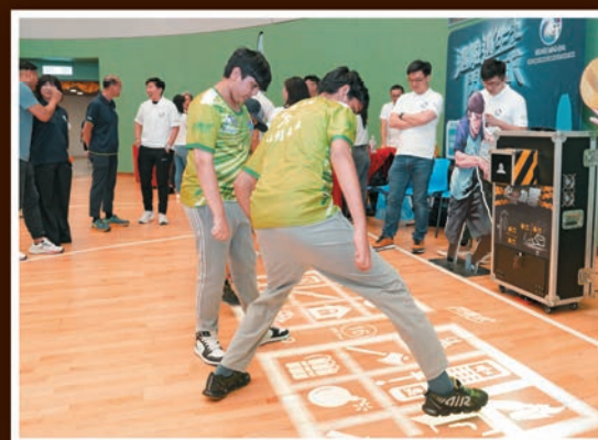
◀Non-ethnic Chinese teenager learning about the "Run, Hide, Report" concept.