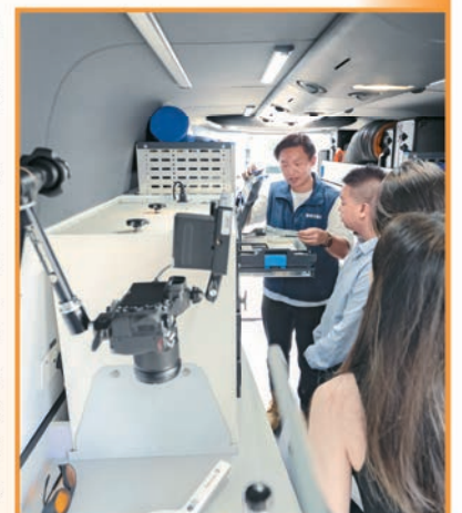
▲ An officer from IB introduces the various instruments and equipment inside the Crime Scene Investigation Mobile Laboratory to the participants.

Additionally, RECDIV announced the introduction of "PI DSE 4+ Express", effective from July 1. Those who have obtained Level 4 or above in Chinese Language and English Language subjects in the Hong Kong Diploma of Secondary Education Examination, or equivalent, and have passed the Aptitude Test of the Common Recruitment Examination will be deemed to have passed the PI Written Examination and will gain direct access to the Extended Interview. This measure allows candidates meeting the above requirements to join the Force as soon as possible, thereby enhancing the Force's capacity to attract high-calibre candidates in the job market.