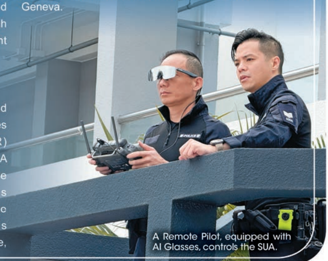
A Remote Pilot, equipped with AI Glasses, controls the SUA.

Cybersecurity, Blockchain & Internet of Things" category during the 50th International Exhibition of Inventions of Geneva.