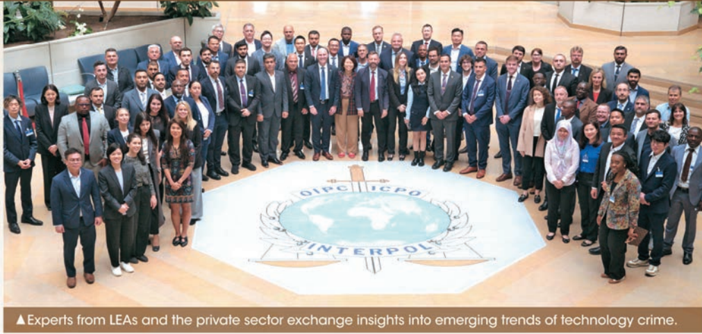
▲ Experts from LEAs and the private sector exchange insights into emerging trends of technology crime.