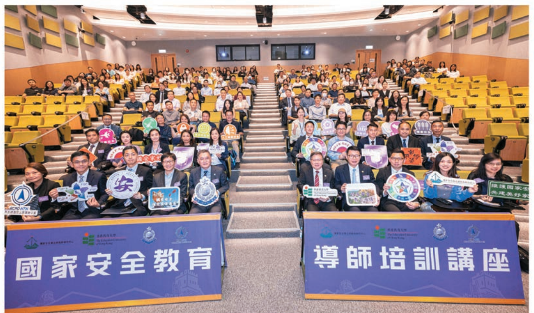
▲ NTN co-hosts the seminar with EdUHK.

The seminar attracted the participation of over 200 educators from 67 institutions. On the same day, the NSpeed NS Express Promotional Truck also arrived at EdUHK to disseminate NS messages.