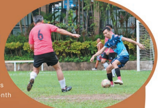
Players compete fiercely to score a goal.

The Force management attended to cheer for the players and presented the awards to respective winning teams after the games. They also thanked the helpers for their assistance in making the competition a success.