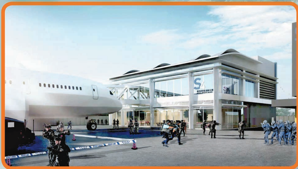
◀ 仿真機場及飛機概念圖。 Conceptual image of mock airport and airliner.