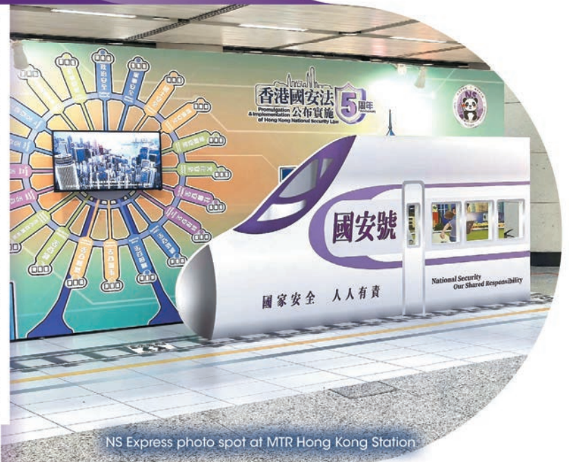
NS Express photo spot at MTR Hong Kong Station