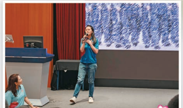
Carelinks Cadre conducts stress management seminar for Recruit Police Constables.

but also in the unity of its 30 000 members. Every sincere act of listening and greeting contributes to a collective effort to safeguard each other's mental well-being, making the team the most solid backing for all."