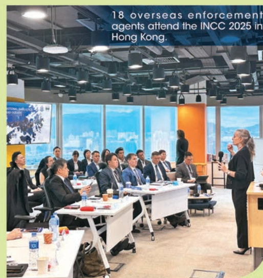
18 overseas enforcement agents attend the INCC 2025 in Hong Kong.

The course covered a number of topics on anti-drug enforcement issues, aiming to strengthen global cooperation in combatting drug trafficking. Participants exchanged their law enforcement experiences and shared the latest drug trends, enforcement operations and anti-drug strategies of their jurisdictions.