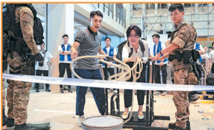
▲ Officers of the Marine Region's Small Boat Division interact with a participant through a game.

(5) Crime Scene Investigation Mobile Laboratory