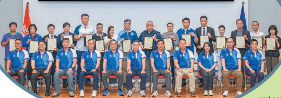
Officers are presented with the Awards for Arts for their excellence.