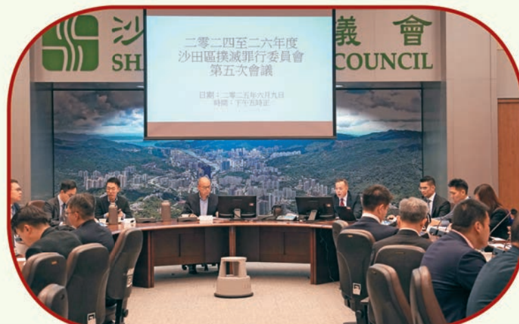
◀ The Commissioner meets with community stakeholders as STDIST is launching "Project C-Smart".

The smooth implementation of the project reflects the active support of all stakeholders and their trust in the Force, fully demonstrating the consensus on security issues between the community and the Force.